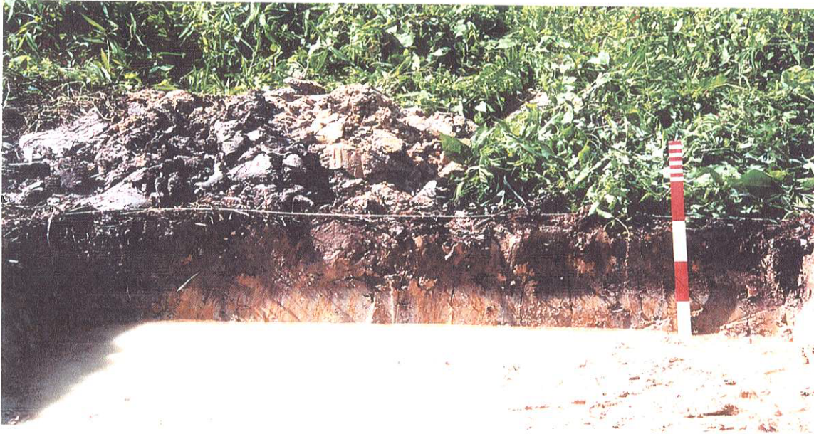
(B) Test Pit 5 West Section