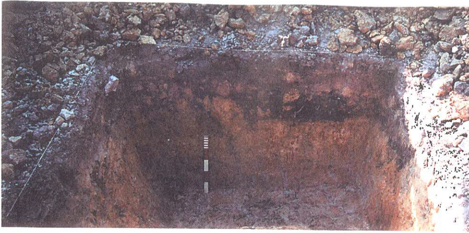
(A) Test Pit 4 West Section