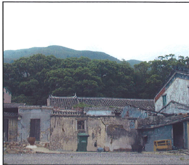
Fung Shui Wood - Wo Keng Shan