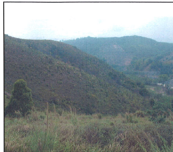
Grassland with Low Shrub