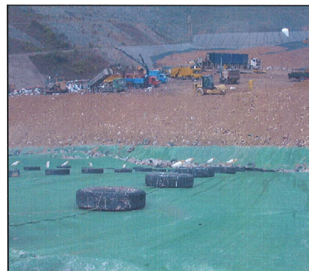
Urbanised / Disturbed