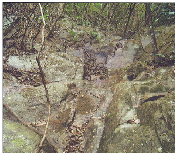
Lin Ma Hang Stream - Upper reach