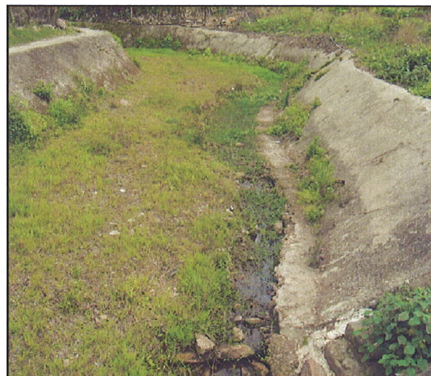
Lin Ma Hang Stream - Lower reach