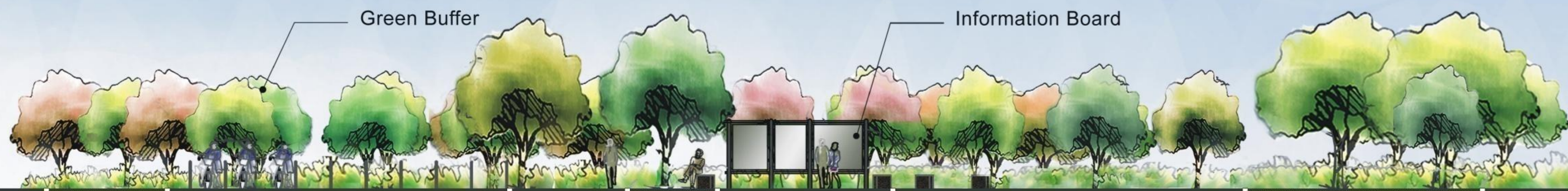
R8 Elevation View