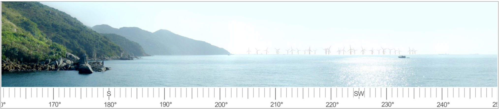
View displaying the 3D Model of the wind farm with Mitigation at Day 1 Operation