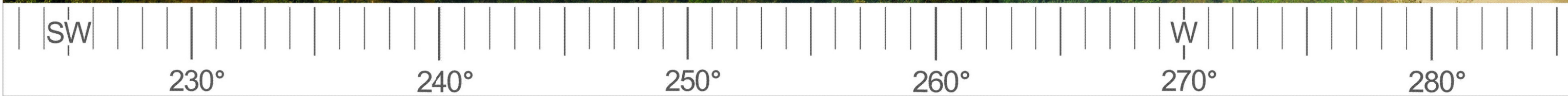
VP 5 - View of the GRS looking from hiking trail on Castle Peak - Existing condition at the Development Site.