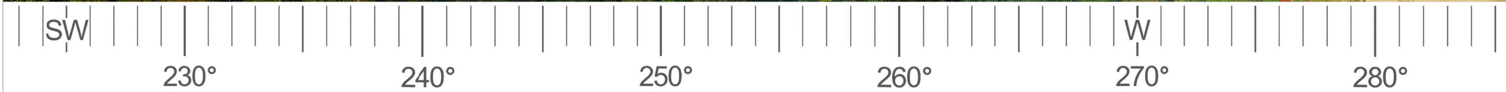
View displaying the wire frame 3D Model of the Gas Receiving Station without Mitigation.