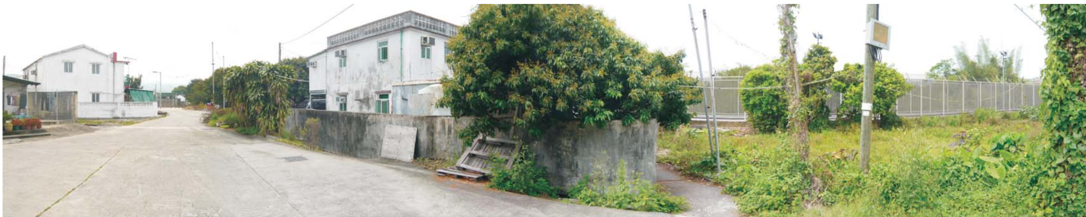
View displaying the 3D Model of the Project without Mitigation