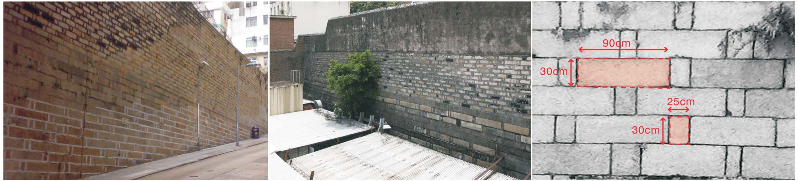
ALONG OLD BAILEY STREET