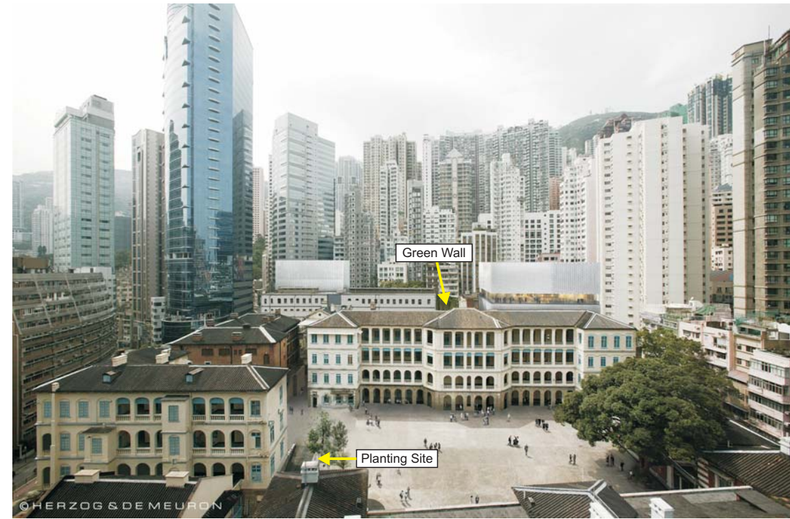
View towards Project Site with Mitigation Measures on Day 1 of Operation*