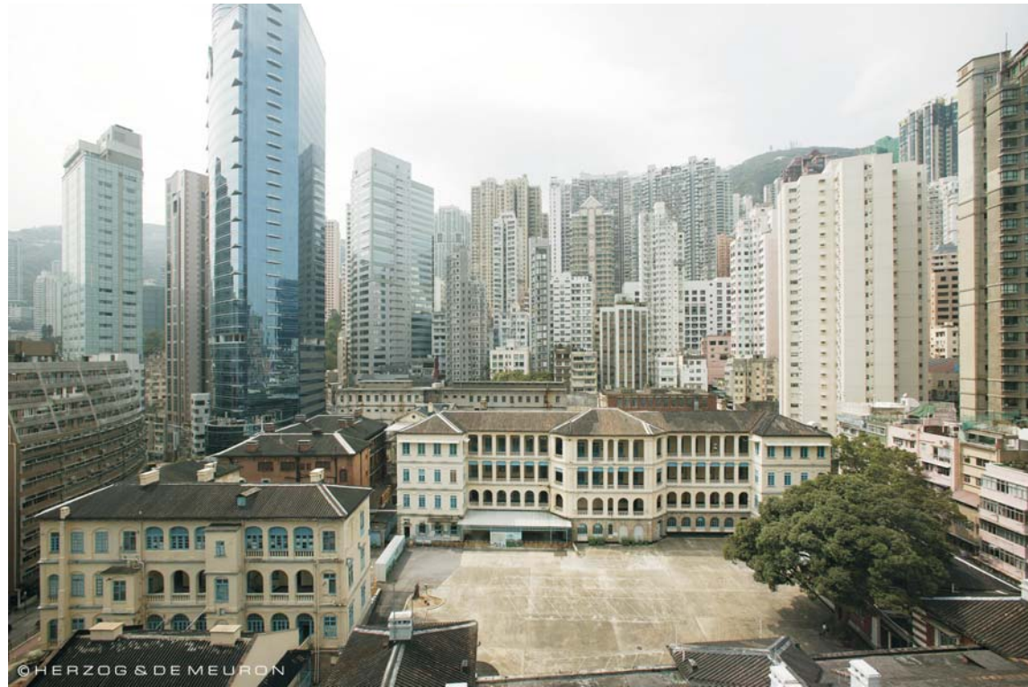
Existing view towards Project Site