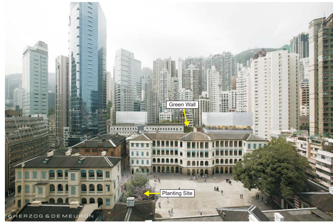
View towards Project Site with Mitigation Measures at Year 10 of Operation*