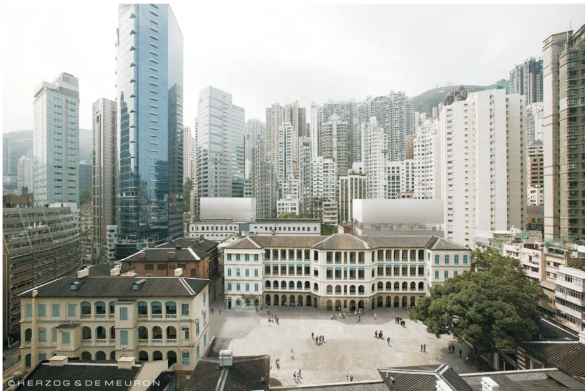
View towards Project Site without Mitigation Measures on Day 1 of Operation