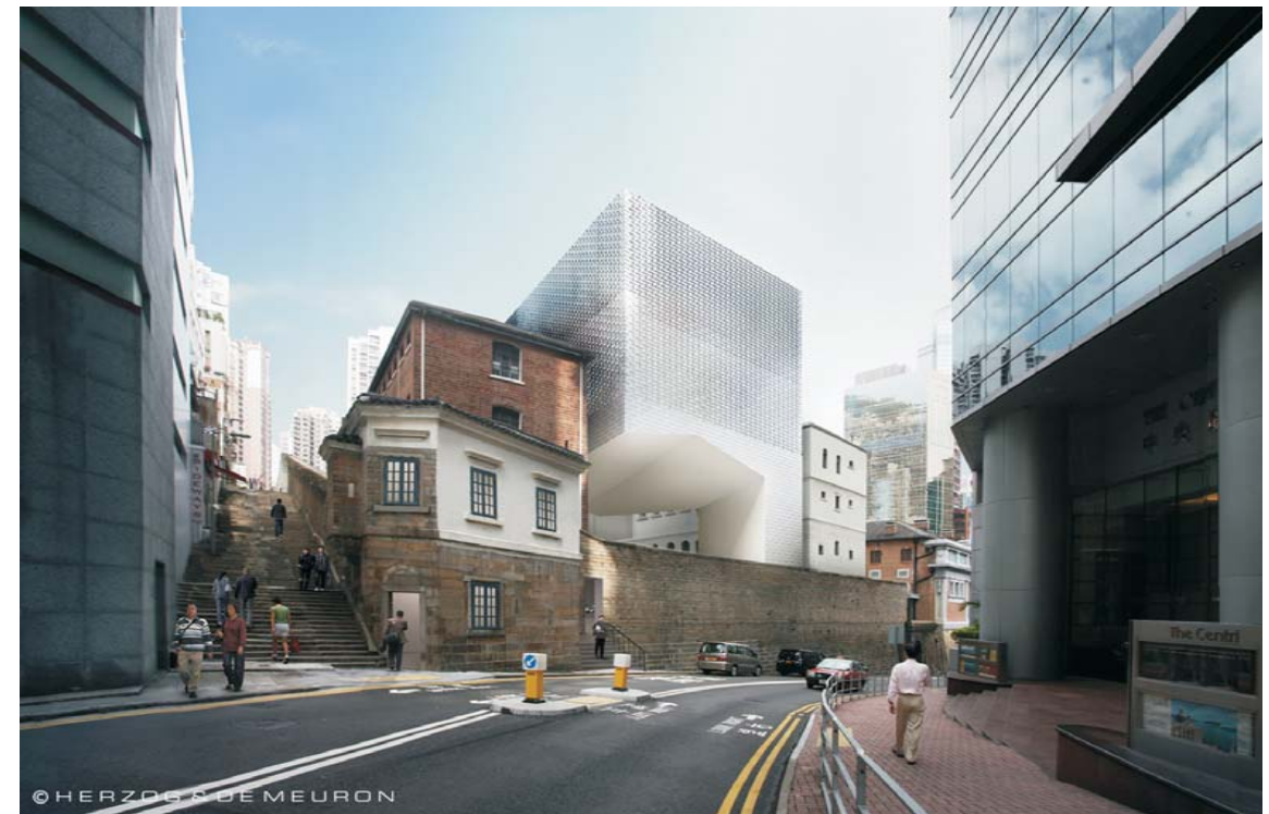
View towards Project Site with Mitigation Measures at Year 10 of Operation*