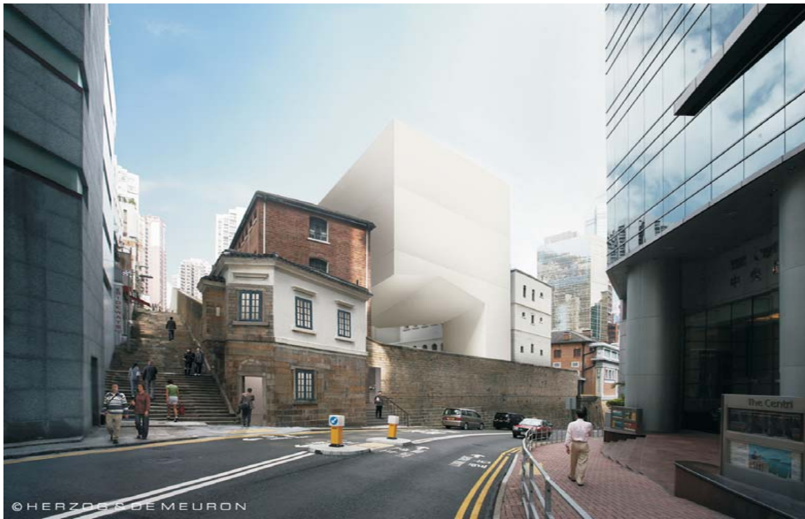
View towards Project Site without Mitigation Measures on Day 1 of Operation