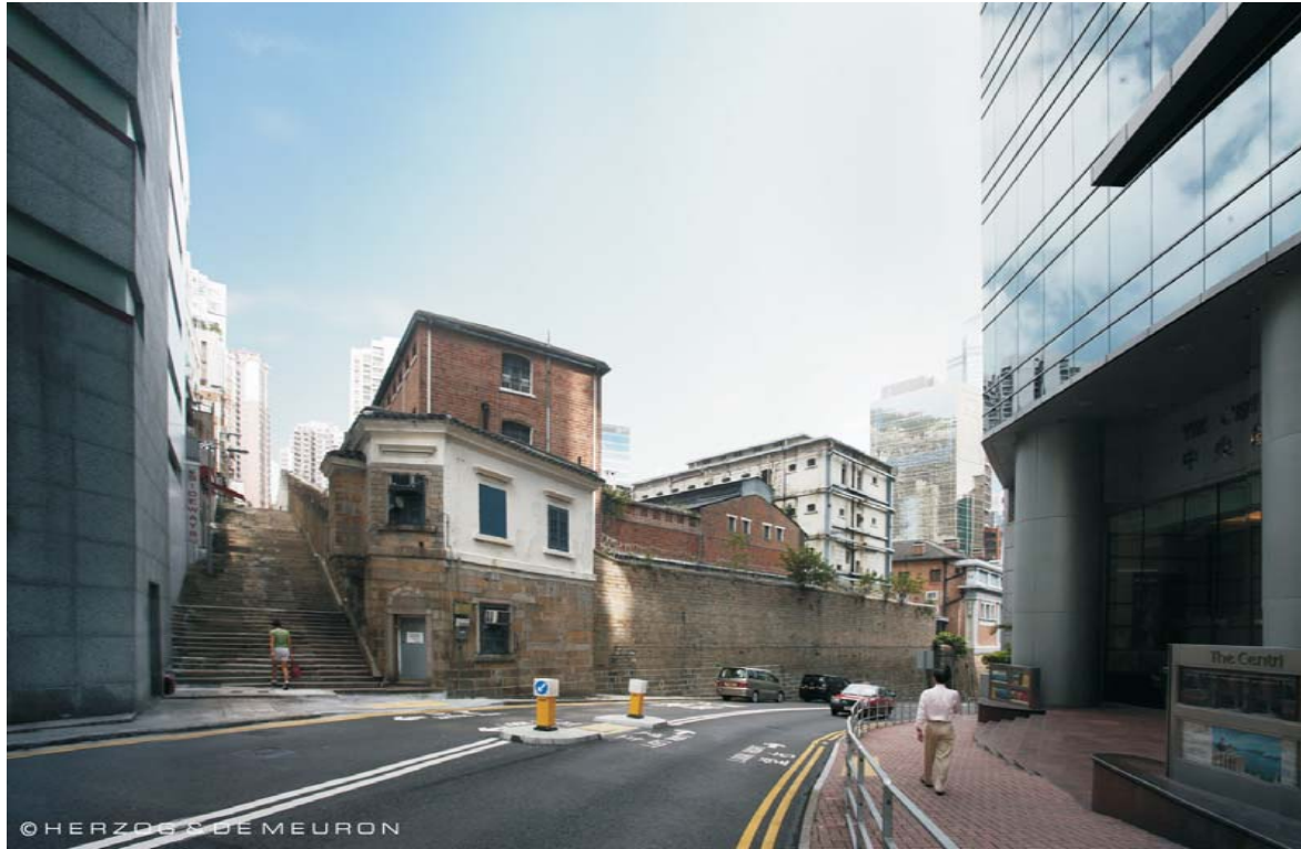
Existing view towards Project Site