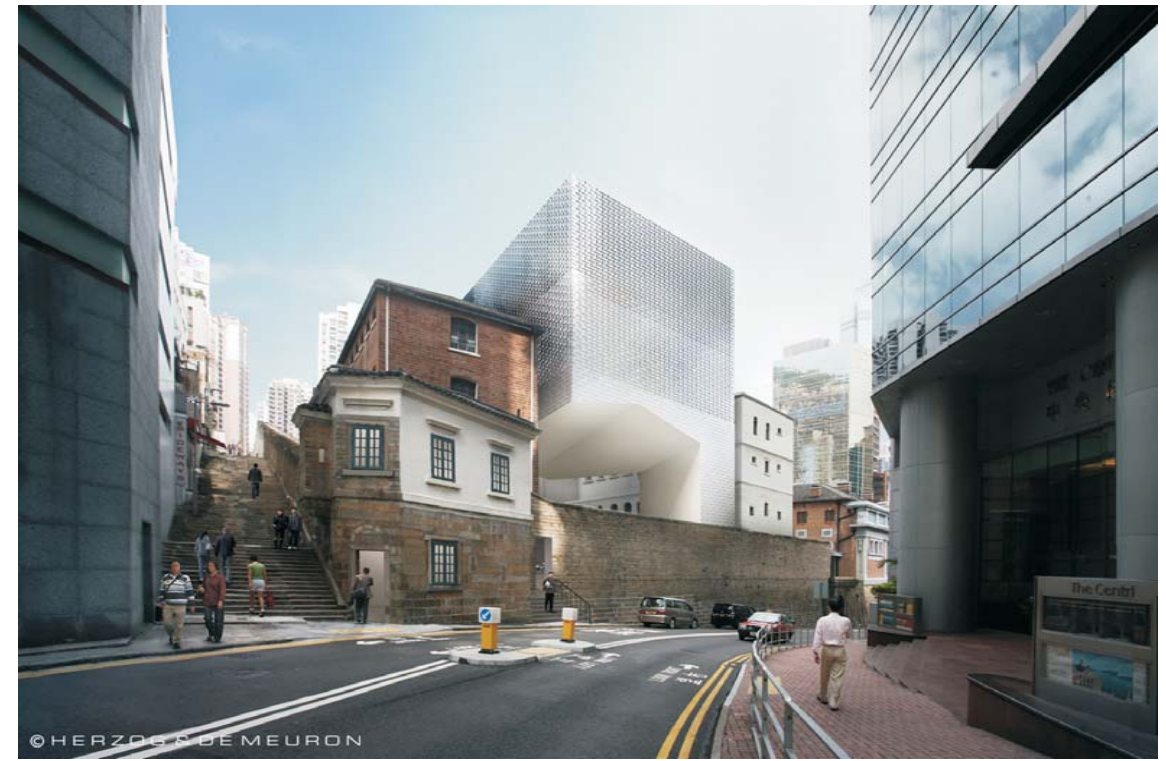
View towards Project Site with Mitigation Measures on Day 1 of Operation*