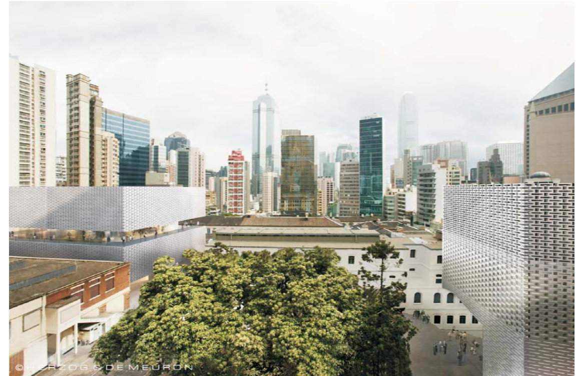
View towards Project Site with Mitigation Measures on Day 1 of Operation*