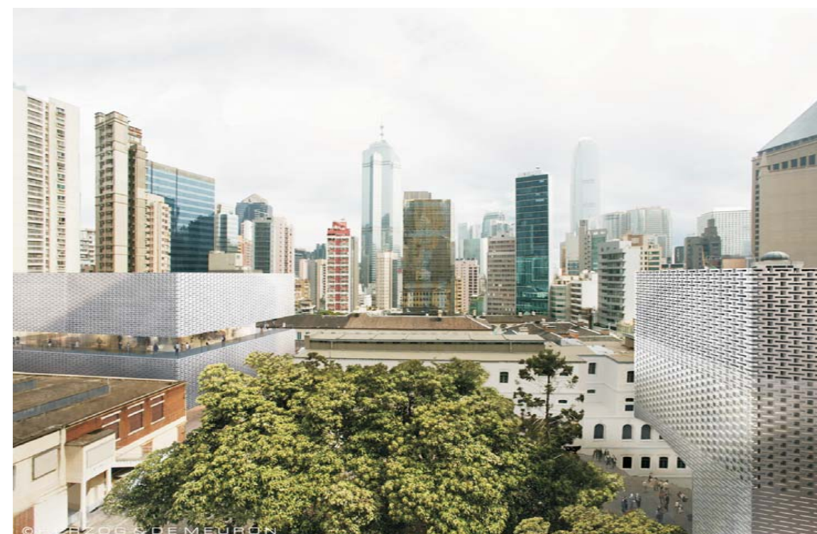
View towards Project Site with Mitigation Measures at Year 10 of Operation*