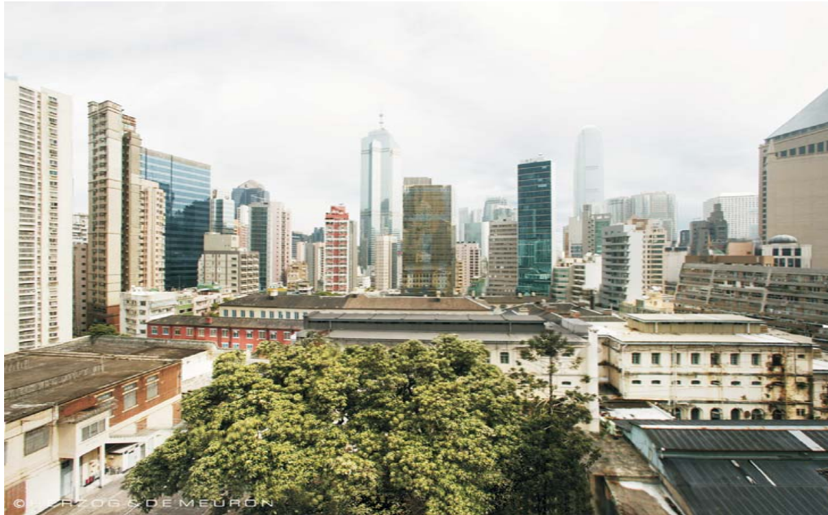
Existing view towards Project Site