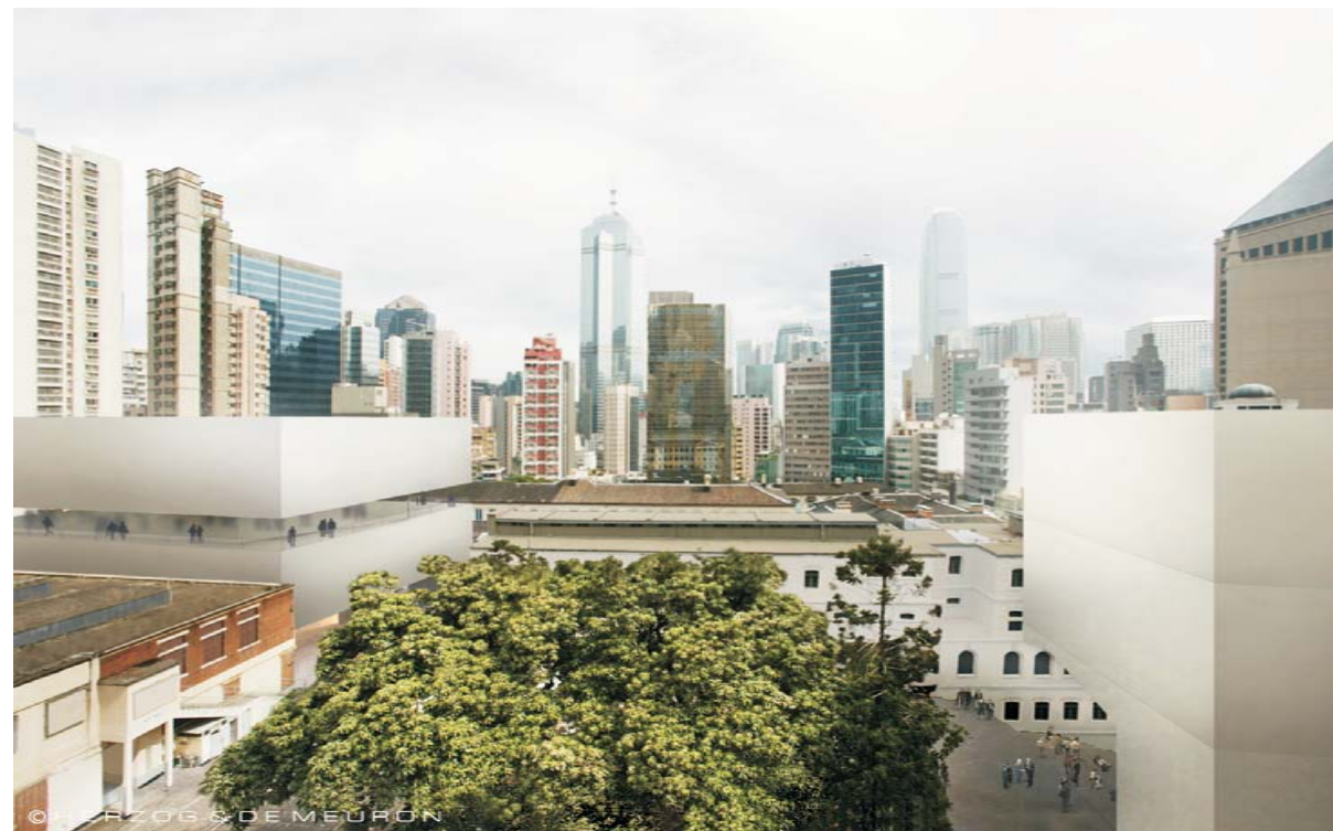
View towards Project Site without Mitigation Measures on Day 1 of Operation