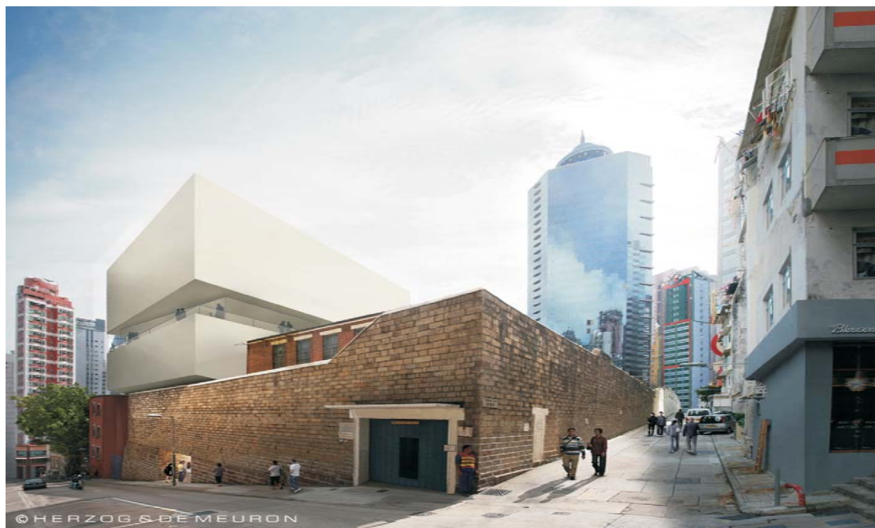
View towards Project Site without Mitigation Measures on Day 1 of Operation