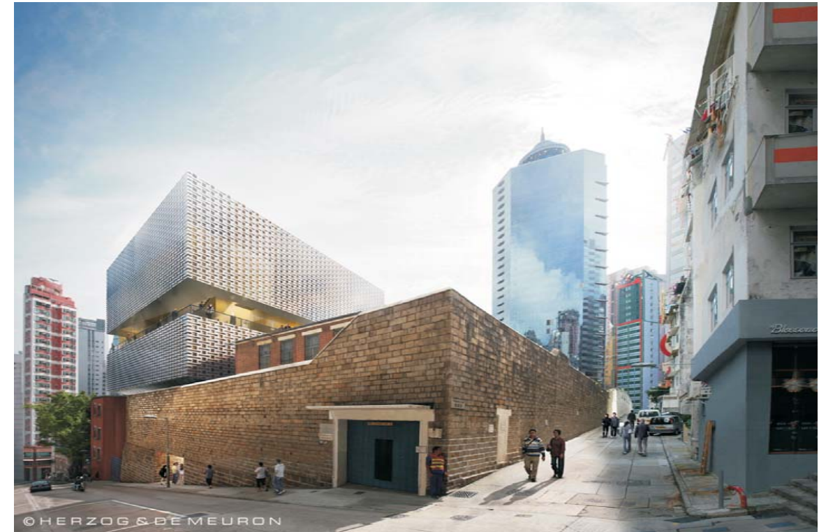
View towards Project Site with Mitigation Measures on Day 1 of Operation*