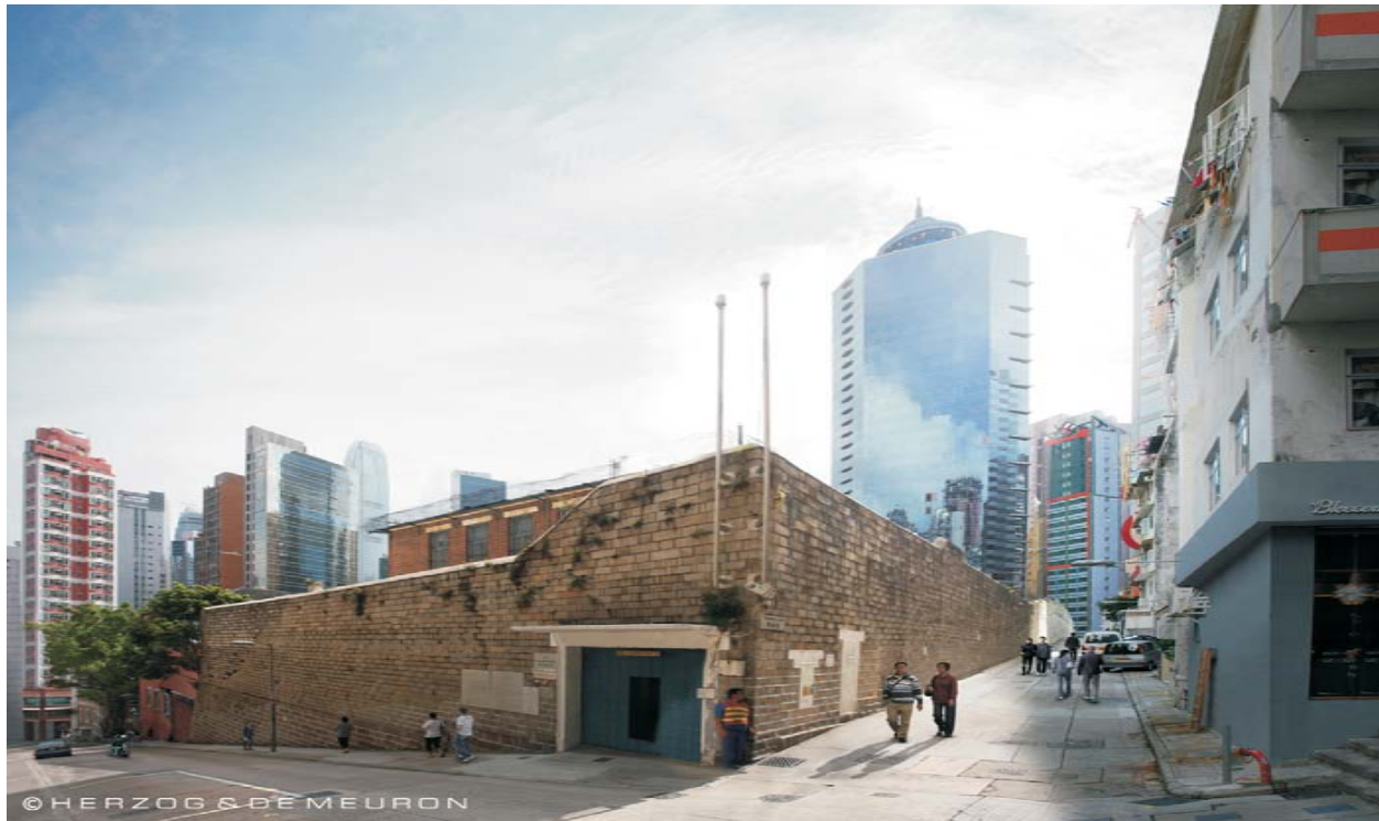
Existing view towards Project Site