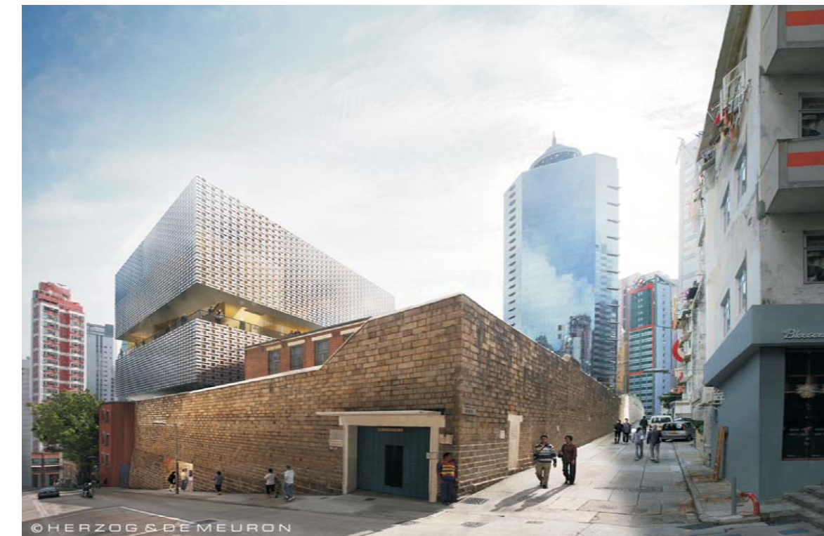
View towards Project Site with Mitigation Measures at Year 10 of Operation*