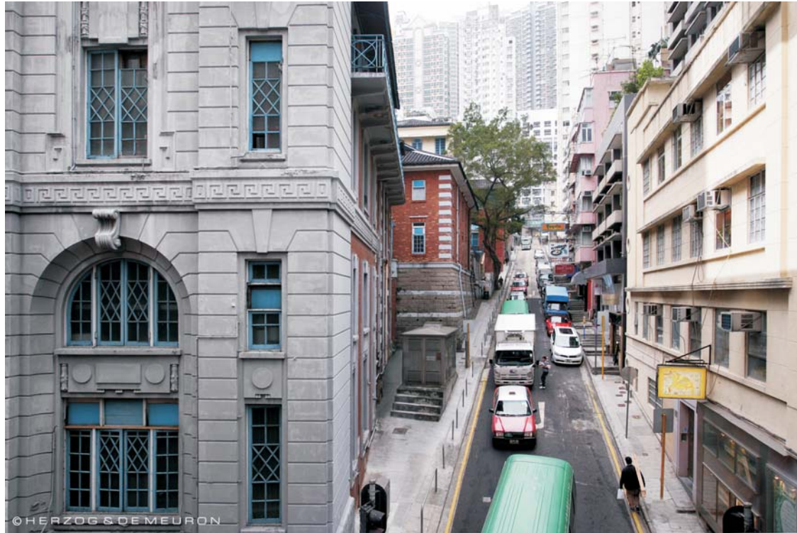
Exiting View towards Project Site from VPa