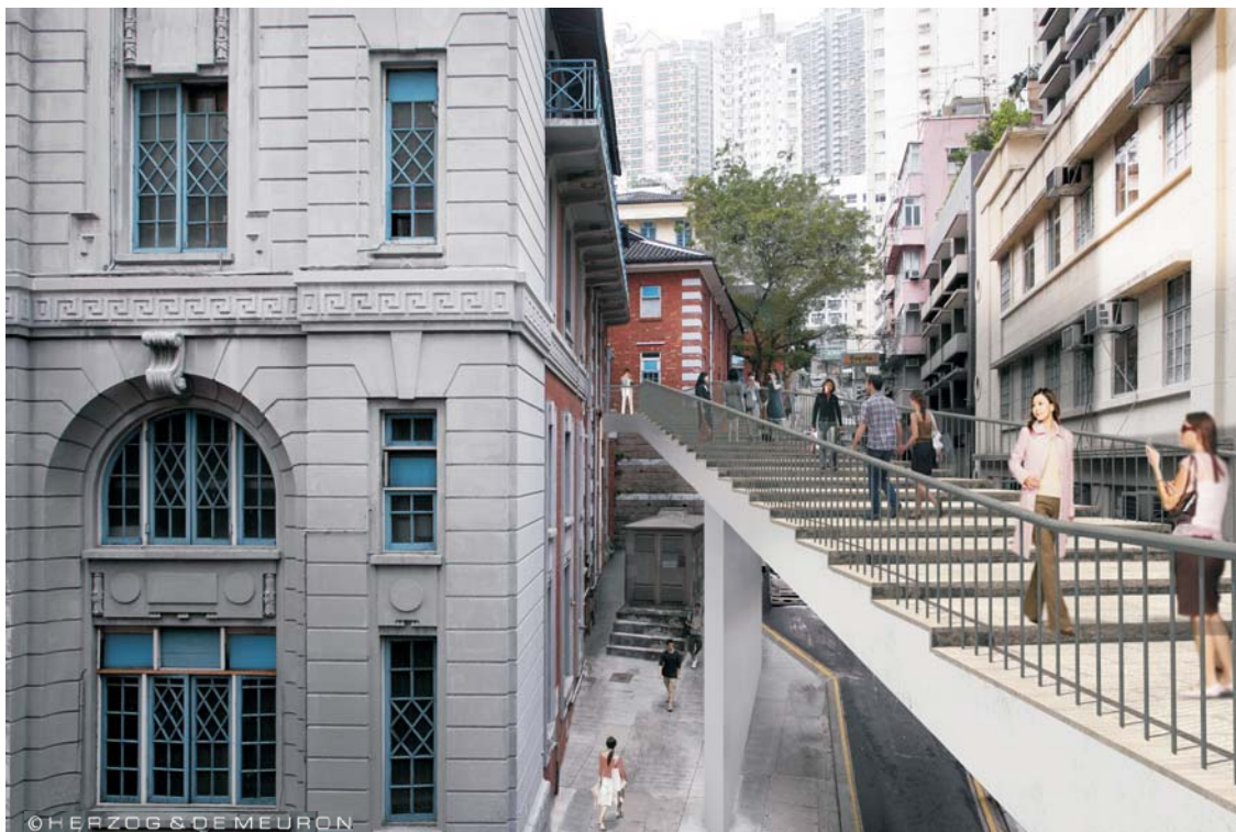
Project Site at Operation* from VPa