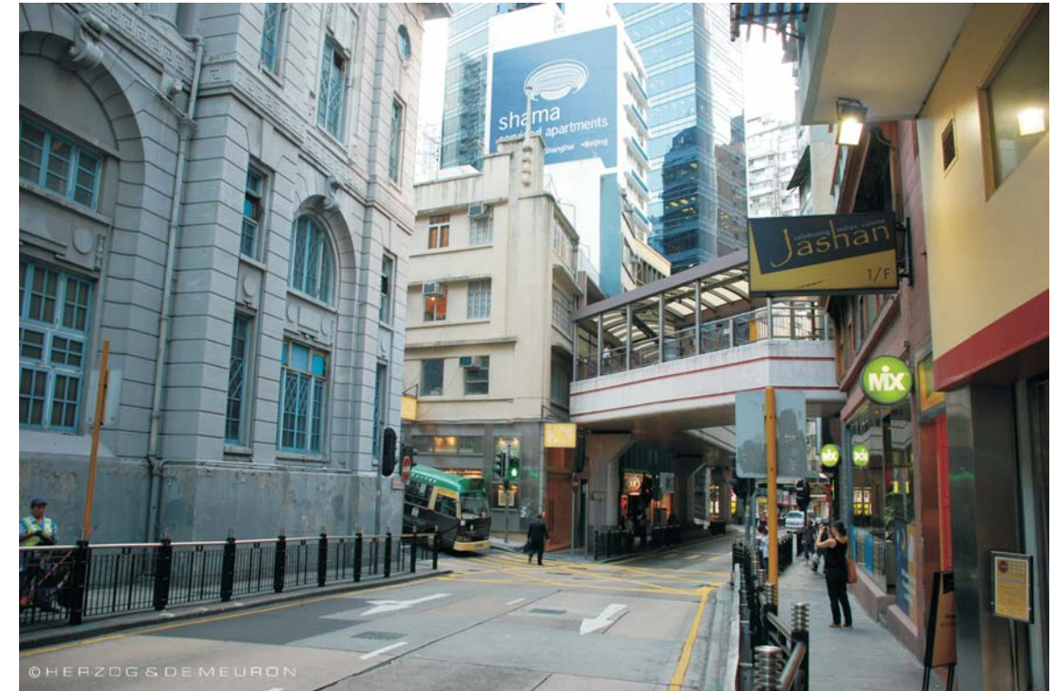
Exiting View towards Project Site from VPf