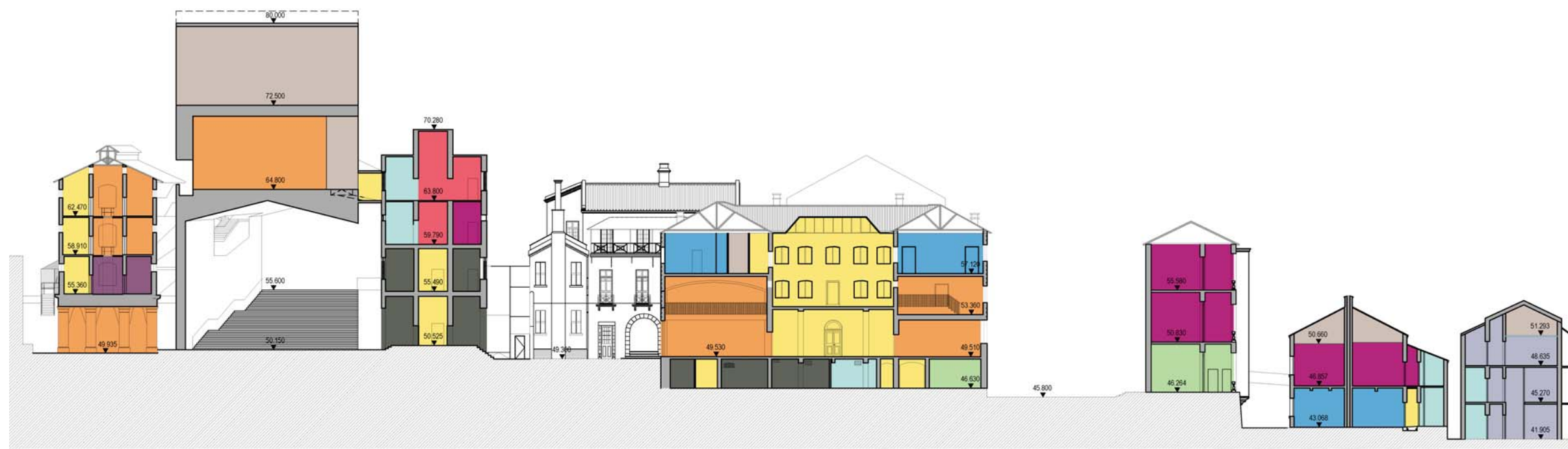
Site Section F - F