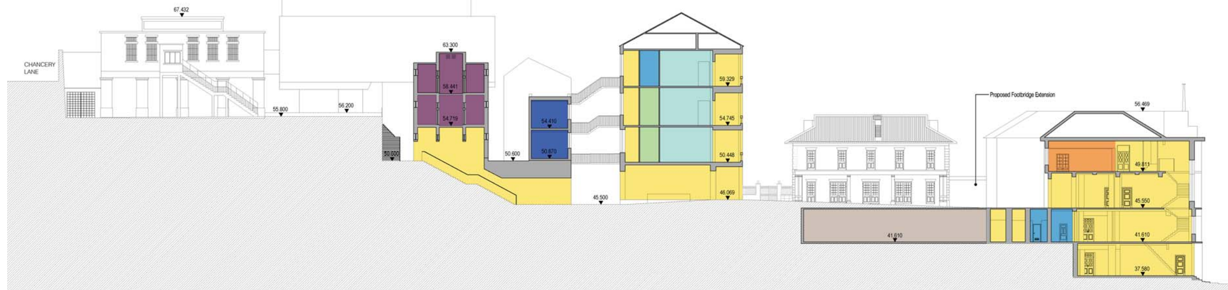
Site Section E - E