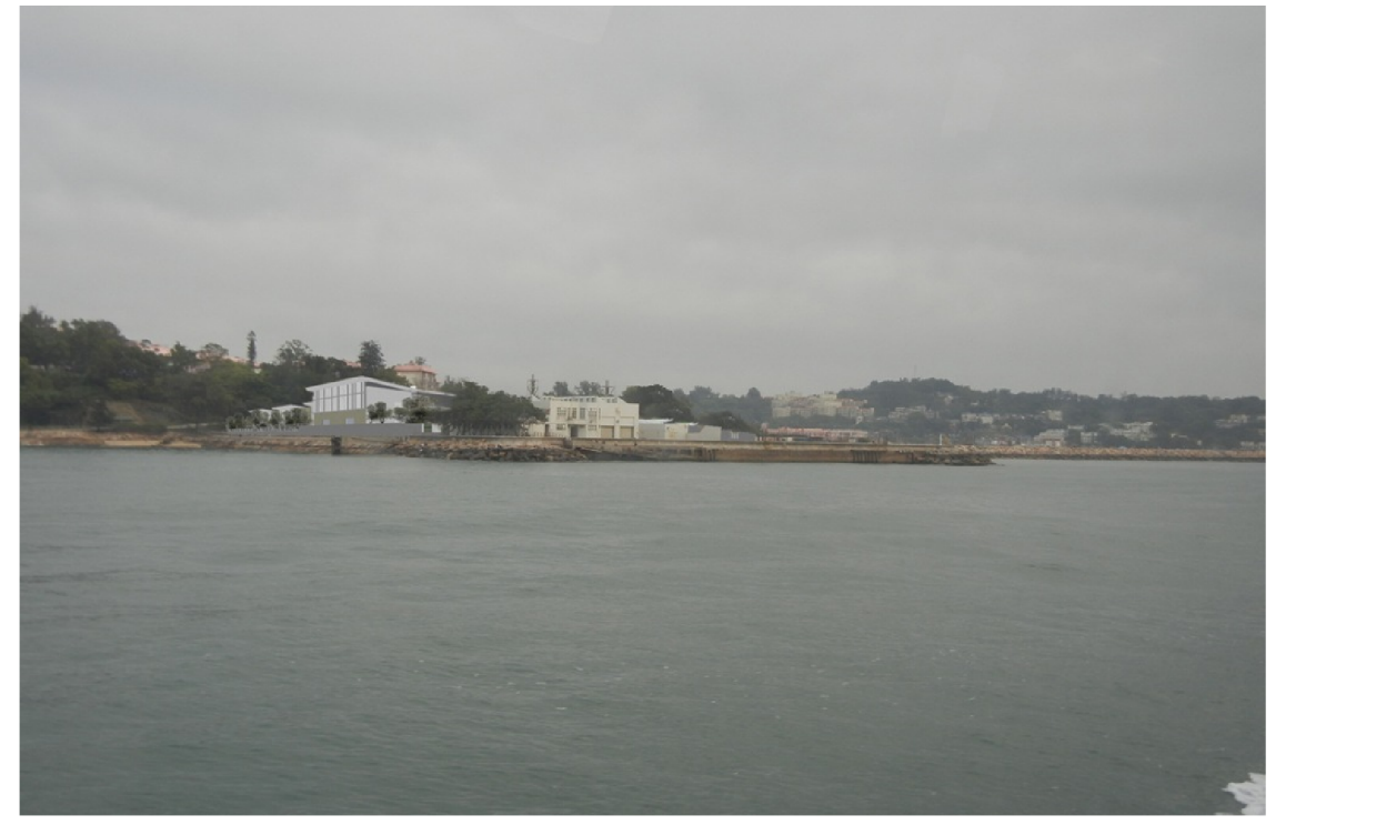
View of the Proposed Cheung Chau STW Upgrading - with visual mitigation measures - Year 10