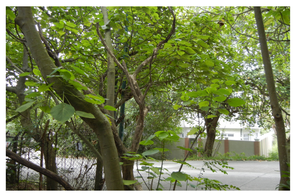
Existing and Future View of the Cheung Chau \ensuremath{\mathsf{STW}}