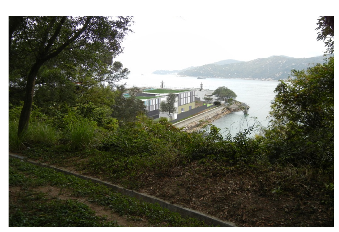
View of the Proposed Cheung Chau STW Upgrading - without visual mitigation measures