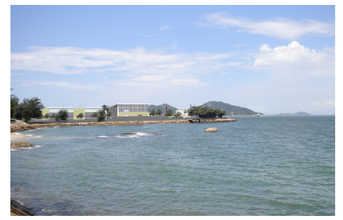
View of the Proposed Cheung Chau STW Upgrading - with visual mitigation measures - Day 1