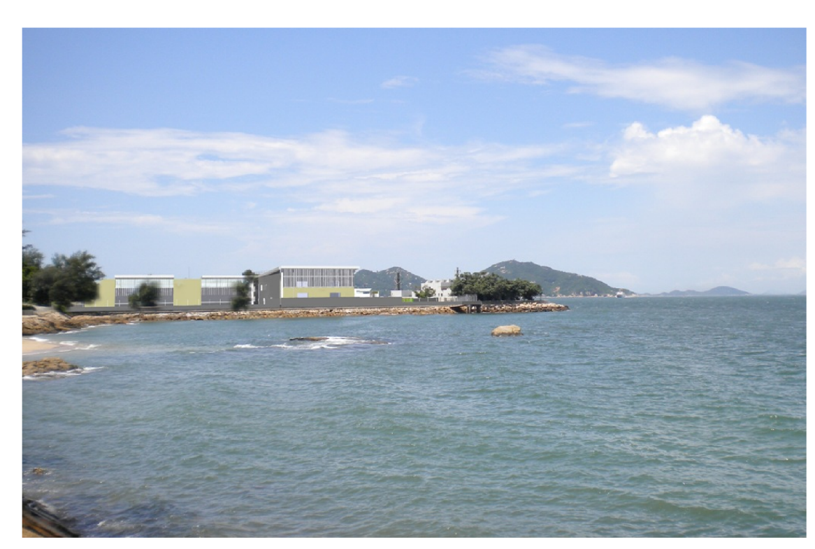
View of the Proposed Cheung Chau STW Upgrading - without visual mitigation measures