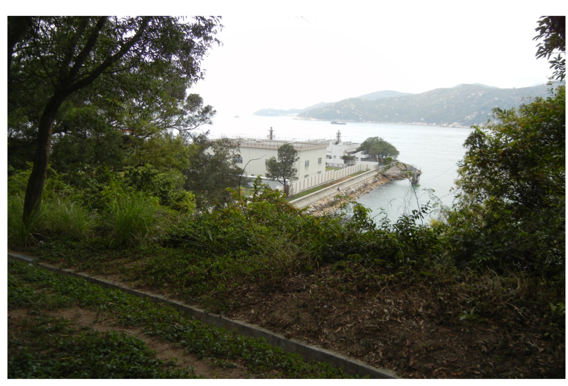
Existing View of the Cheung Chau STW