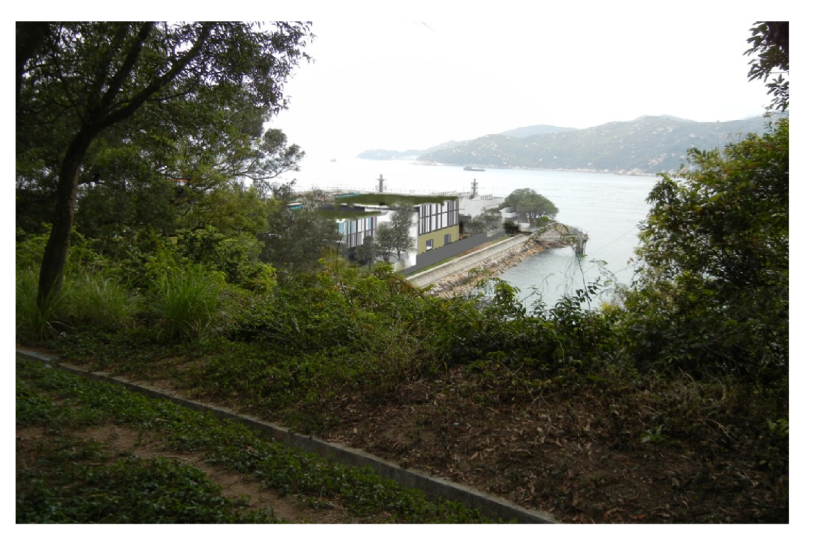
View of the Proposed Cheung Chau STW Upgrading - with visual mitigation measures - Year 10