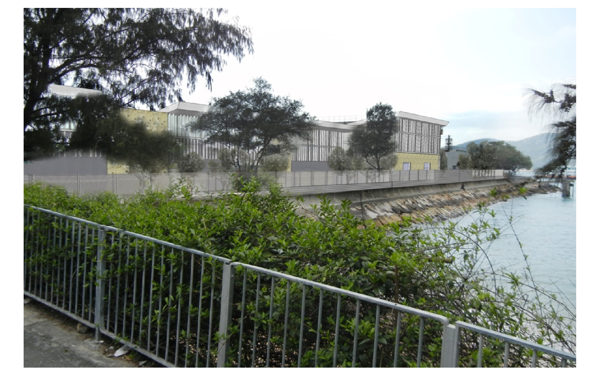
View of the Proposed Cheung Chau STW Upgrading - with visual mitigation measures - Day 1