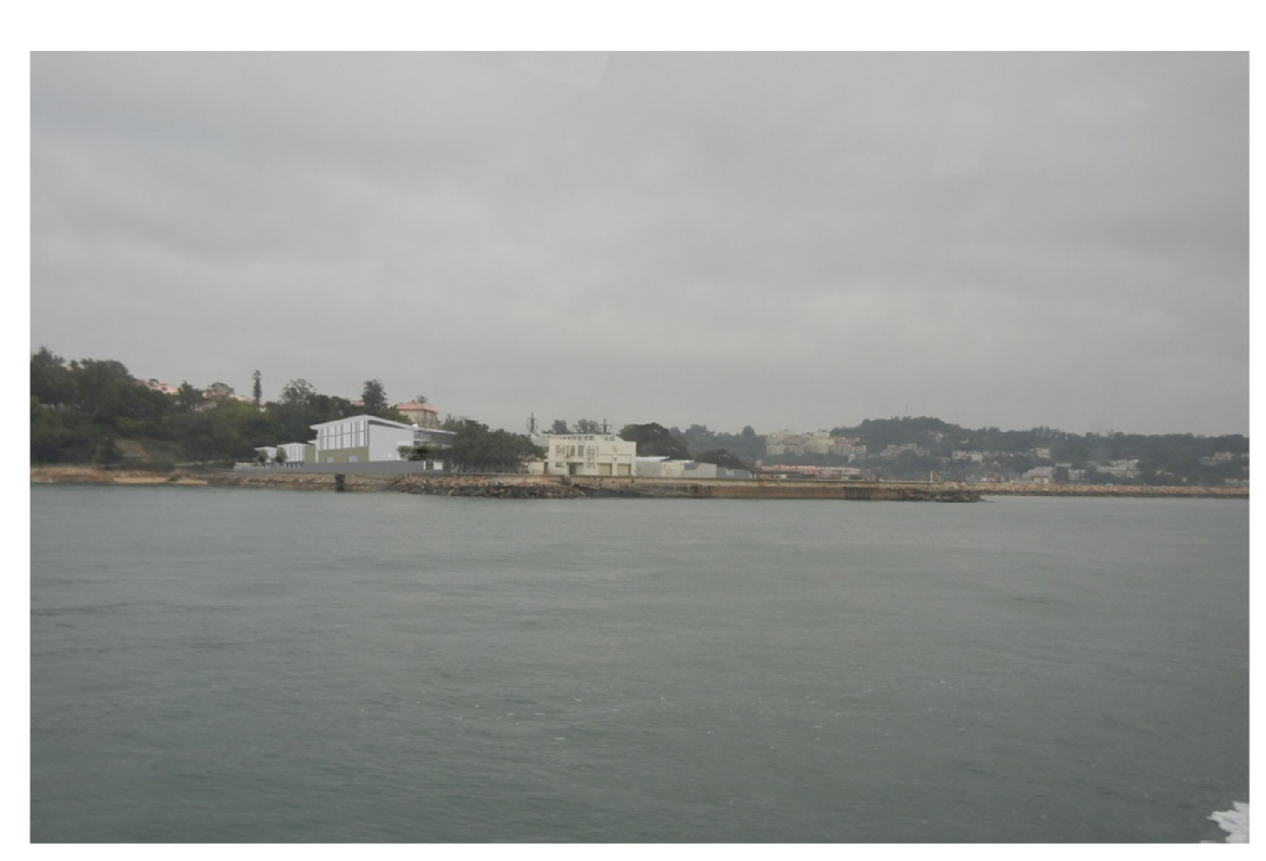
View of the Proposed Cheung Chau STW Upgrading - without visual mitigation measures