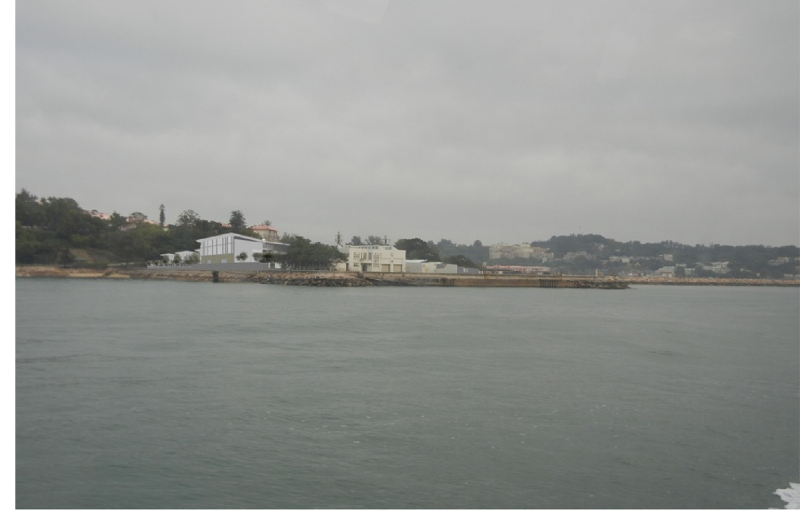
View of the Proposed Cheung Chau STW Upgrading - with visual mitigation measures - Day 1