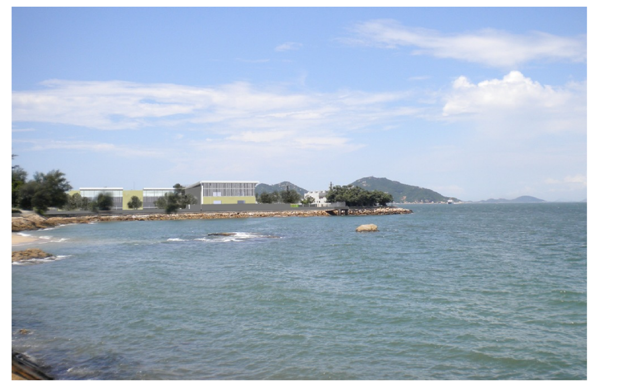
View of the Proposed Cheung Chau STW Upgrading - with visual mitigation measures - Year 10