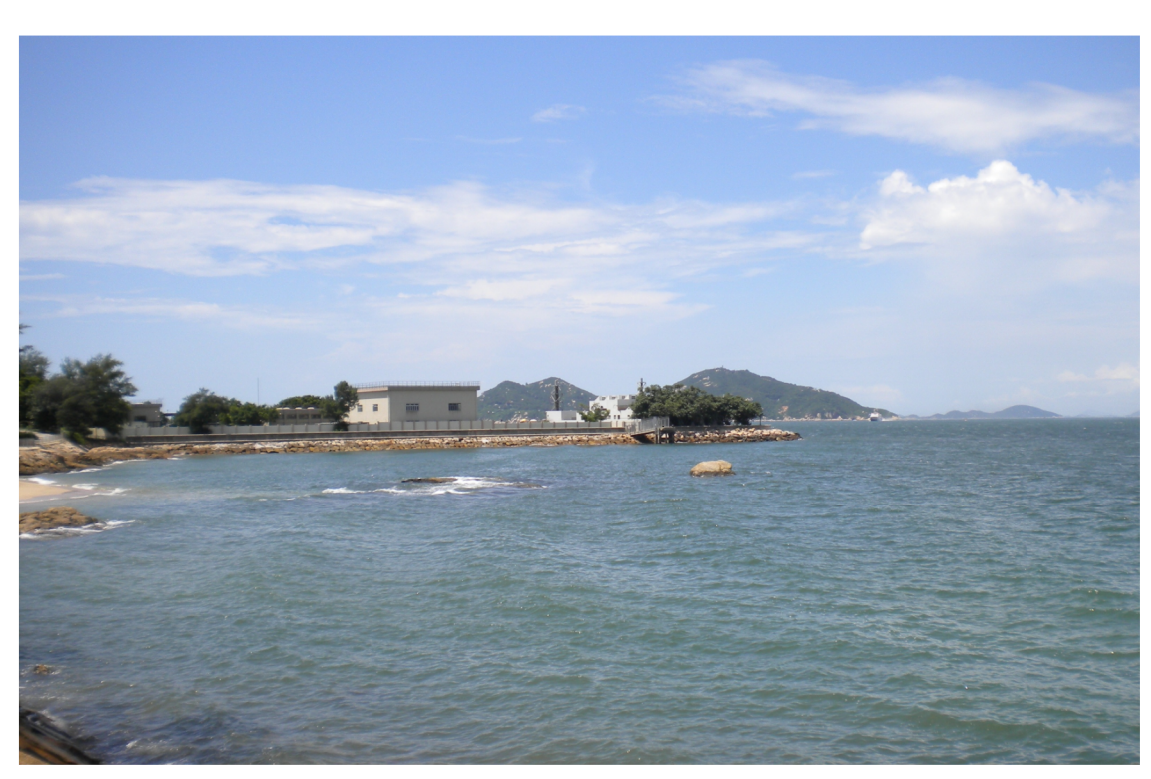
Existing View of the Cheung Chau STW