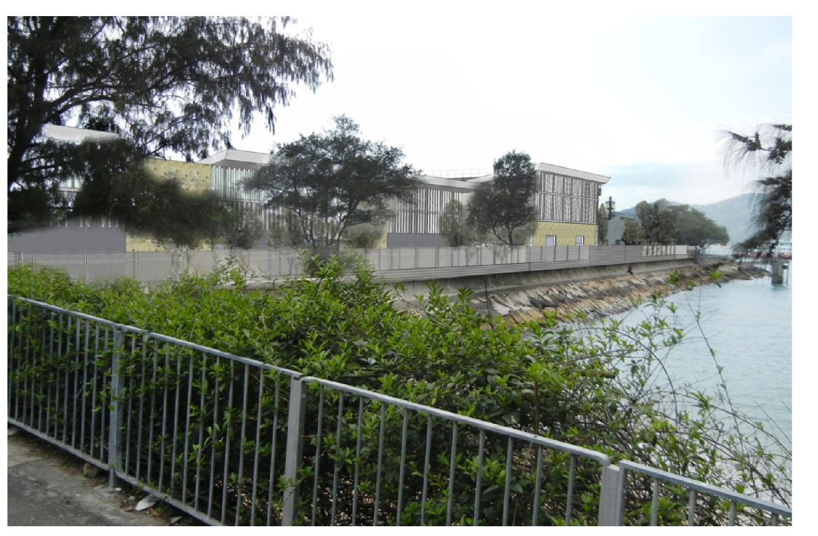
View of the Proposed Cheung Chau STW Upgrading - with visual mitigation measures - Year 10