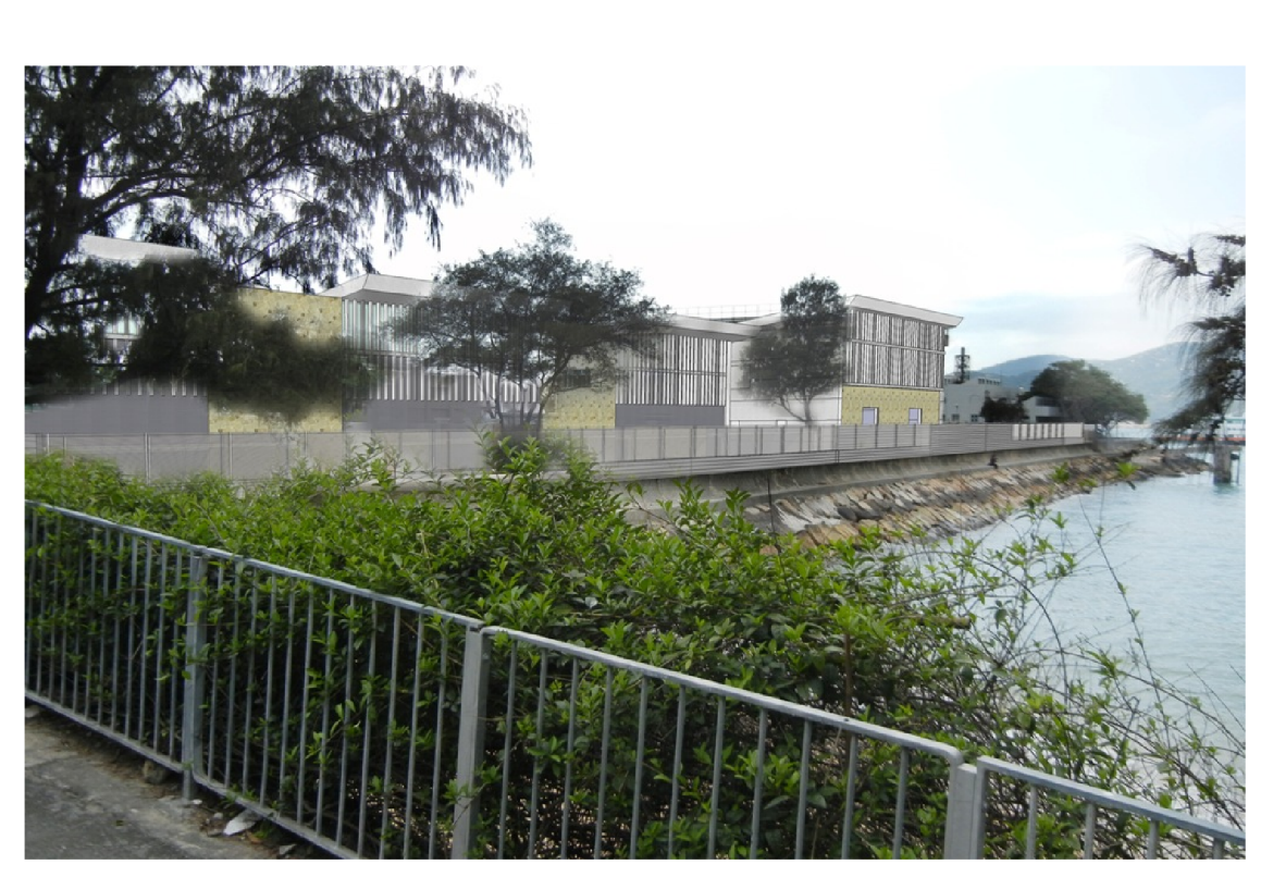
View of the Proposed Cheung Chau STW Upgrading - without visual mitigation measures