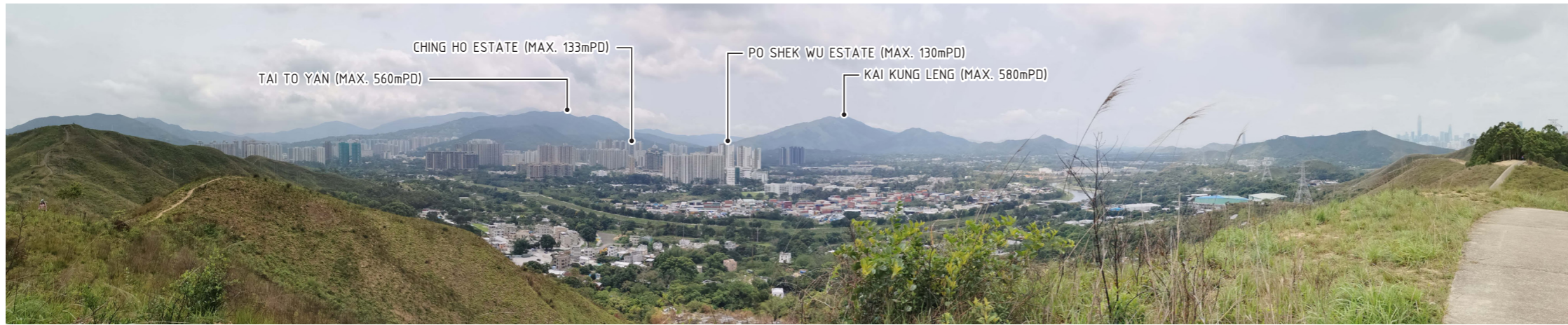
VP1 - WA SHAN HIKING TRAIL - EXISTING SITE CONDITION

SITE OF NEW HOSPITAL BLOCK OF NORTH DISTRICT HOSPITAL (APPROX. +108mPD)