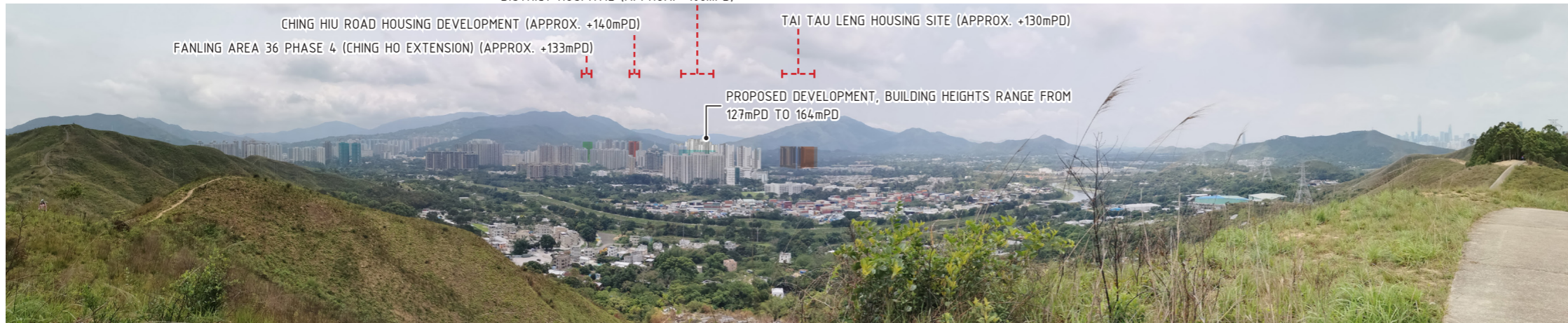
PHOTOMONTAGE WITHOUT MITIGATION MEASURES

SITE OF NEW HOSPITAL BLOCK OF NORTH DISTRICT HOSPITAL (APPROX. +108mPD)