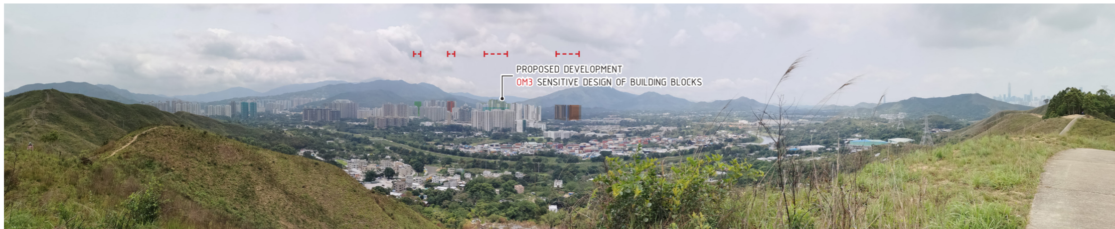
PHOTOMONTAGE WITH MITIGATION MEASURES AT DAY 1