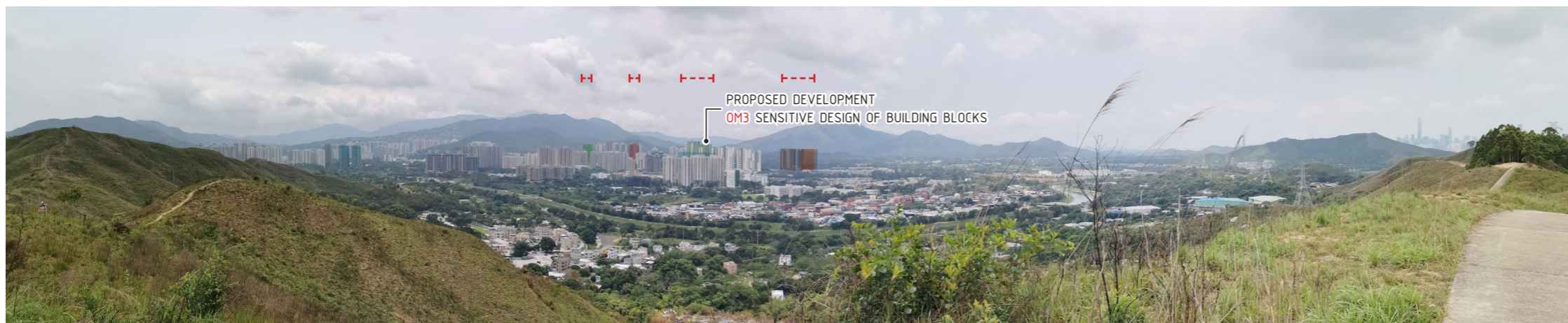
PHOTOMONTAGE WITH MITIGATION MEASURES AT YEAR 10