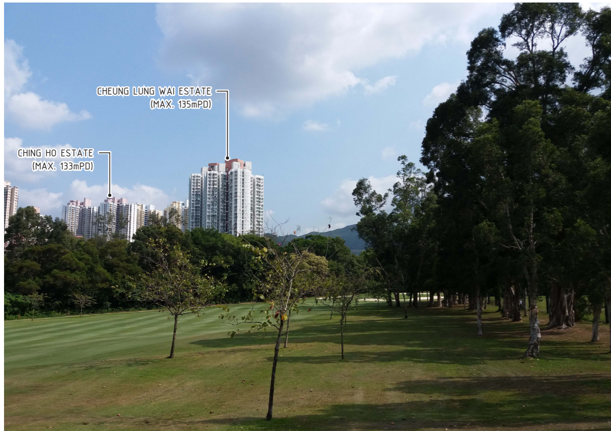
VP10 – FANLING GOLF COURSE – EXISTING SITE CONDITION