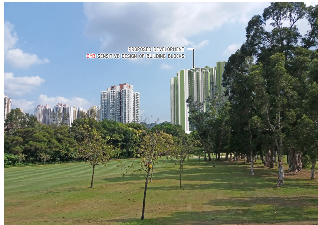
PHOTOMONTAGE WITH MITIGATION MEASURES AT YEAR 10