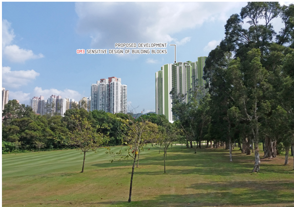
PHOTOMONTAGE WITH MITIGATION MEASURES AT DAY 1