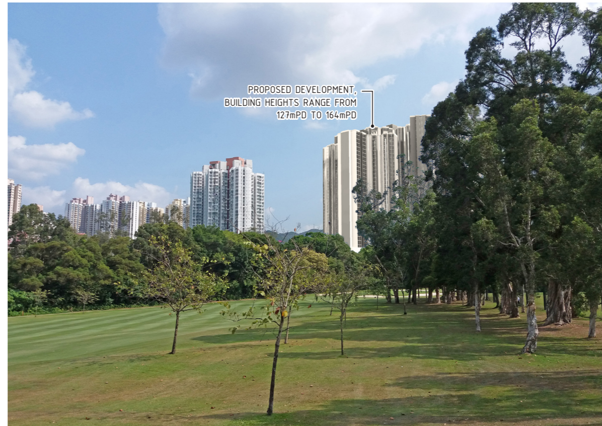
PHOTOMONTAGE WITHOUT MITIGATION MEASURES