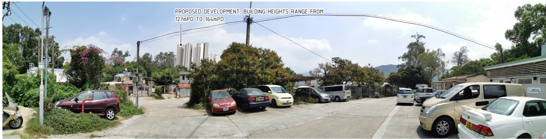
PHOTOMONTAGE WITHOUT MITIGATION MEASURES