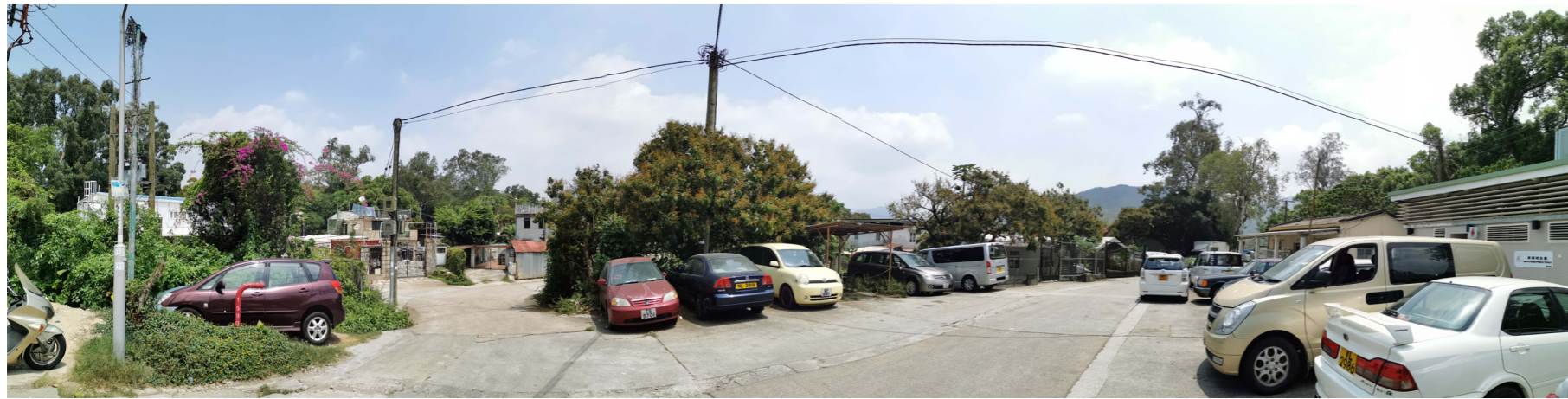
VP11 - ON PO TSUEN - EXISTING SITE CONDITION