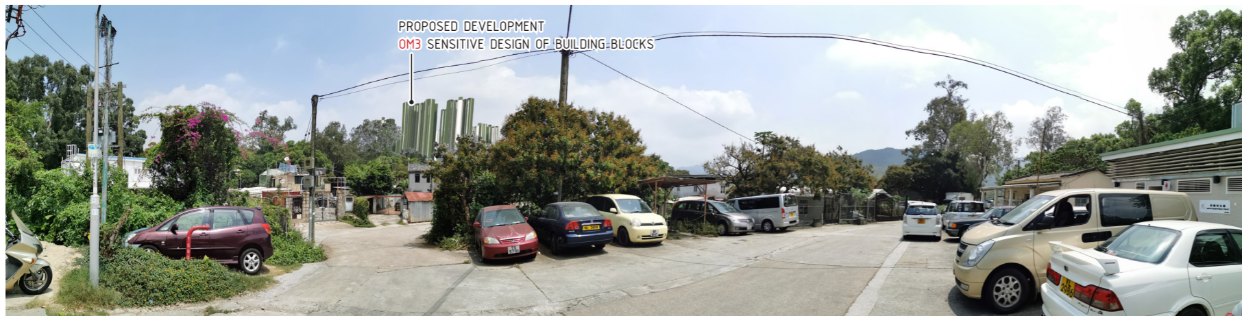
PHOTOMONTAGE WITH MITIGATION MEASURES AT YEAR 10