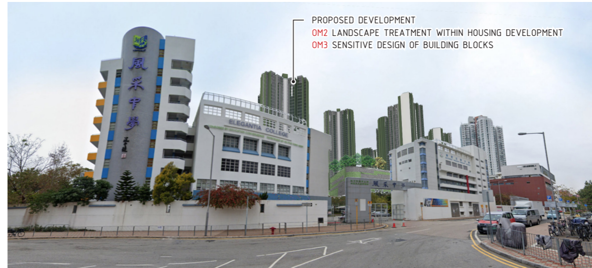
PHOTOMONTAGE WITH MITIGATION MEASURES AT YEAR 10