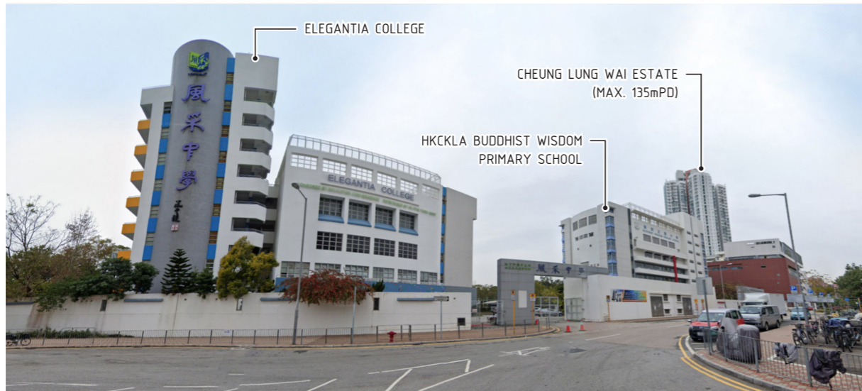
VP12 - ELEGANTIA COLLEGE - EXISTING SITE CONDITION