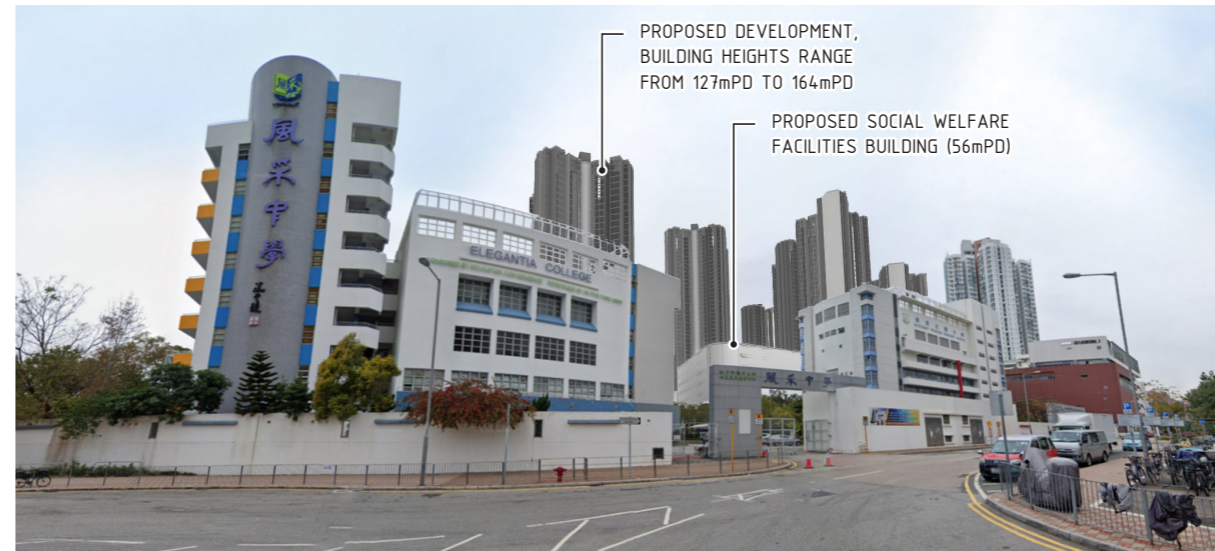
PHOTOMONTAGE WITHOUT MITIGATION MEASURES