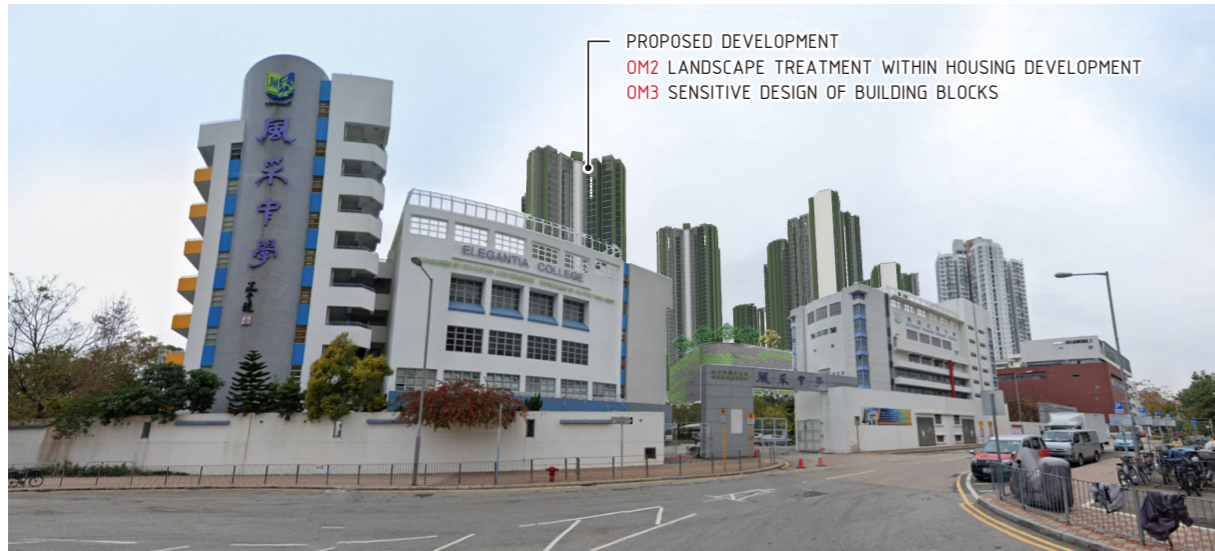
PHOTOMONTAGE WITH MITIGATION MEASURES AT DAY 1