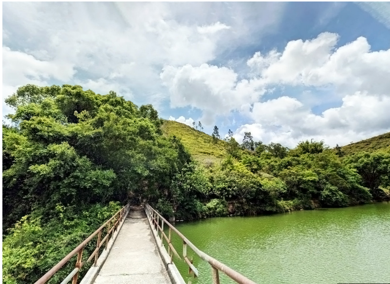
VP14 - KWU TUNG RESERVOIR - EXISTING SITE CONDITION