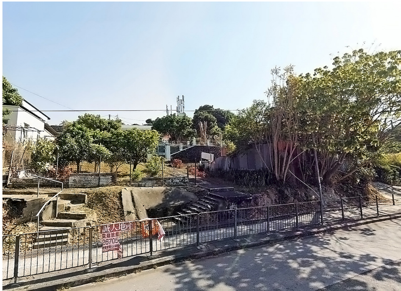
VP16 - WAH SHAN TSUEN - EXISTING SITE CONDITION