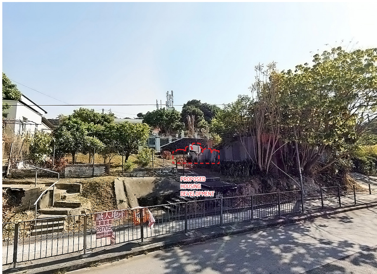
PHOTOMONTAGE WITHOUT MITIGATION AND WITH MITIGATION IN DAY 1 AND YEAR 10

(HOUSING DEVELOPMENT WILL BE BLOCKED BY EXISTING BUILDINGS AT THIS VP)