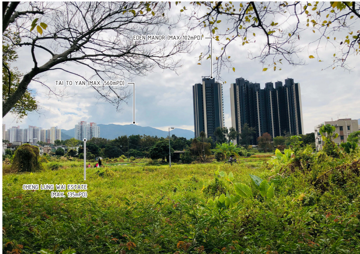
VP2 - TAI TAU LENG LANE 12 - EXISTING SITE CONDITION