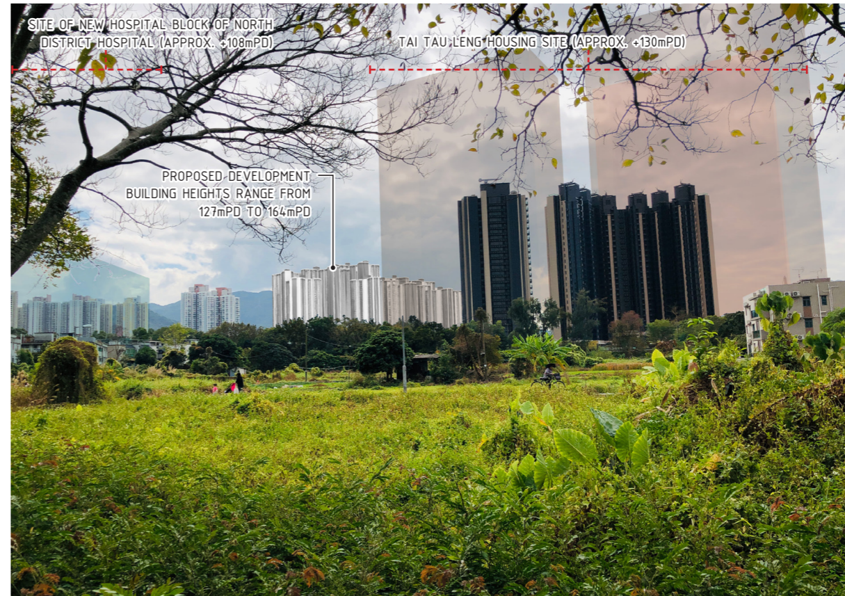
PHOTOMONTAGE WITHOUT MITIGATION MEASURES