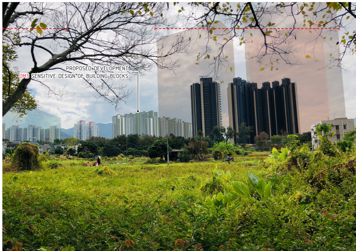
PHOTOMONTAGE WITH MITIGATION MEASURES AT DAY 1