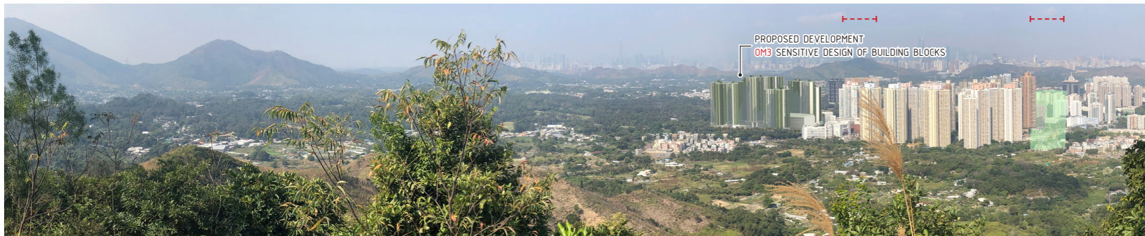
PHOTOMONTAGE WITH MITIGATION MEASURES AT DAY 1