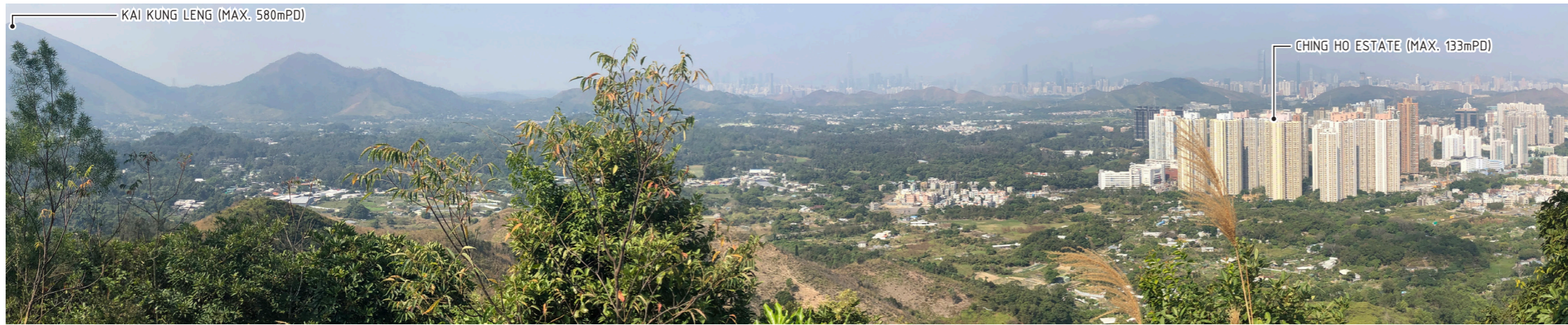
VP3 - WU TIP SHAN - EXISTING SITE CONDITION