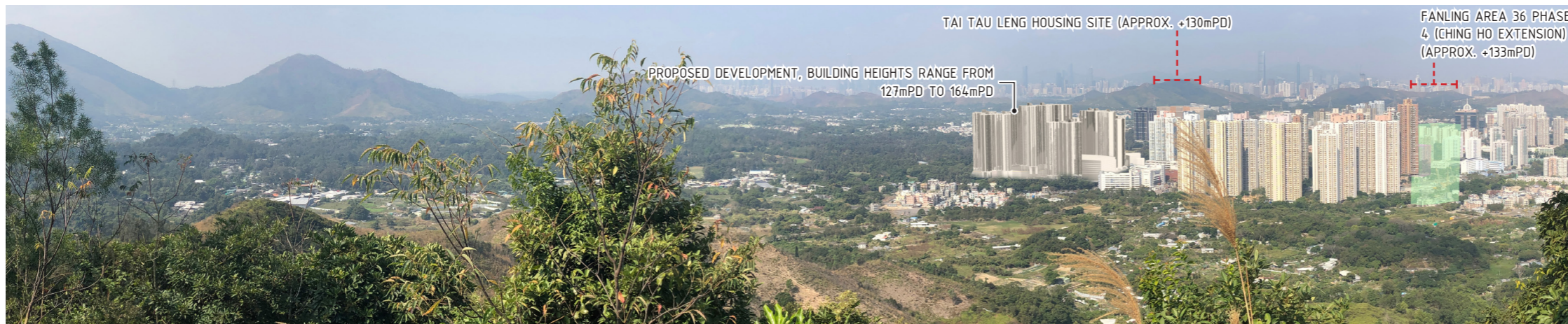
PHOTOMONTAGE WITHOUT MITIGATION MEASURES