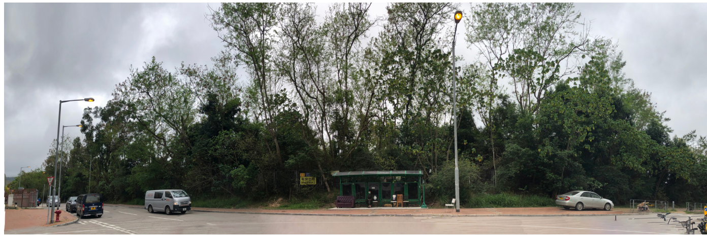
VP4 - PING KONG ROAD - EXISTING SITE CONDITION