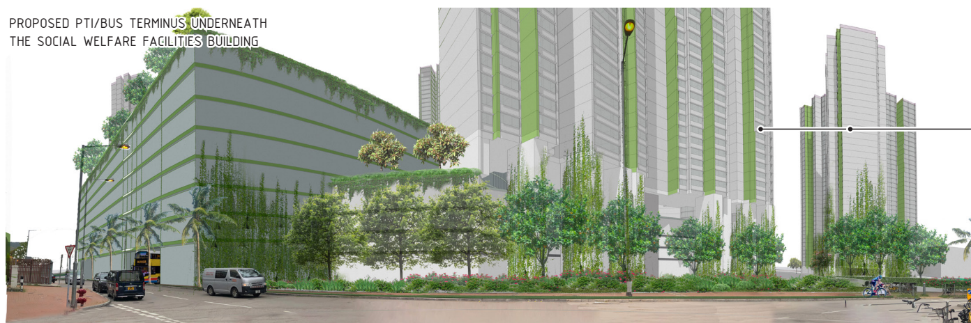
PHOTOMONTAGE WITH MITIGATION MEASURES AT YEAR 10