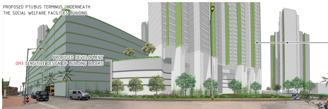
PHOTOMONTAGE WITH MITIGATION MEASURES AT DAY 1