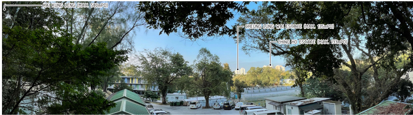
VP5 - TAI LUNG EXPERIMENTAL FARM - EXISTING SITE CONDITION