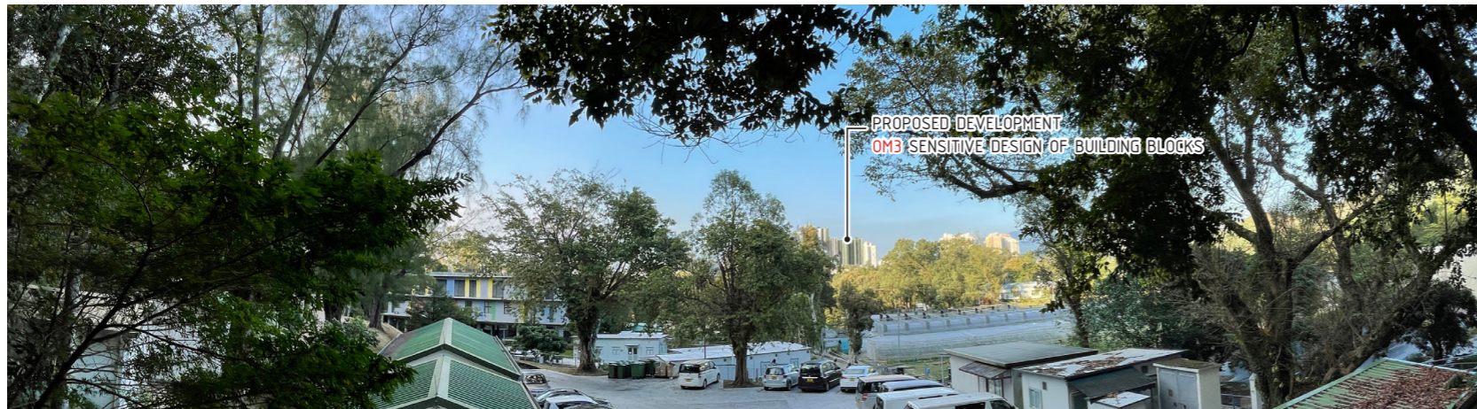
PHOTOMONTAGE WITH MITIGATION MEASURES AT DAY 1