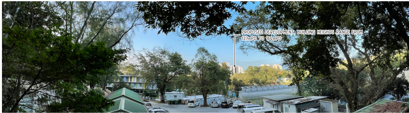
PHOTOMONTAGE WITHOUT MITIGATION MEASURES