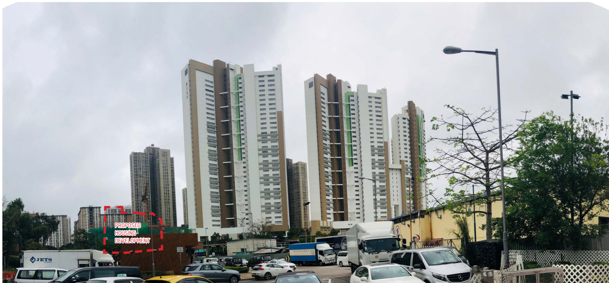
PHOTOMONTAGE WITHOUT MITIGATION AND WITH MITIGATION IN DAY 1 AND YEAR 10

(HOUSING DEVELOPMENT WILL BE BLOCKED BY EXISTING BUILDINGS AT THIS VP)