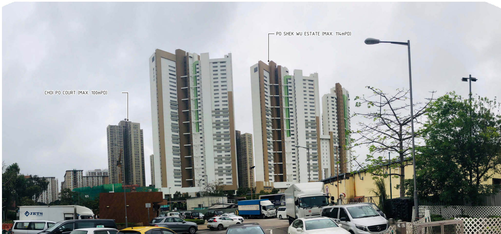
VP6 - SHEK WU HUI JOCKEY CLUB PLAYGROUND - EXISTING SITE CONDITION