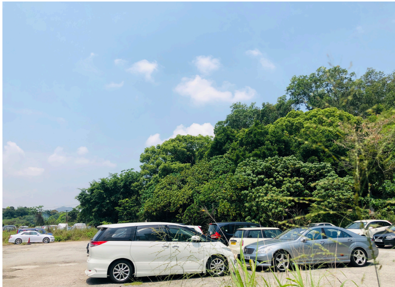
VP7 - PAK WO ROAD BASKETBALL COURT - EXISTING SITE CONDITION