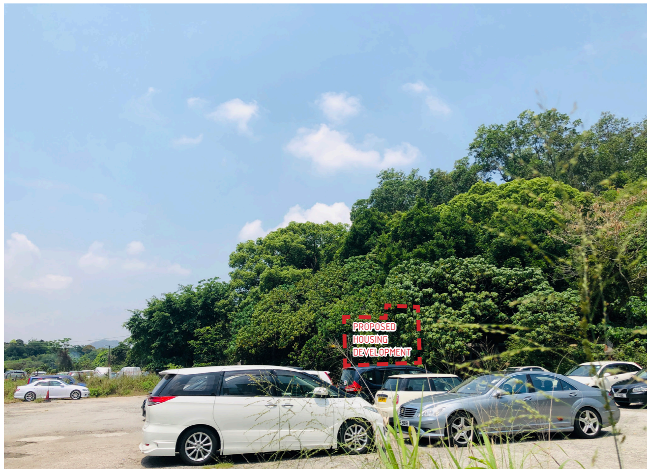
PHOTOMONTAGE WITHOUT MITIGATION AND WITH MITIGATION IN DAY 1 AND YEAR 10

(HOUSING DEVELOPMENT WILL BE BLOCKED BY EXISTING TREES AND VEGETATION AT THIS VP)