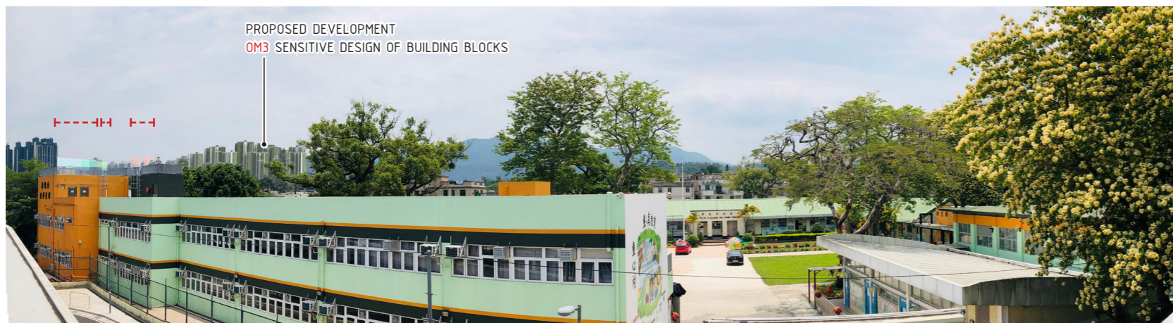
PHOTOMONTAGE WITH MITIGATION MEASURES AT YEAR 10