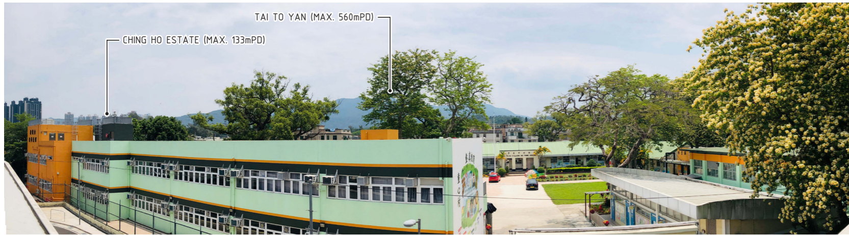
VP8 - KAM TSIN VILLAGE HO TUNG SCHOOL - EXISTING SITE CONDITION