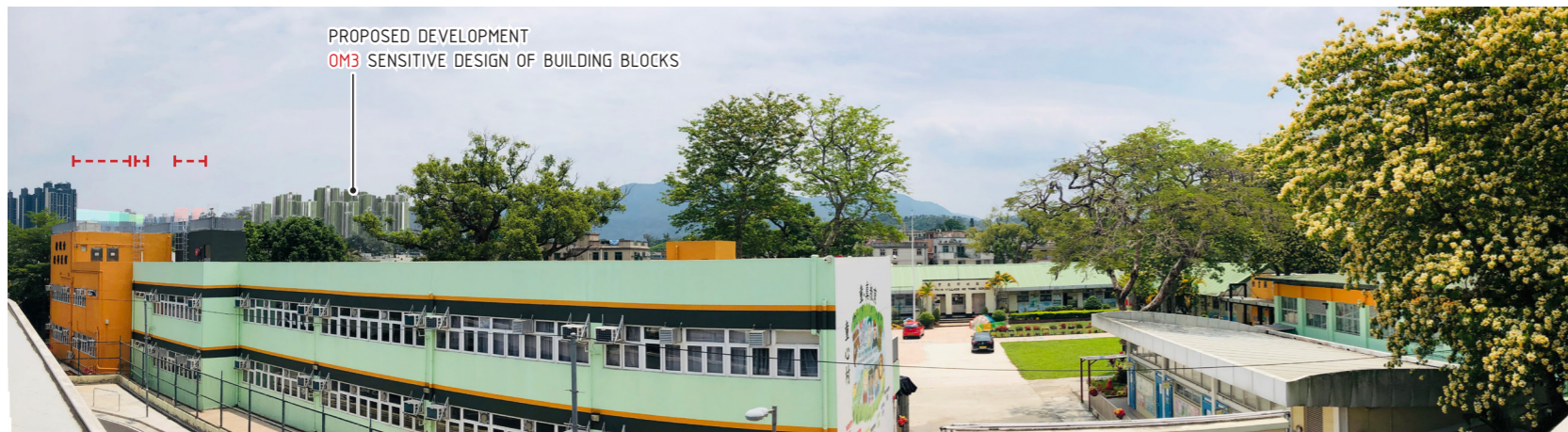
PHOTOMONTAGE WITH MITIGATION MEASURES AT DAY 1