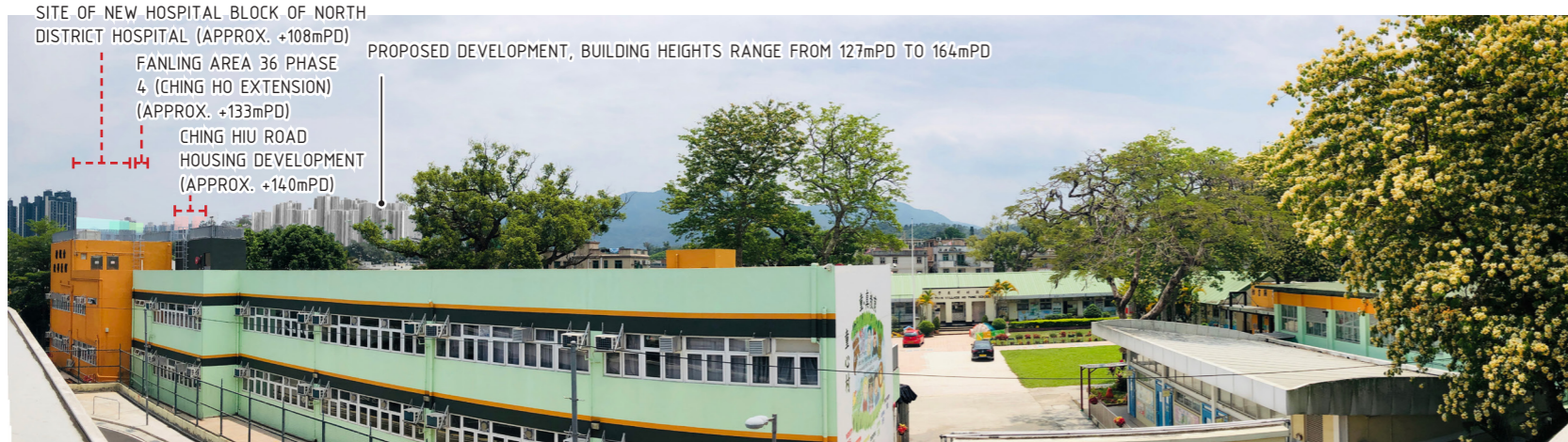
PHOTOMONTAGE WITHOUT MITIGATION MEASURES