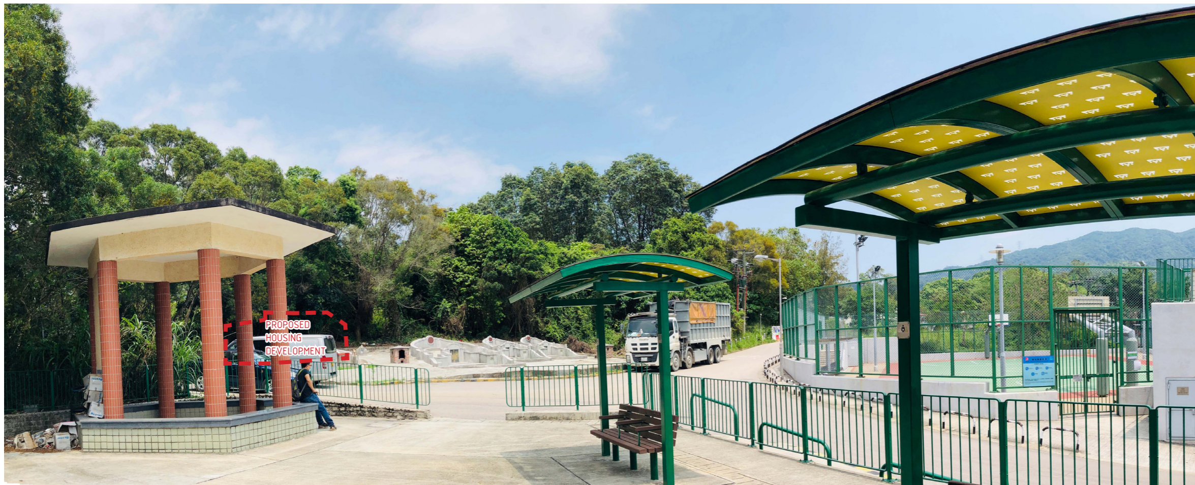
PHOTOMONTAGE WITHOUT MITIGATION AND WITH MITIGATION IN DAY 1 AND YEAR 10

(HOUSING DEVELOPMENT WILL BE BLOCKED BY EXISTING TREES AND VEGETATION AT THIS VP)