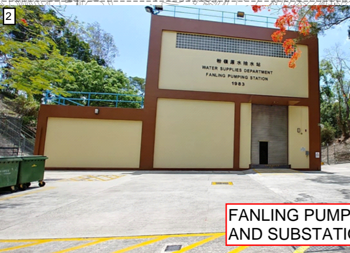
FANLING PUMPING STATION AND SUBSTATION