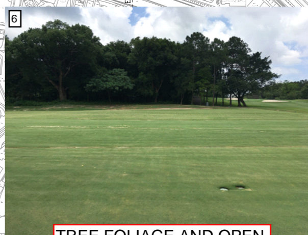
TREE FOLIAGE AND OPEN FAIRWAYS