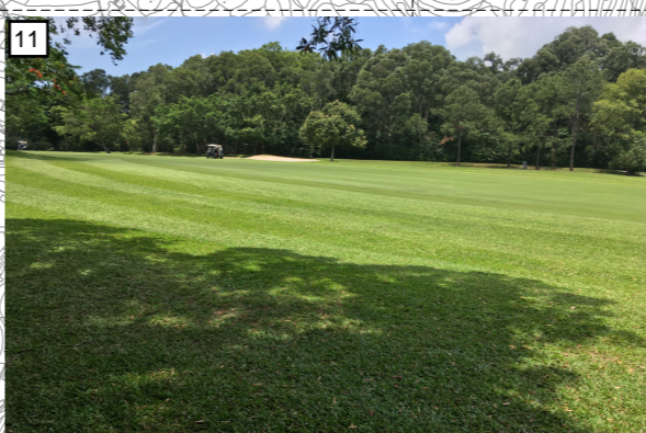
TREE FOLIAGE AND OPEN FAIRWAYS