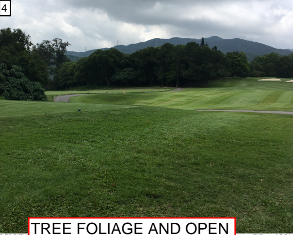
TREE FOLIAGE AND OPEN FAIRWAYS