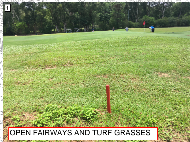
OPEN FAIRWAYS AND TURF GRASSES