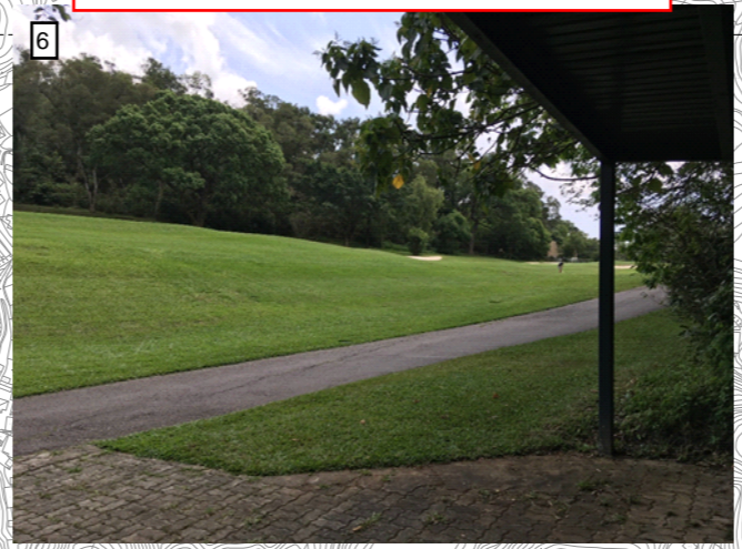
TREE FOLIAGE, OPEN FAIRWAYS AND TURF GRASSES