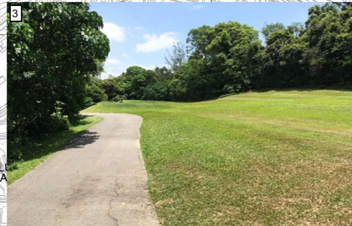
PAVEMENT, OPEN FAIRWAYS AND TURF GRASSES