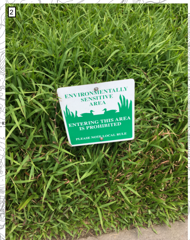
ENVIRONMENTALLY SENSITIVE AREA - PROTECTED AREA (SWAMPY WOODLAND)