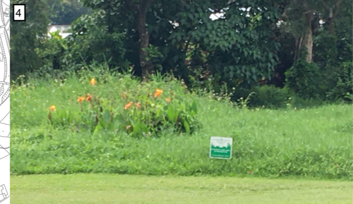
ENVIRONMENTALLY SENSITIVE AREA - PROTECTED AREA (MARSH)