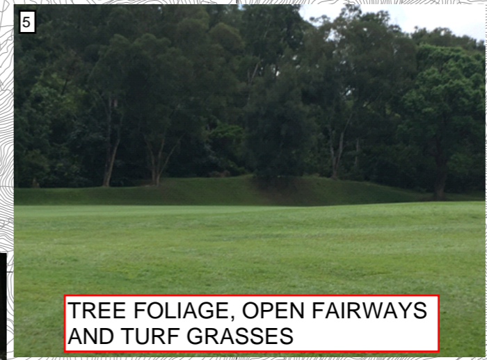
TREE FOLIAGE, OPEN FAIRWAYS AND TURF GRASSES