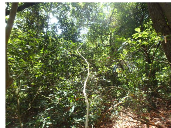
Fung Shui Woodland