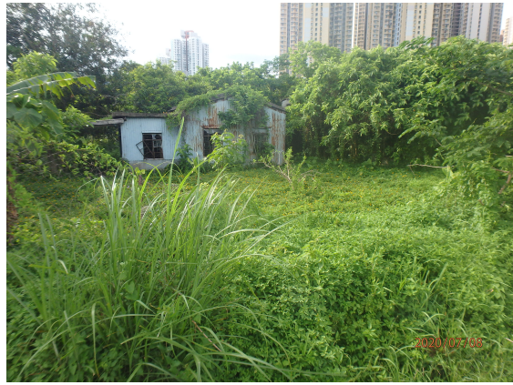
Abandoned Agriculture Land