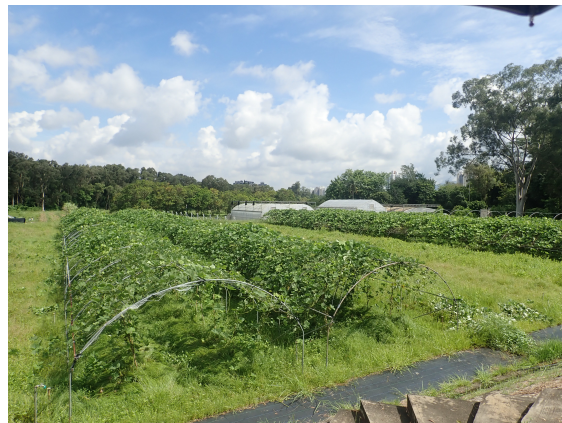
Active Agriculture Land