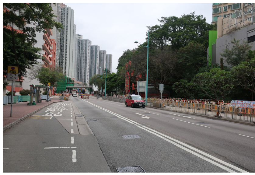
LR.2.1 - ROADSIDE PLANTATION