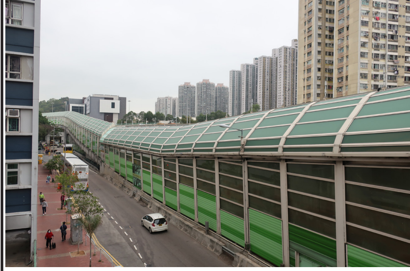
LR1.4 - LIGHT RAIL TRANSIT