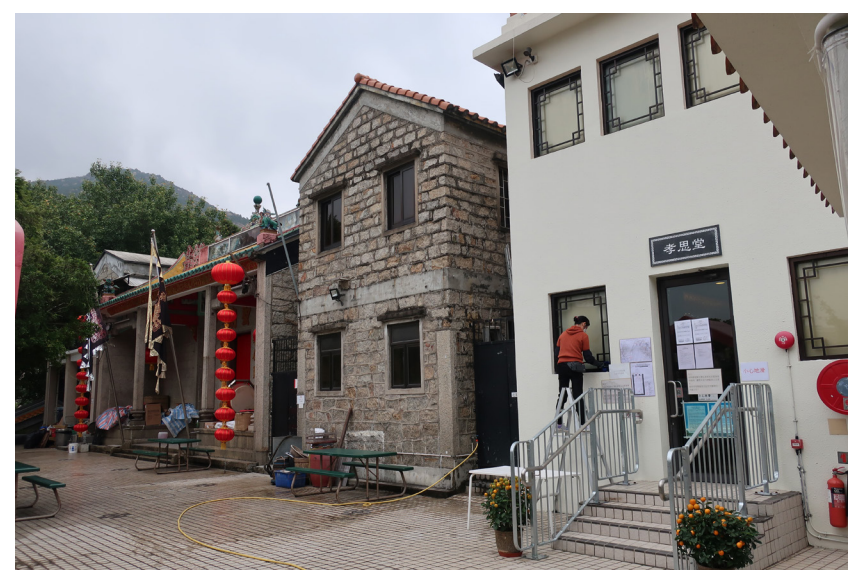
LR9 - OTHERS