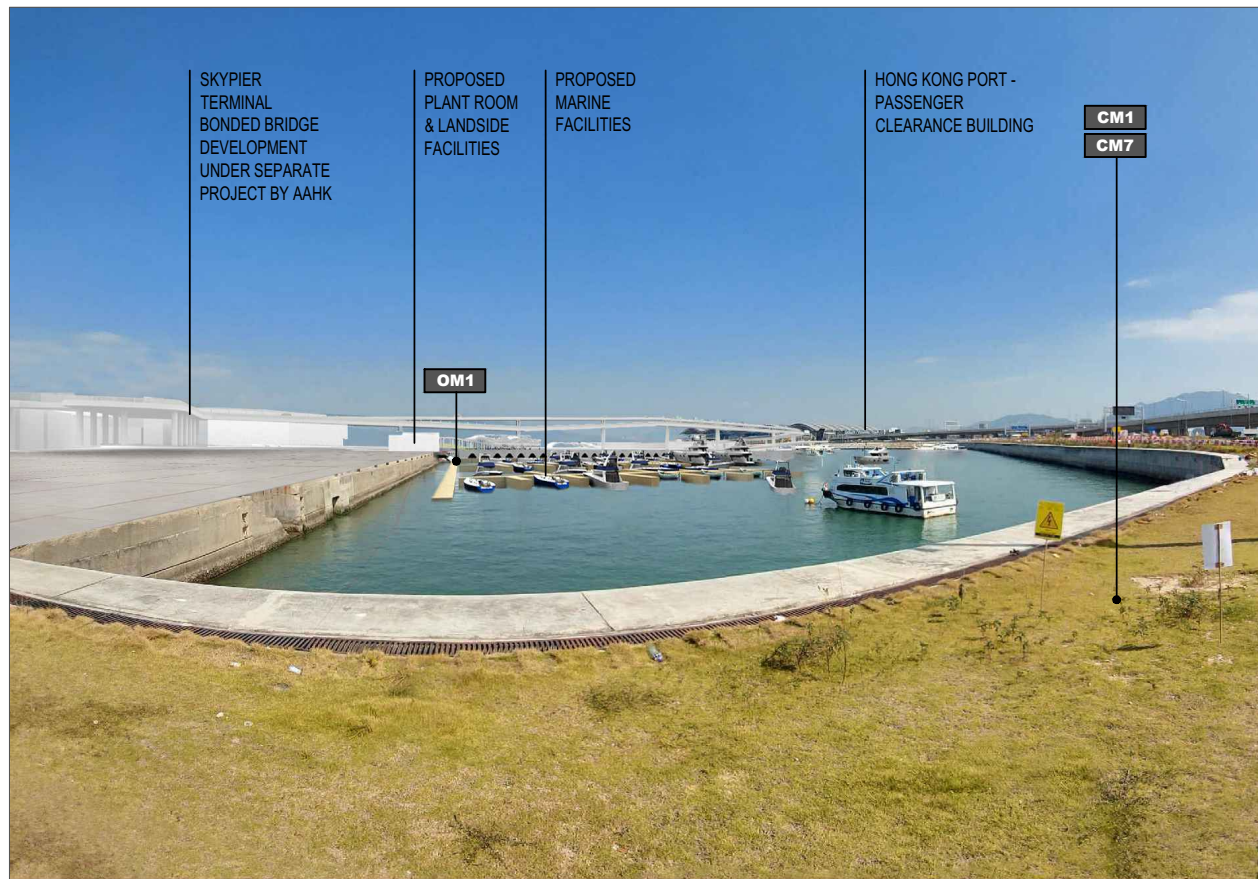
Day 1 Operational Phase With Mitigation Measure