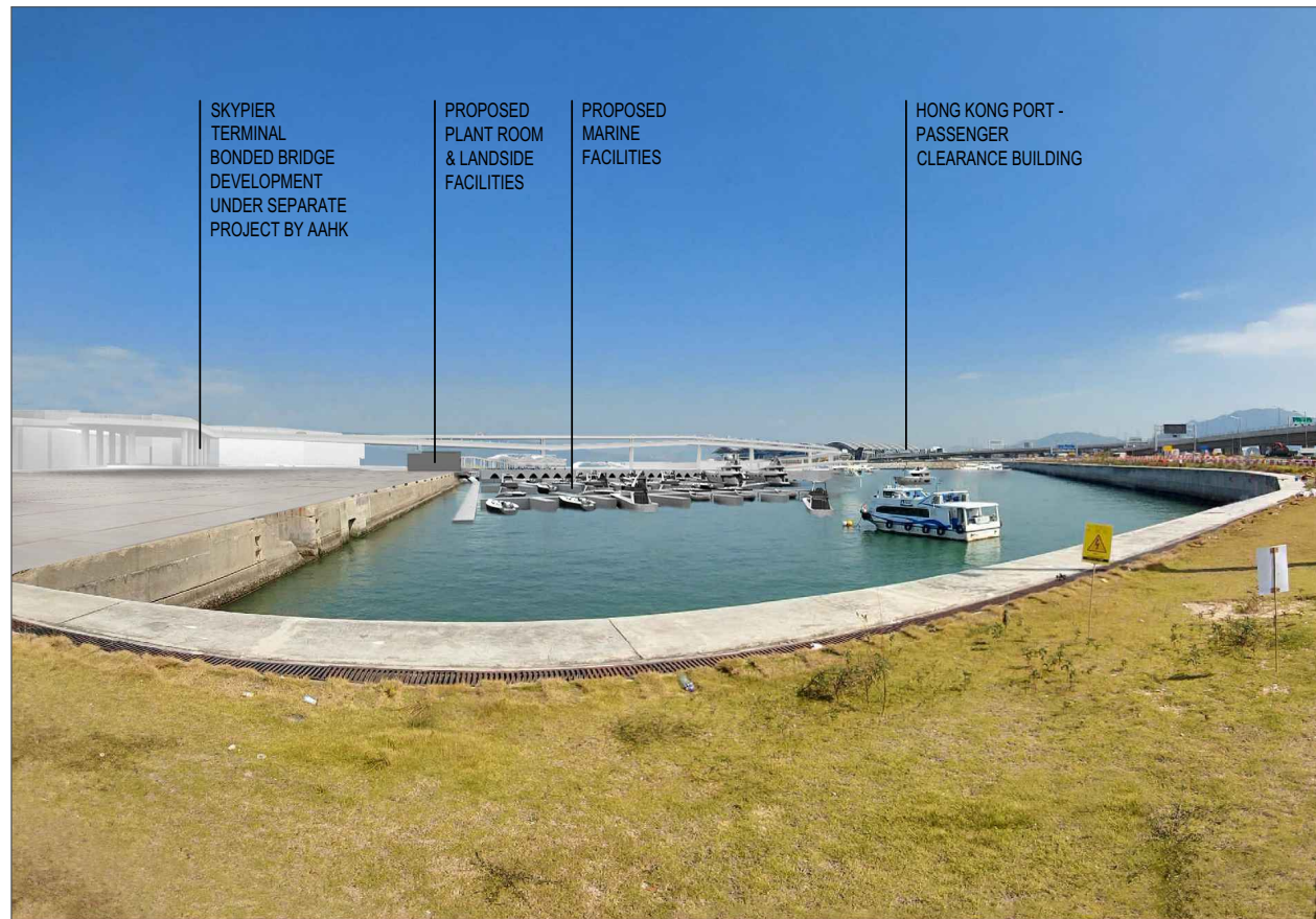
Day 1 Operational Phase Without Mitigation Measure