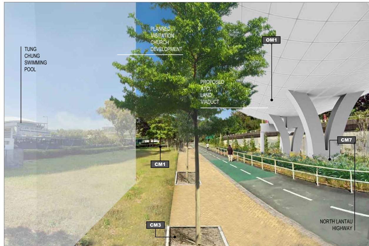
Year 10 Operational Phase With Mitigation Measure