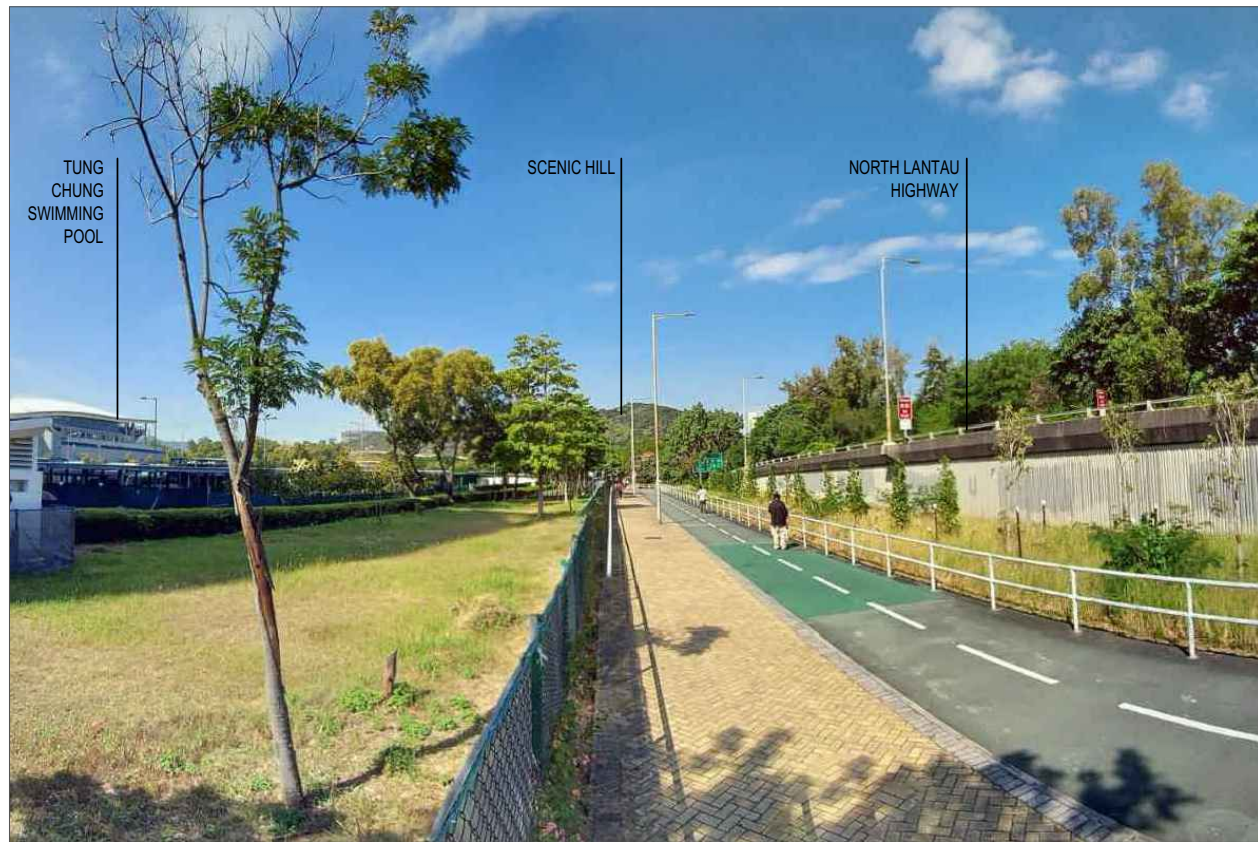
VP4 (from bike lane adjacent to the planned Visitation Church): Existing Condition