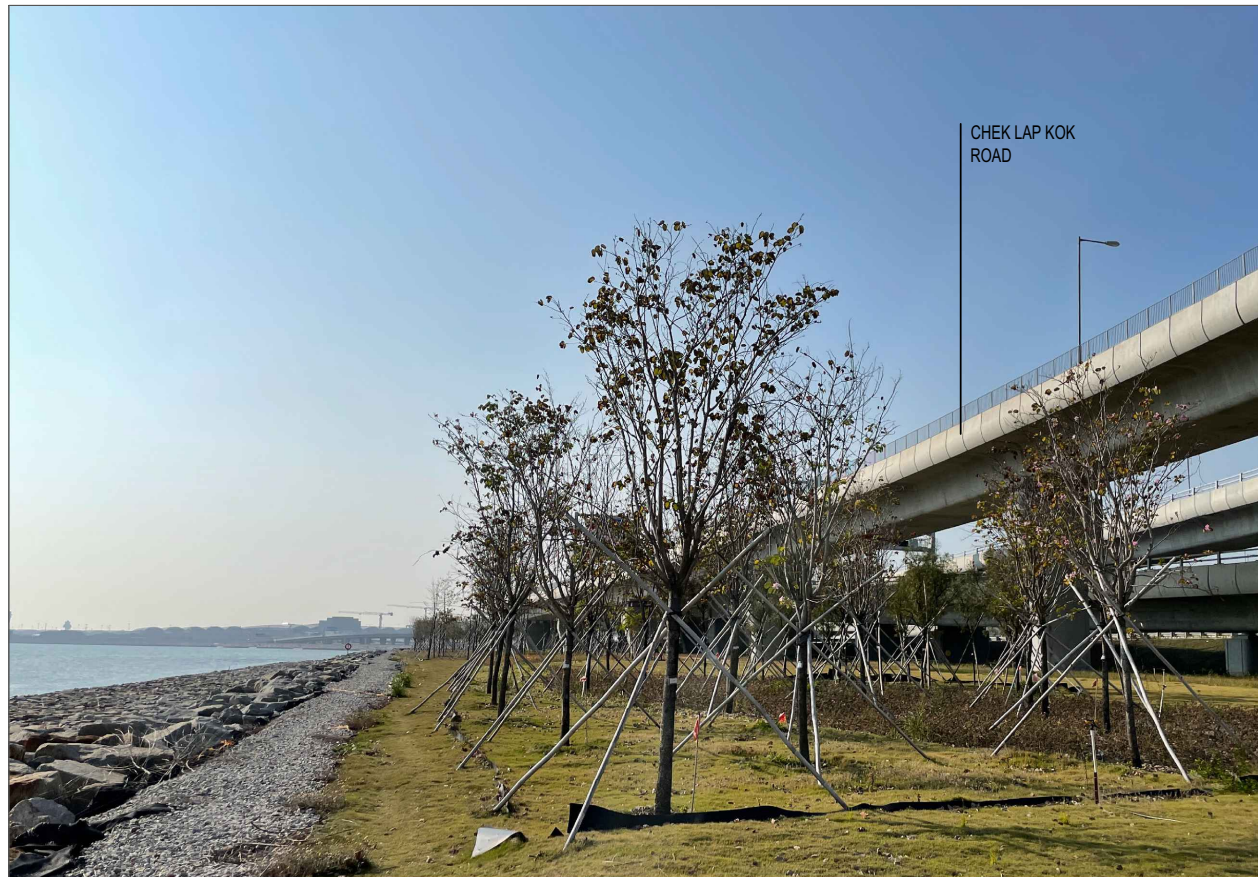
VP11 (from area adjacent to the planned Hong Kong International Aviation Academy): Existing Condition