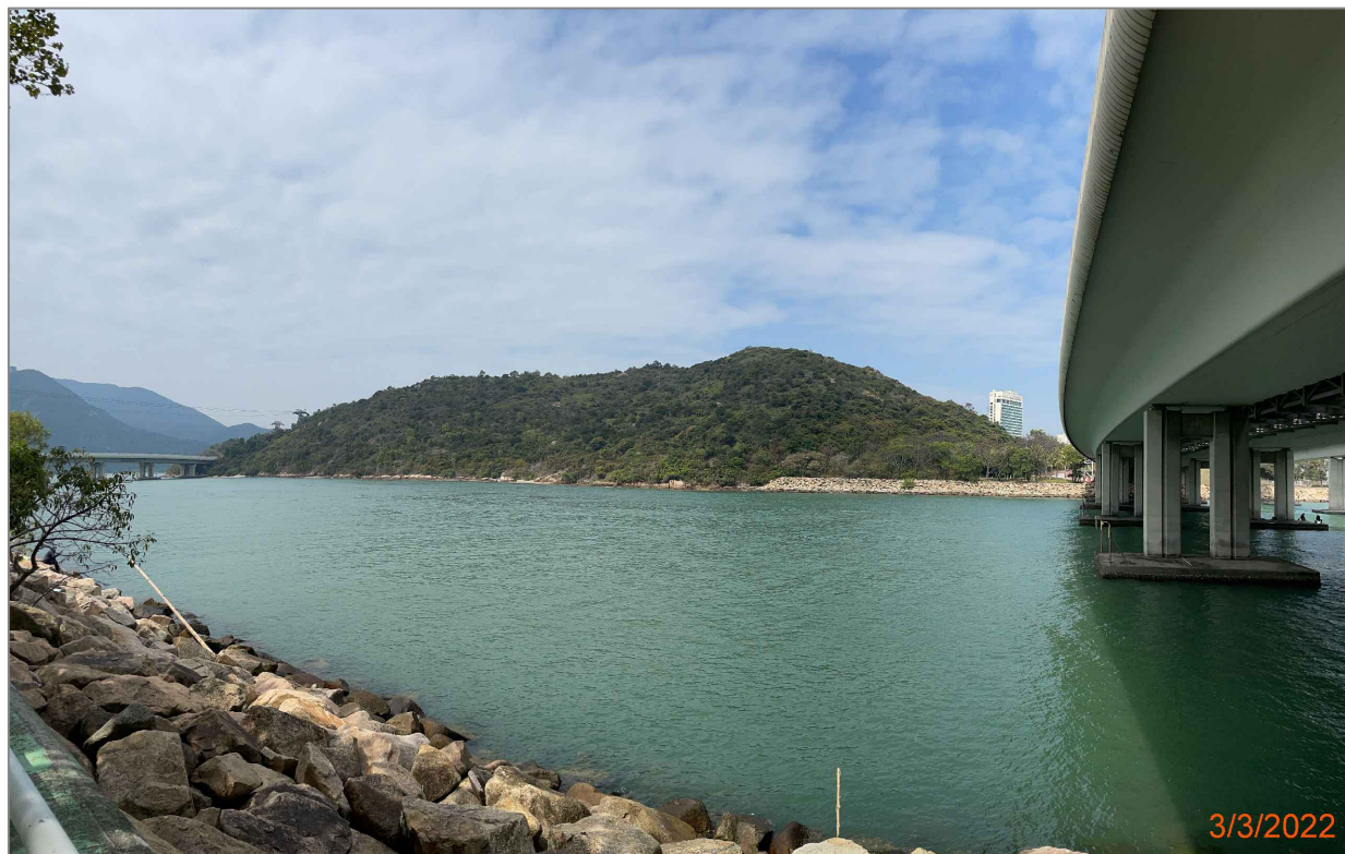
LR1 (WOODLAND, SHRUBLAND & GRASSLAND IN SCENIC HILL)