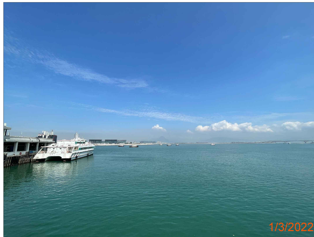
LR2 (COASTAL WATER OF TUNG CHUNG BAY)