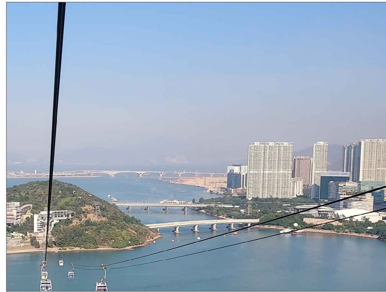
VSR15 (TRANSPORTATION VSR OF CHEK LAP KOK ROAD & CHEK LAP KOK SOUTH ROAD)