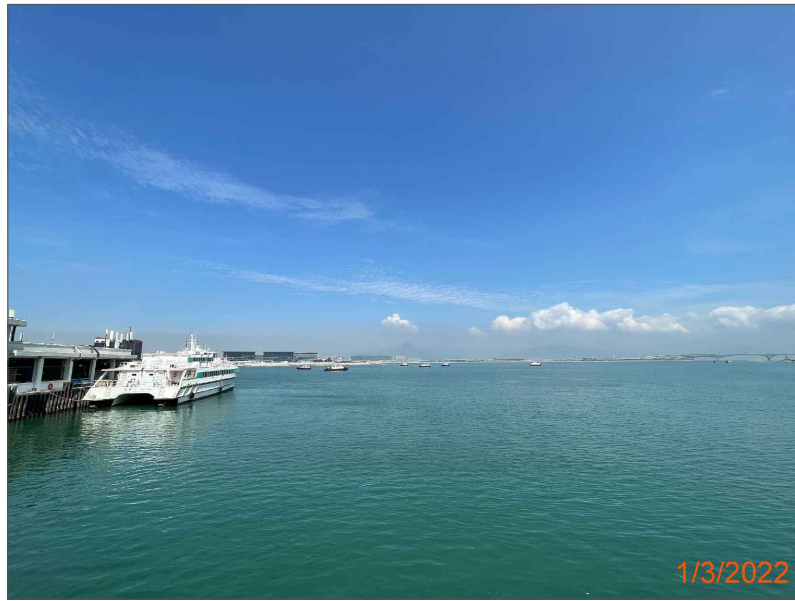
VSRs12,13&14 (RECREATIONAL, OCCUPATIONAL, & TRANSPORTATION VSRS OF TUNG CHUNG DEVELOPMENT PIER)