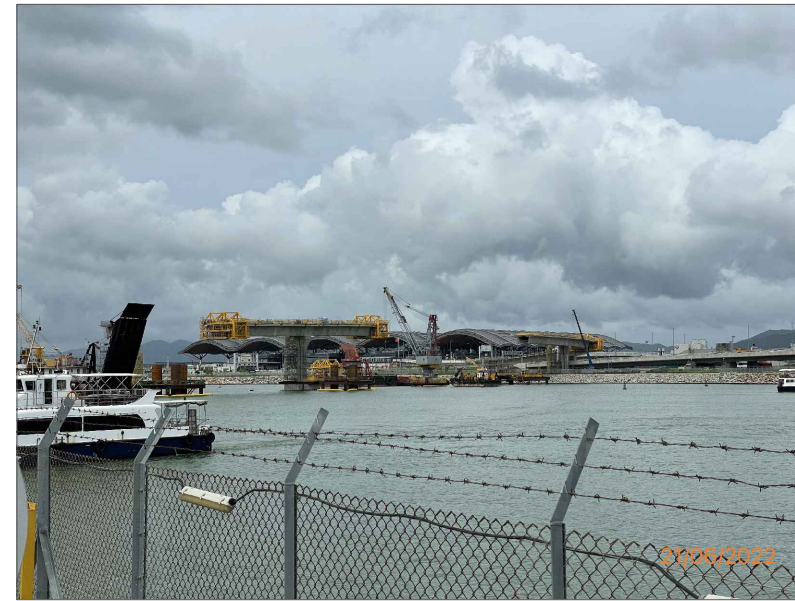
VSRs16&17 (OCCUPATIONAL, & TRANSPORTATION VSRS OF PASSENGER CLEARANCE BUILDING IN HKP)