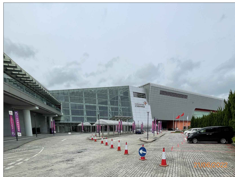
VSRs23&24 (RECREATIONAL & OCCUPATIONAL VSRS OF ASIAWORLD- EXPO)