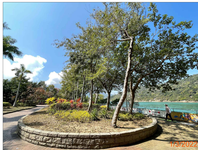
VSR29 (RECREATIONAL VSR OF TUNG CHUNG TOWN CENTRE WATERFRONT PROMENADE)

NOTE(S): NO PHOTO RECORDS FOR DEVELOPMENT UNDER PLANNING / CONSTRUCTION – VSRs 6&7 (RESIDENTIAL AND RECREATIONAL VSRS OF TUNG CHUNG NEW TOWN EXTENSION), VSRs 8&9 (RESIDENTIAL AND OCCUPATIONAL VSRS OF VISITATION CHURCH), VSRs 10&11 (RESIDENTIAL AND OCCUPATIONAL VSRS OF CAMPUS AND DORMITORY OF THE HONG KONG INTERNATIONAL AVIATION ACADEMY), VSRs 30&31 (RECREATIONAL & OCCUPATIONAL VSRS OF PLANNED ECSA HOTELS AND COMMERCIAL DEVELOPMENT)