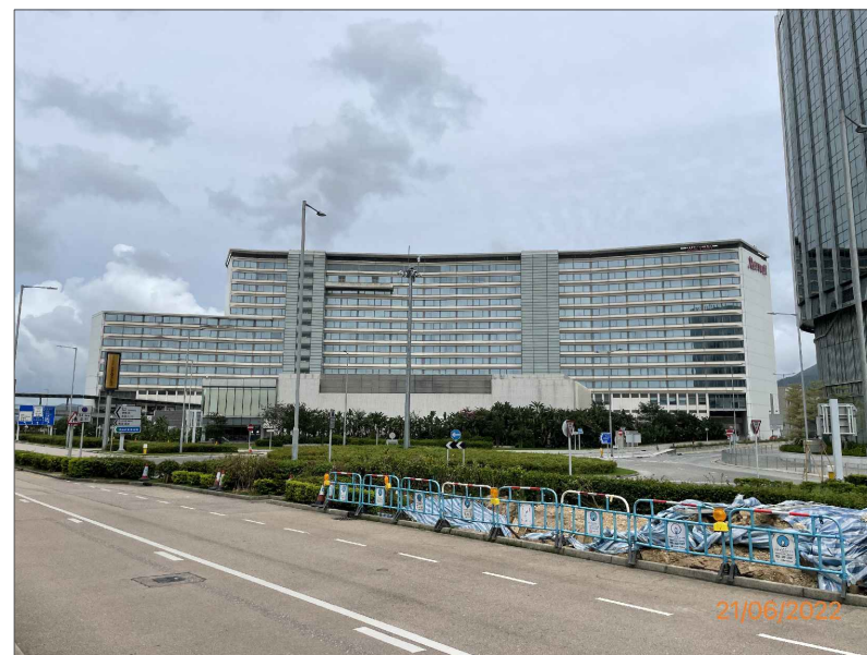
VSRs25&26 (RECREATIONAL & OCCUPATIONAL VSRS OF HONG KONG SKYCITY MARRIOTT HOTEL)