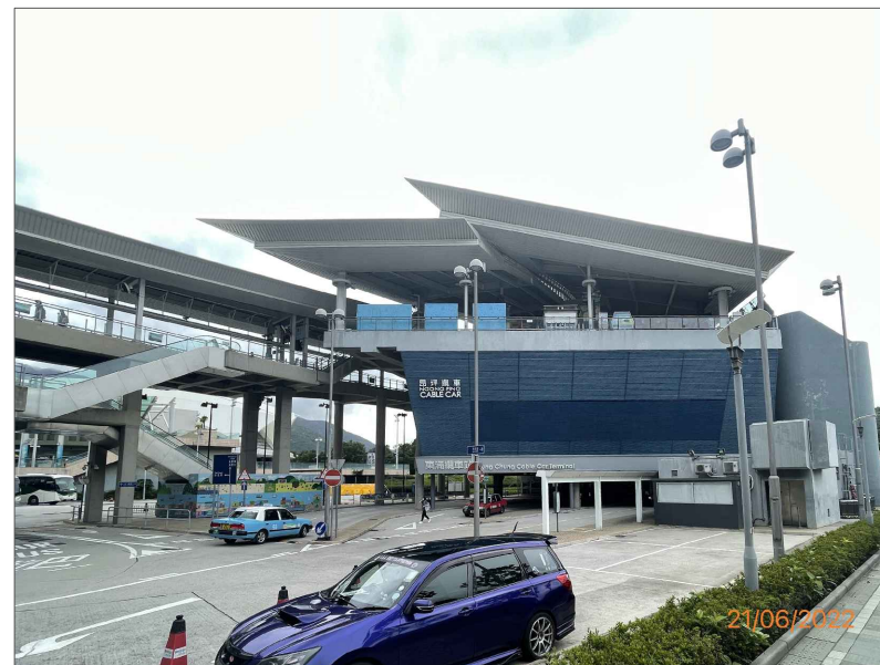
VSR21 (RECREATIONAL VSR OF NGONG PING CABLE CAR)