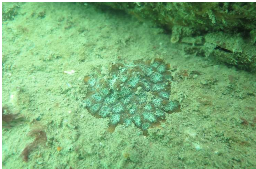
c) Hard coral Oulastrea crispata recorded at D1 during the survey.