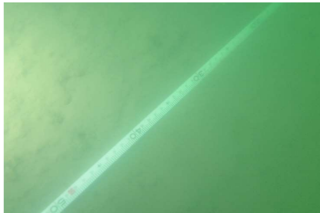
b) Muddy bottom recorded at D1 during the survey.