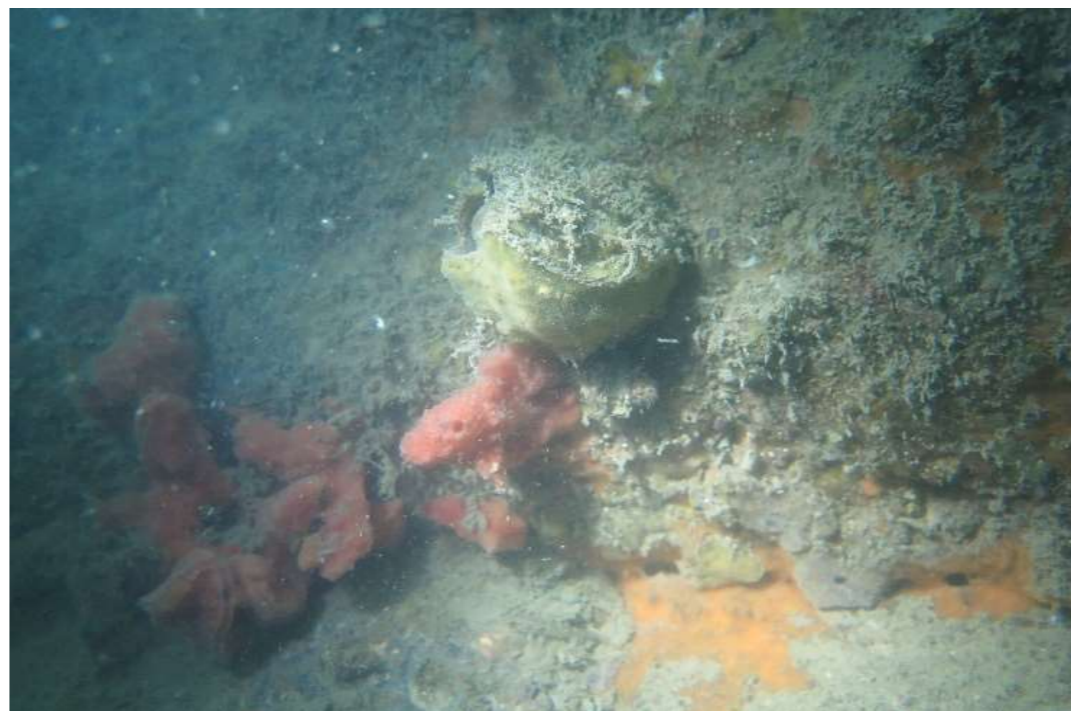
b) Sponges recorded at D2 during the survey.