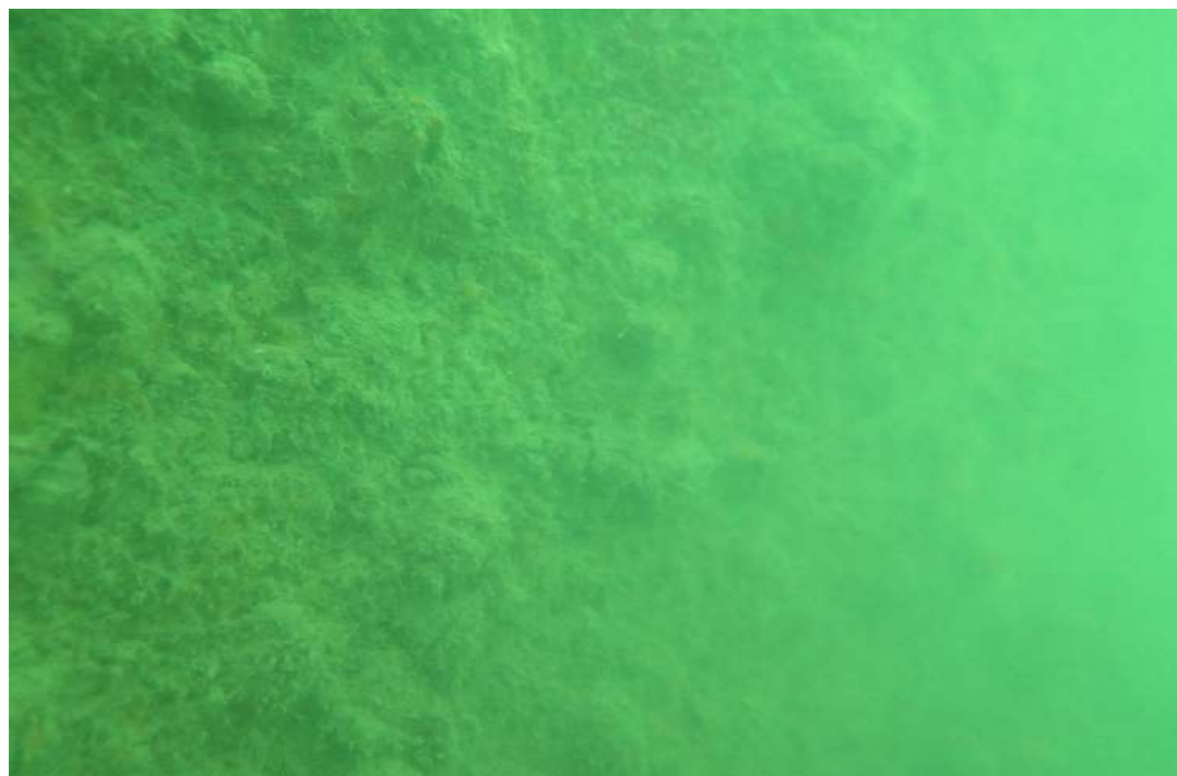
a) Artificial shoreline recorded at D1 during the survey.