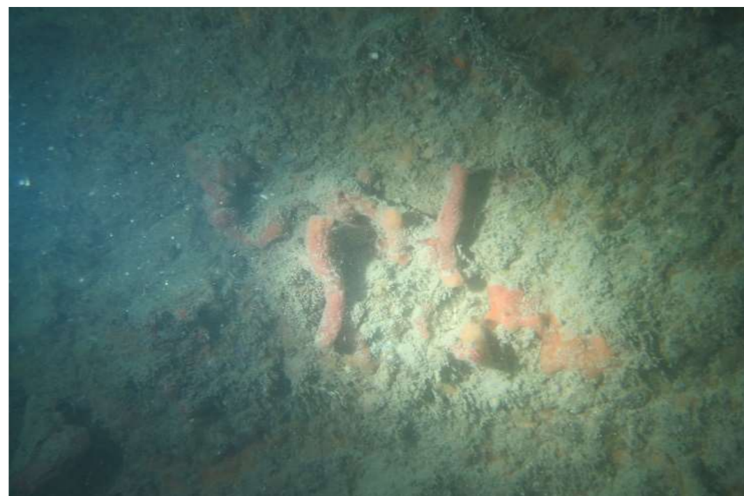
c) Sponges recorded at D1 during the survey.