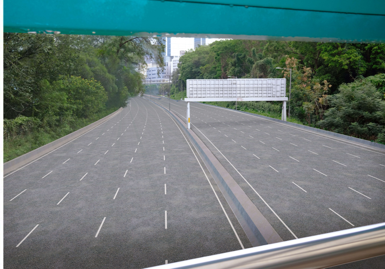
PHOTOMONTAGE VP07 (DAY1 WITHOUT MITIGATION)