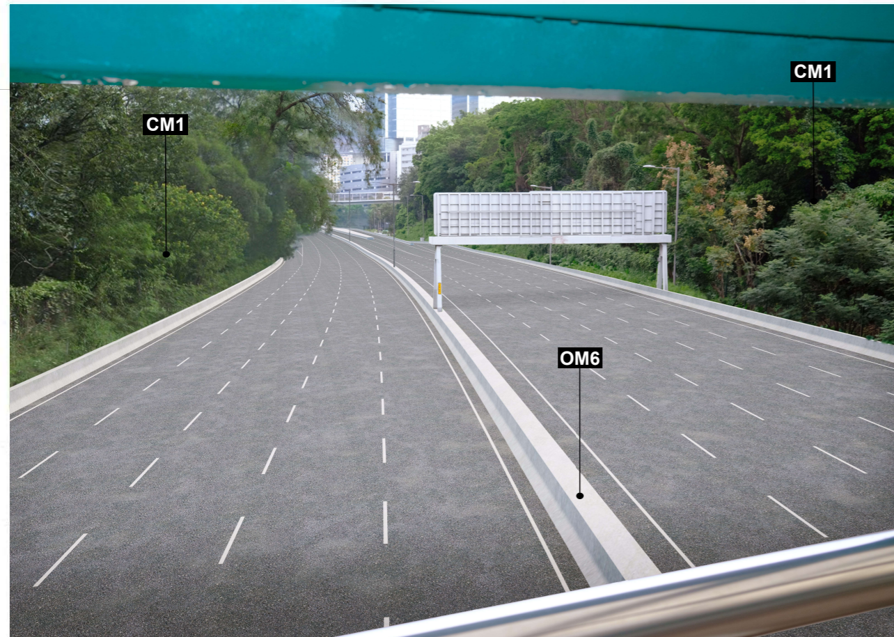
PHOTOMONTAGE VP07 (DAY 1 WITH MITIGATION)