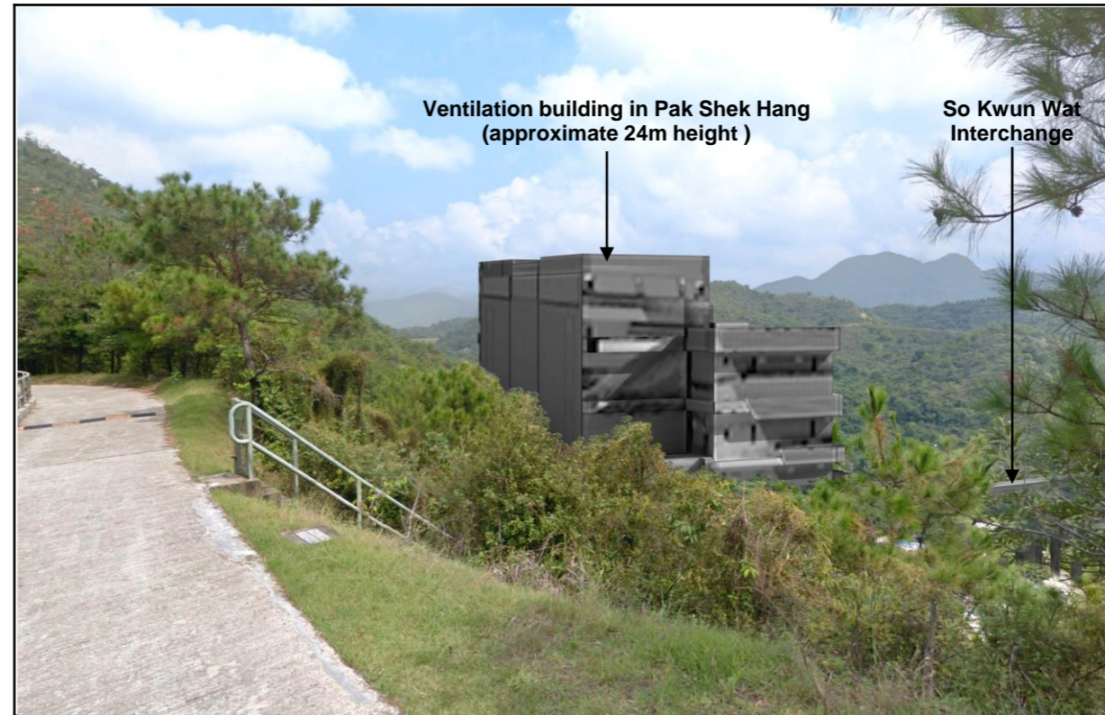
DAY 1 WITHOUT MITIGATION MEASURE