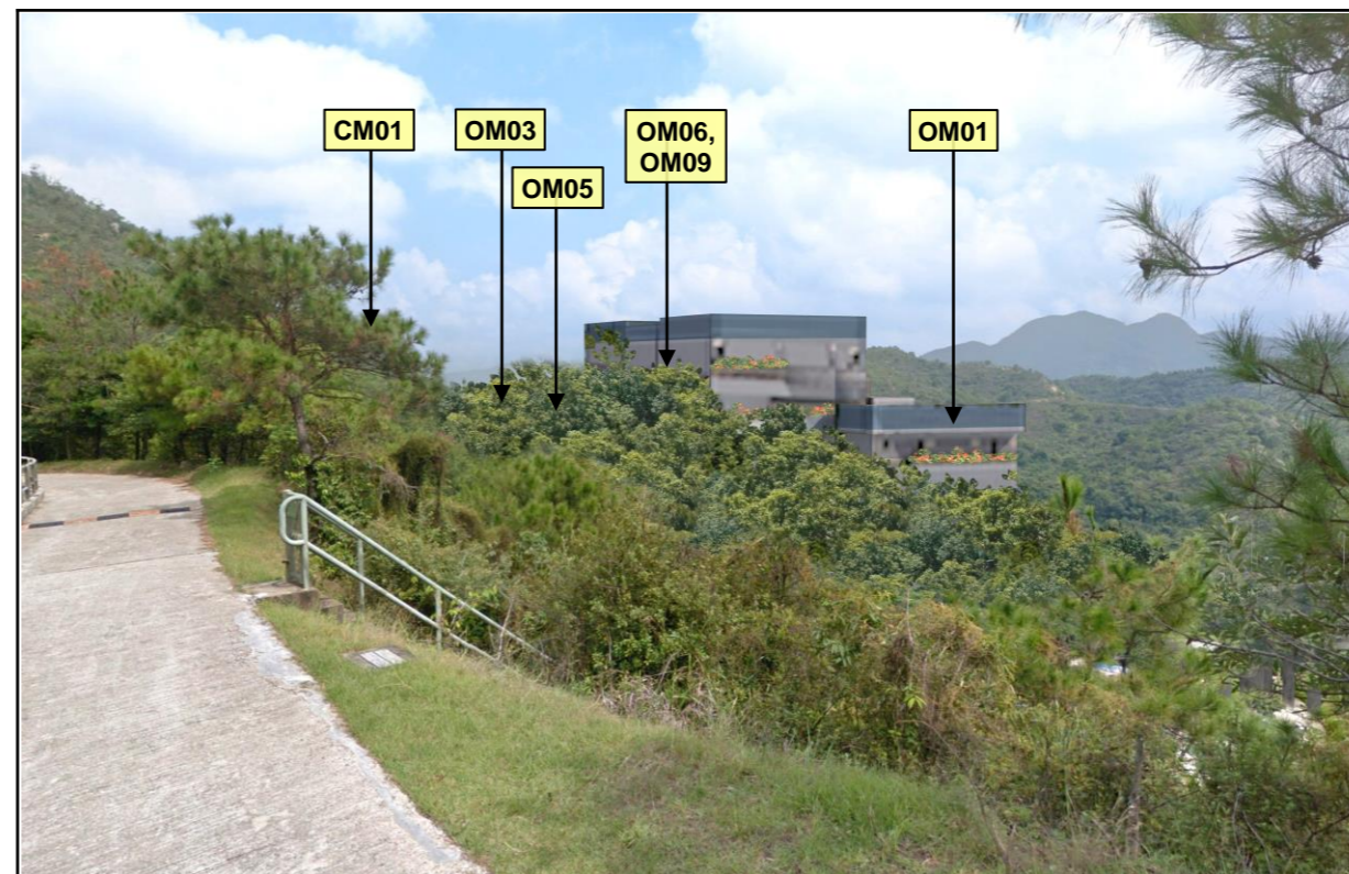
10 YEARS WITH MITIGATION MEASURE