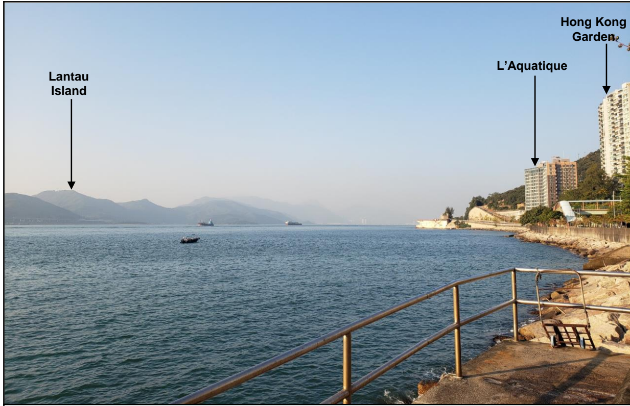
VP-TL12 – EXISTING CONDITION