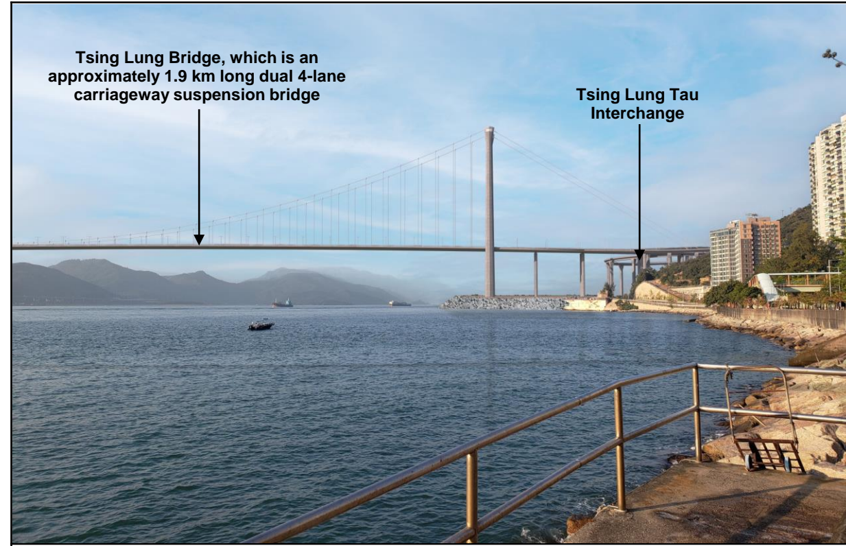
DAY 1 WITHOUT MITIGATION MEASURE