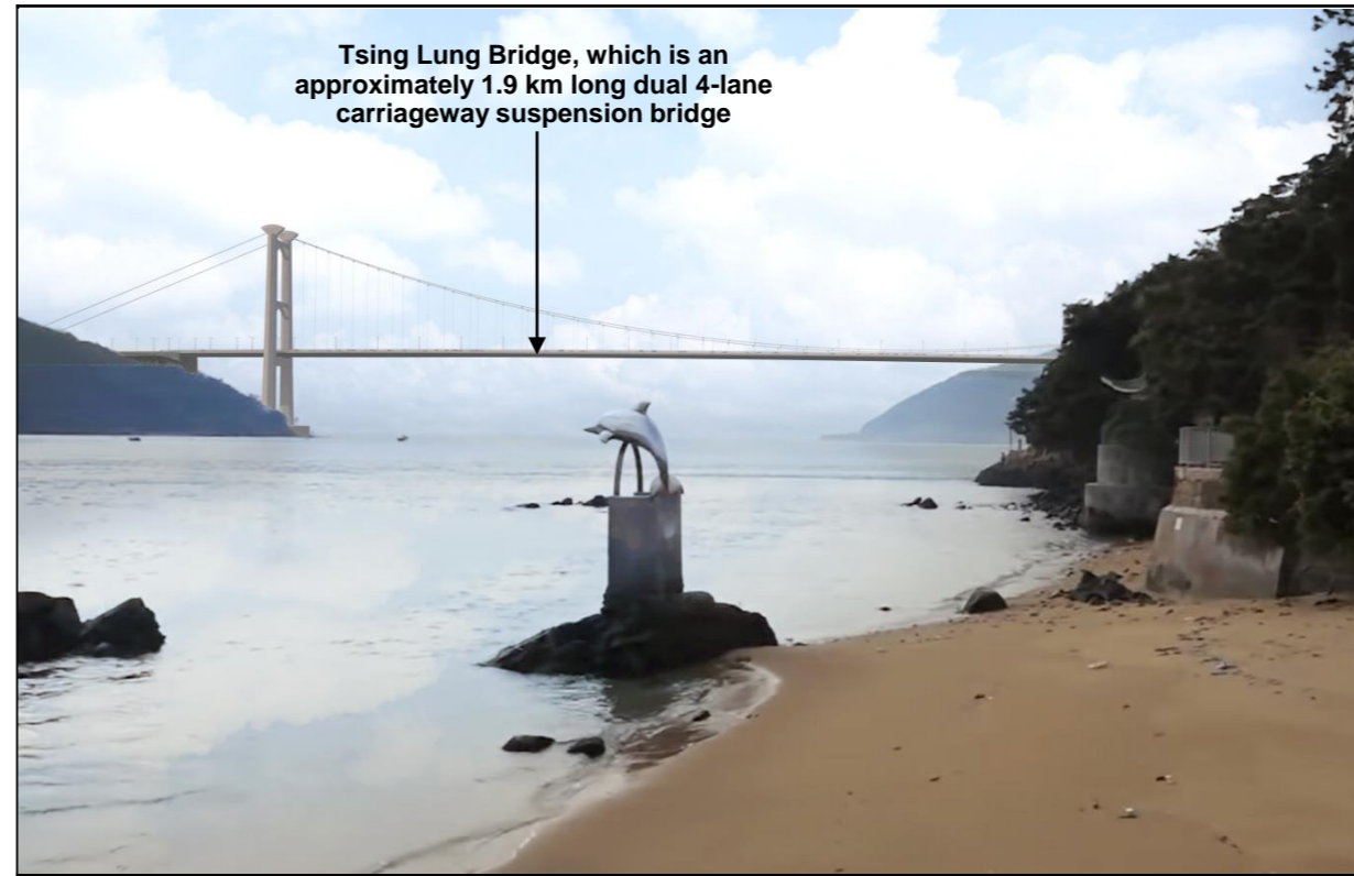
DAY 1 WITHOUT MITIGATION MEASURE