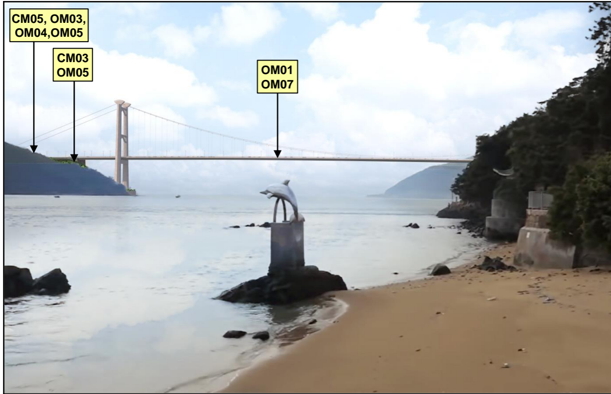
DAY 1 WITH MITIGATION MEASURE