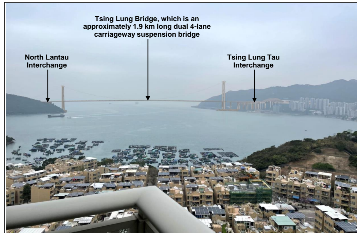
DAY 1 WITHOUT MITIGATION MEASURE