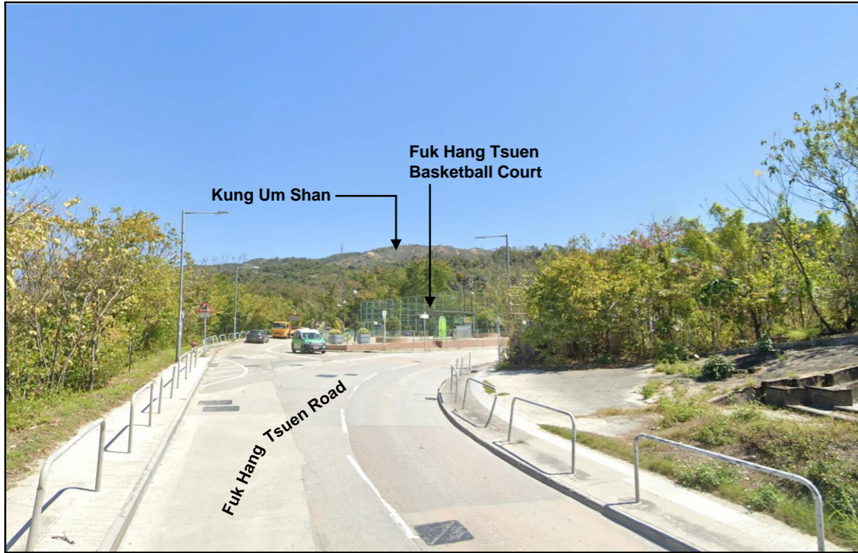
VP-LT5 – EXISTING CONDITION