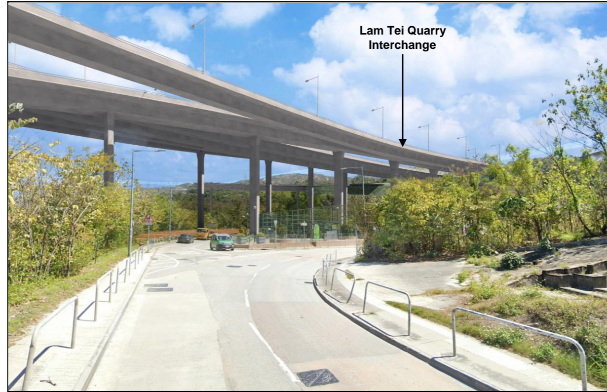
DAY 1 WITHOUT MITIGATION MEASURE