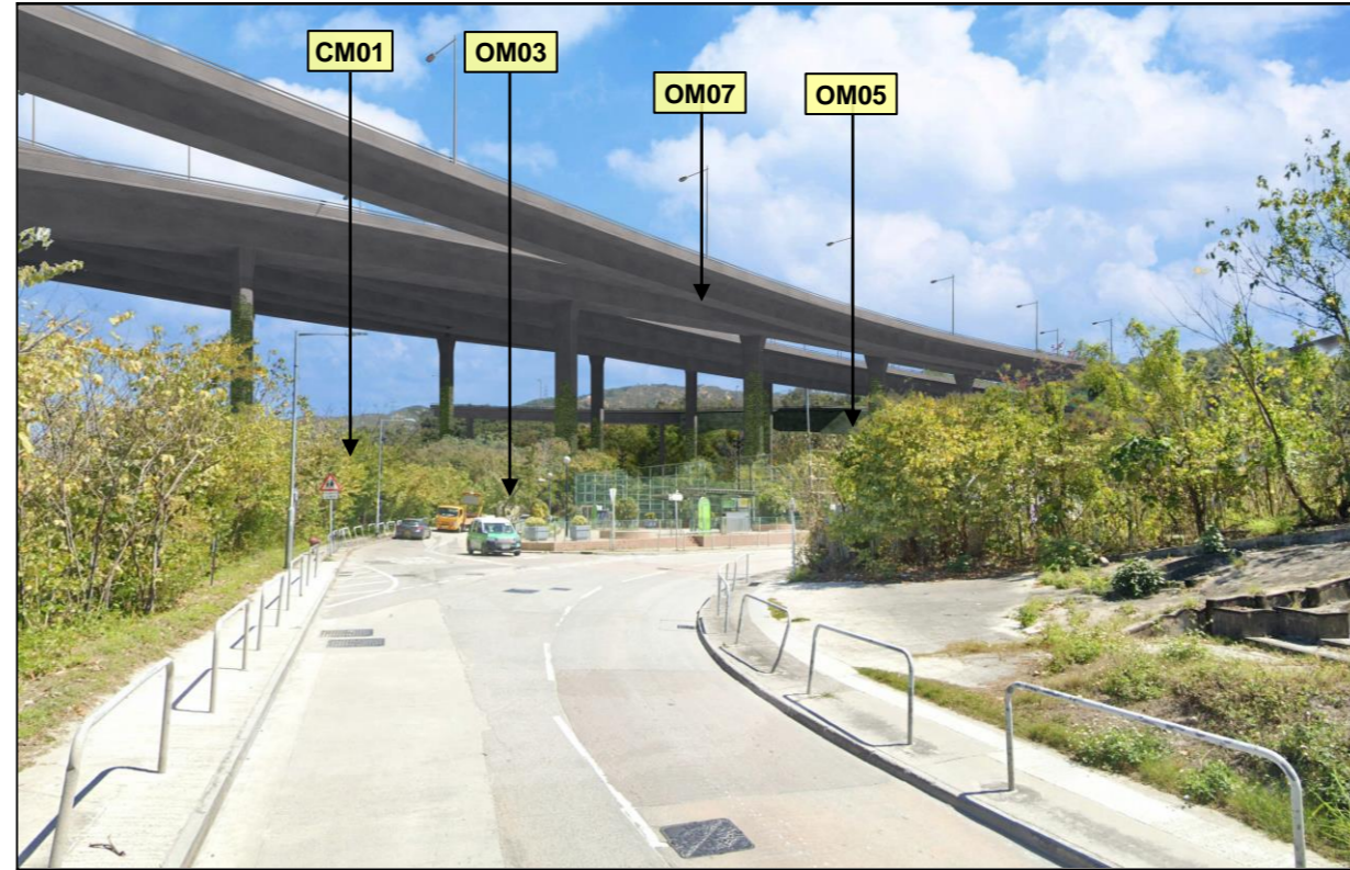
10 YEARS WITH MITIGATION MEASURE