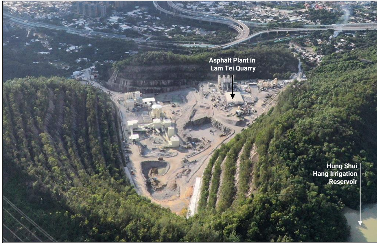
LCA-LT3 – Lam Tei Rural Landscape