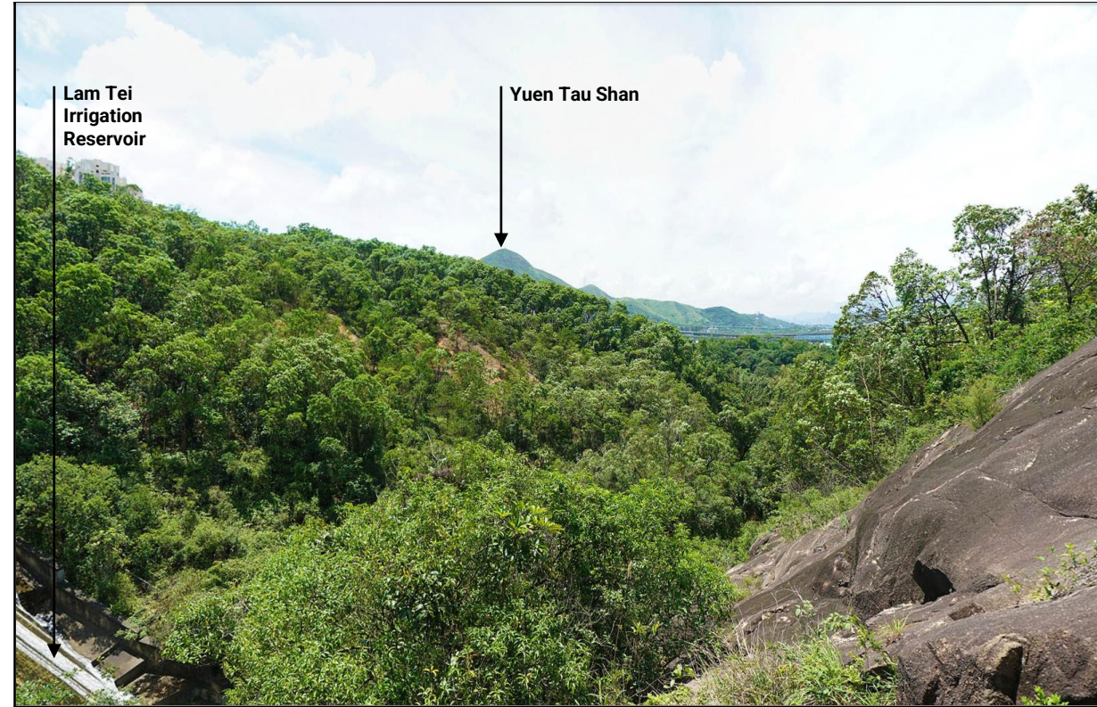
LCA-LT4 – Lam Tei Upland Landscape