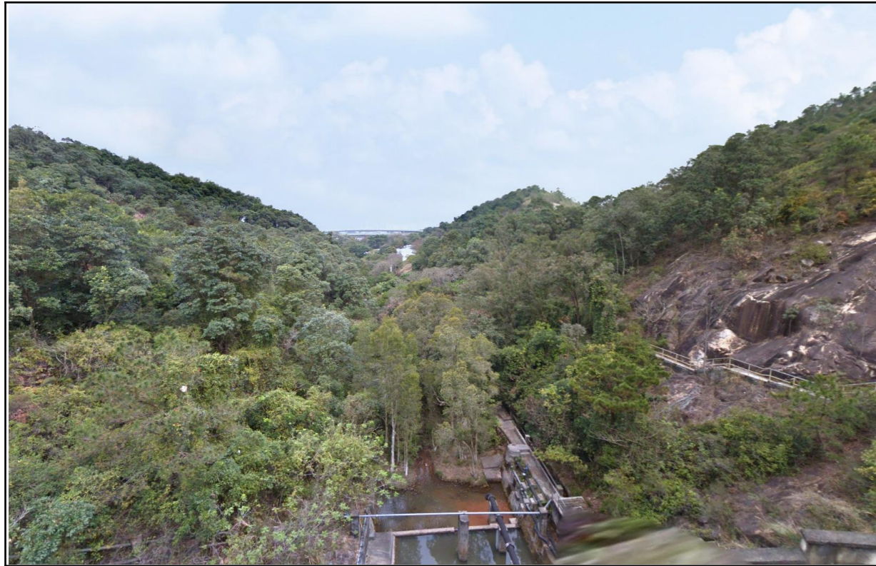
LR-LT7 – Watercourses in Lam Tei