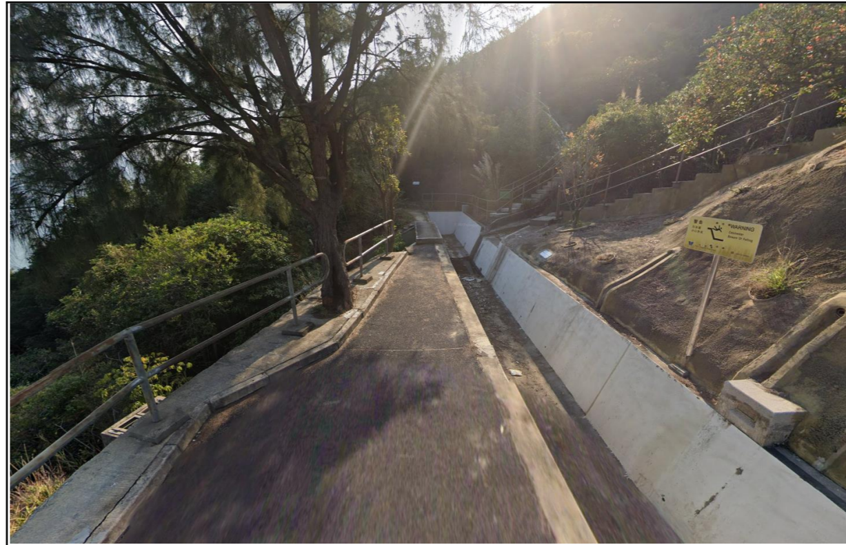
LR-TL7 – Watercourses in Tsing Lung Tau