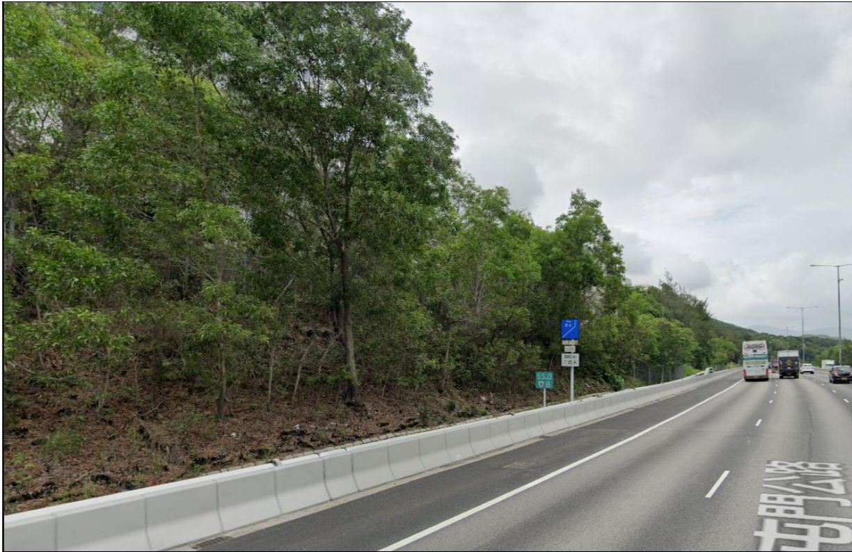
LR-SK-12 – Carriageway and roadside planter in So Kwun Wat