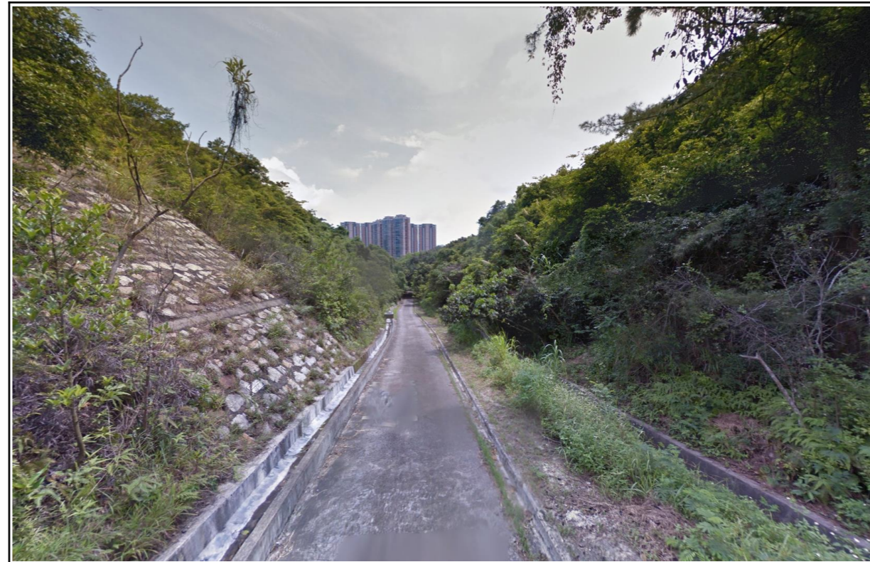
LR-SK2 – Plantations in So Kwun Wat