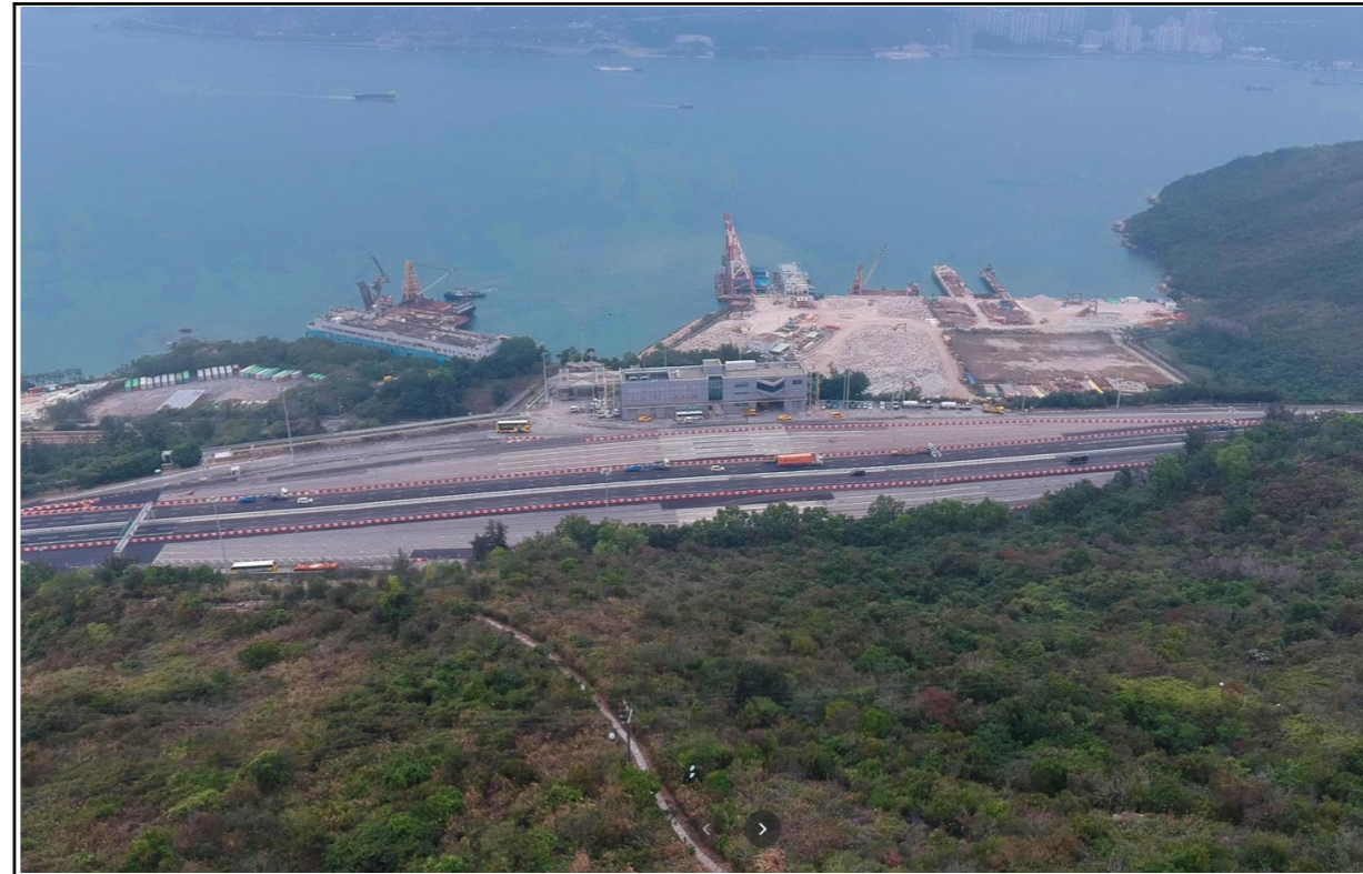
LR-NL11 – Developed Areas in North Lantau