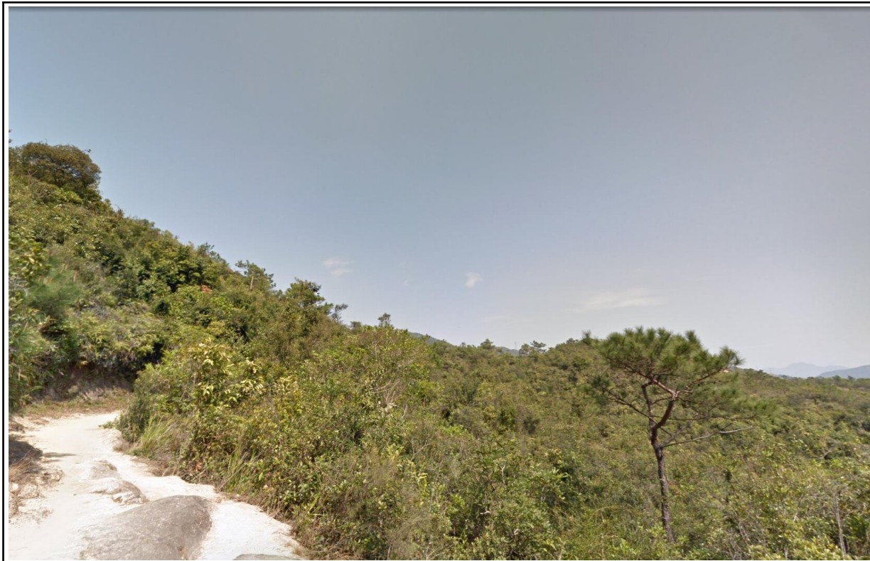
LR-SK4 – Shrublands in So Kwun Wat