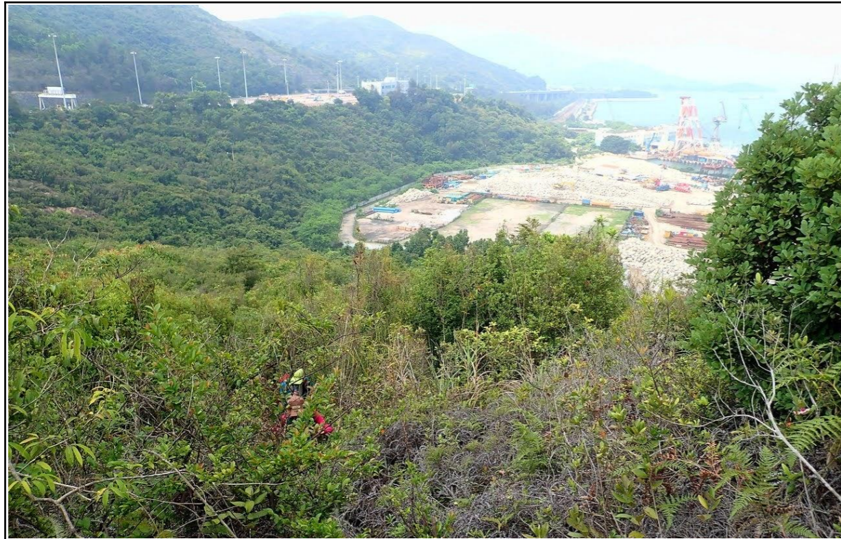
LR-NL1 – Secondary Woodlands in North Lantau