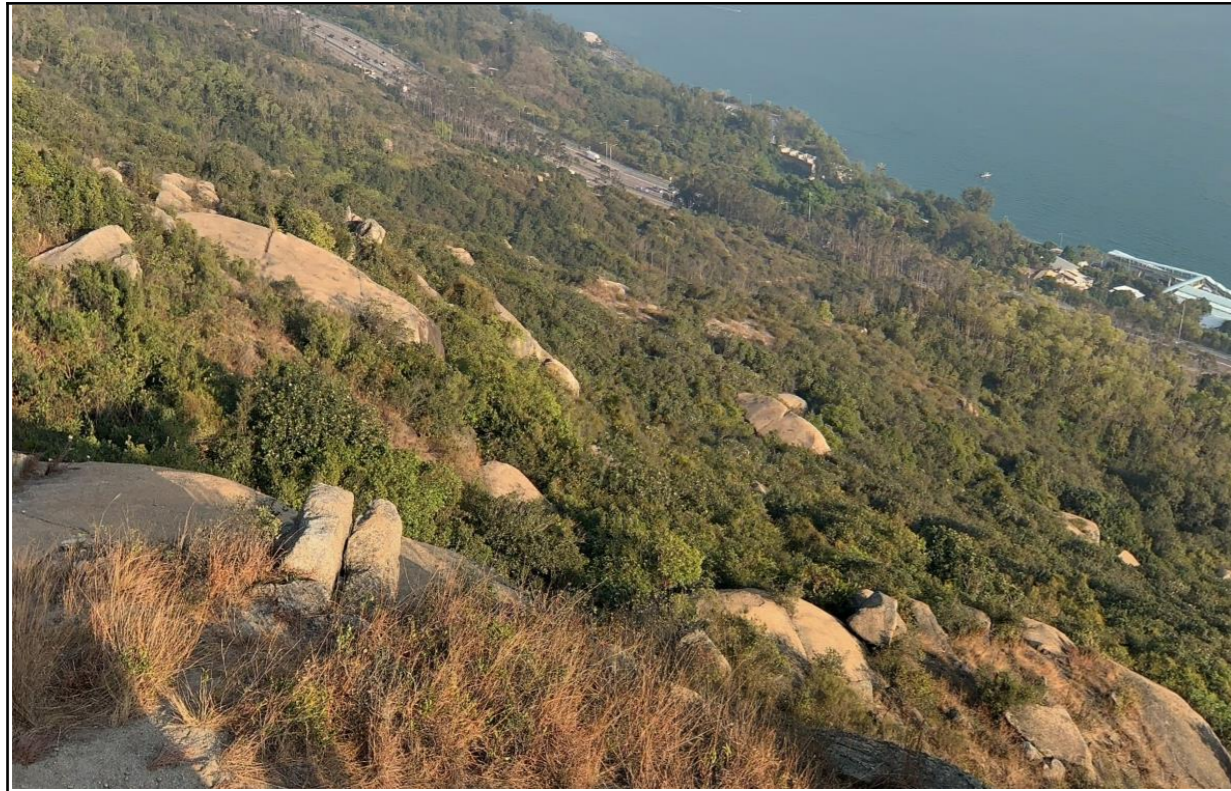
LR-TL4 – Shrublands in Tsing Lung Tau