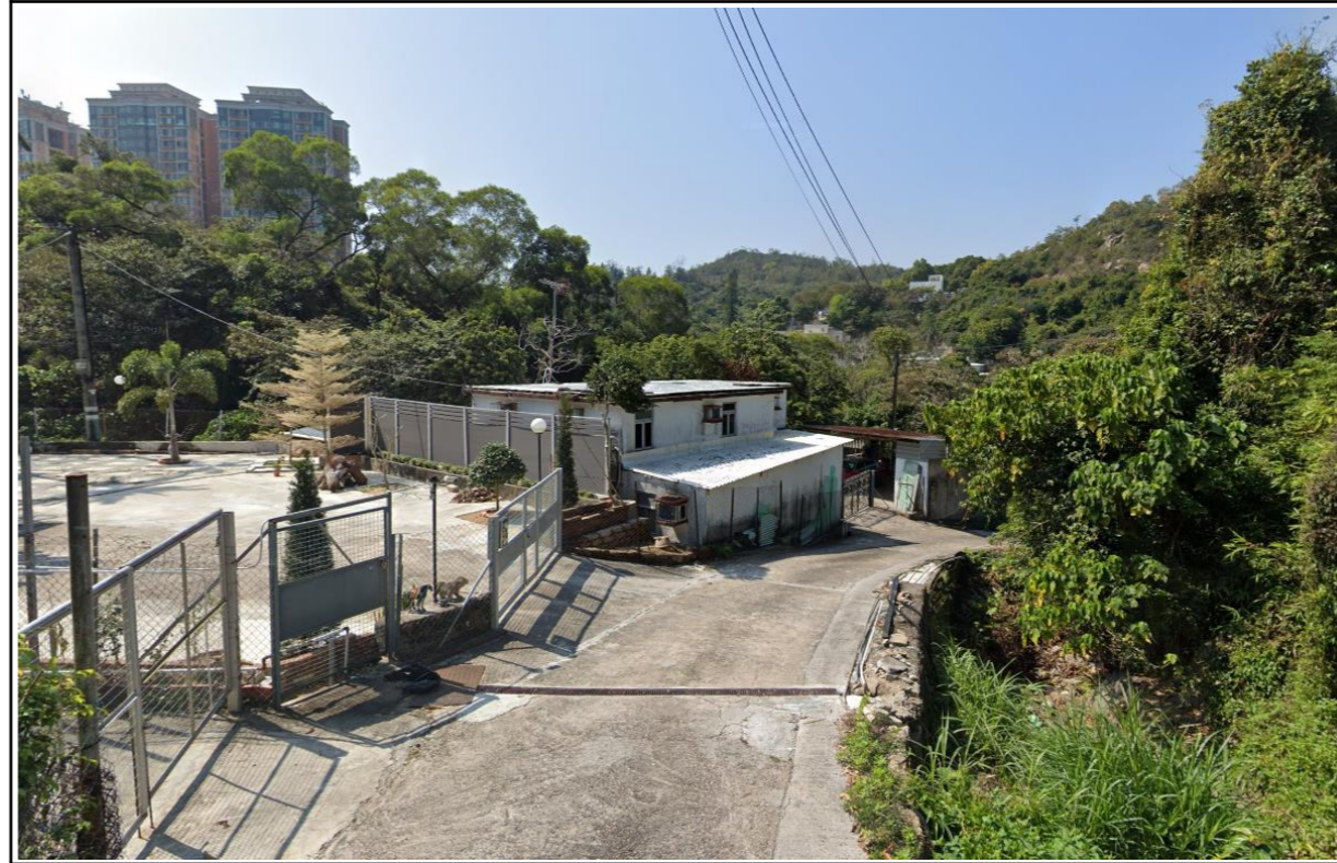
LR-SK11 – Developed Areas in So Kwun Wat