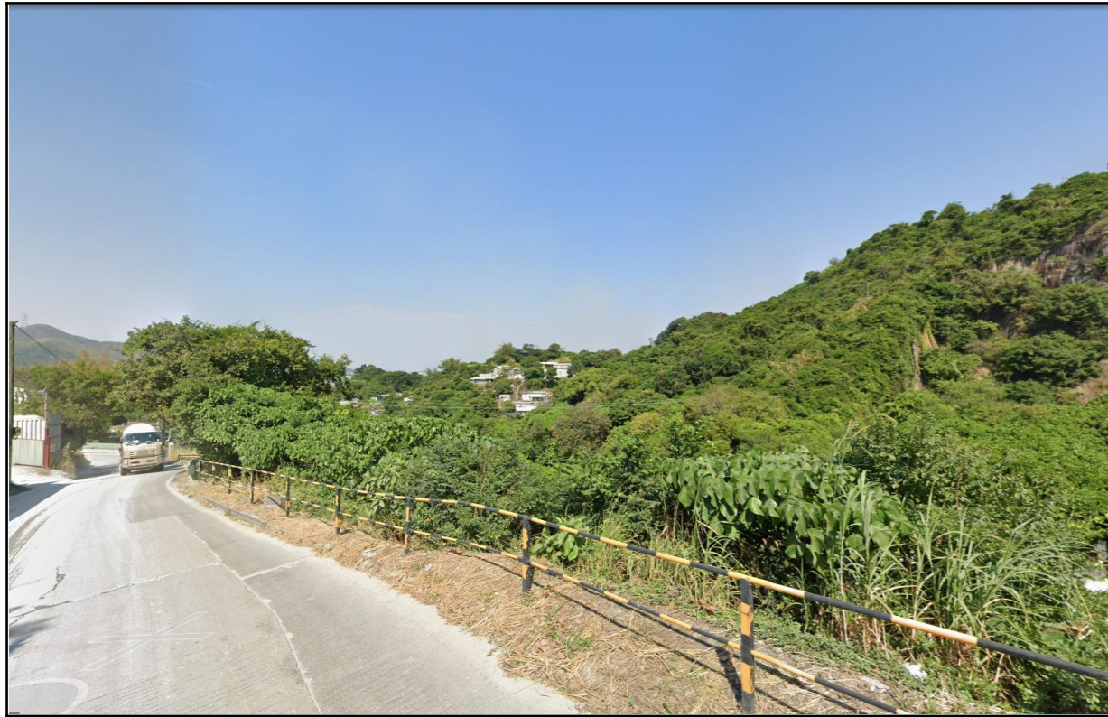
LR-LT1 – Secondary Woodlands in Lam Tei