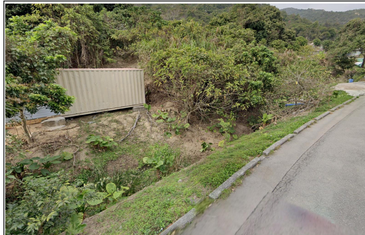
LR-SK7 – Watercourses in So Kwun Wat