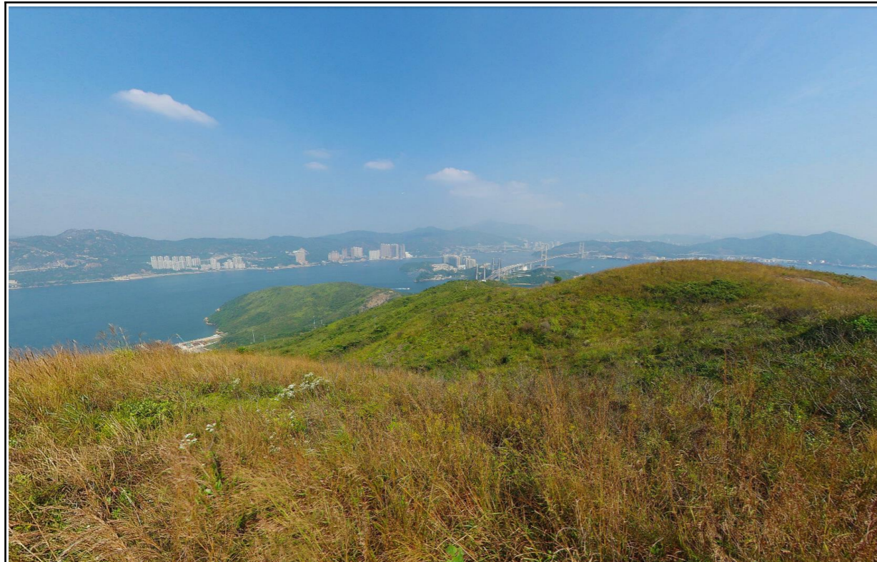
LR-NL4 – Shrublands in North Lantau