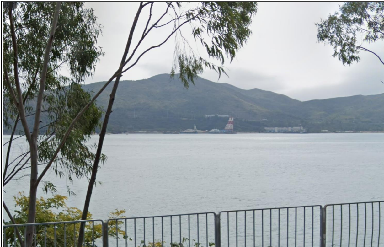
LR-NL10 – Seawater Body and Shorelines at Ha Pang Fairway