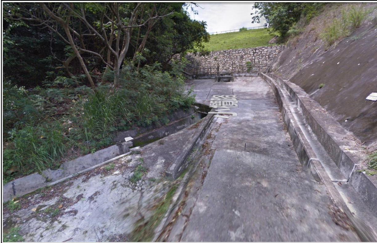
LR-SK7 – Watercourses in So Kwun Wat