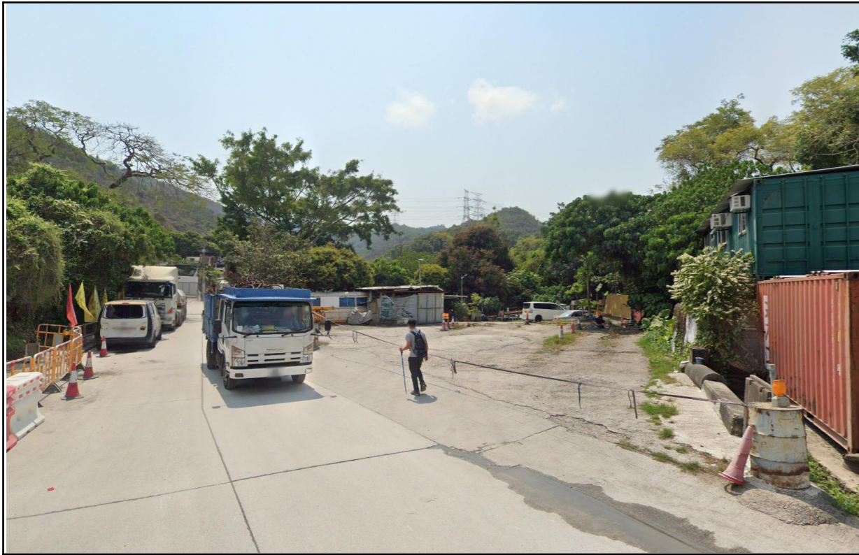
LR-LT11 – Developed Areas in Lam Tei