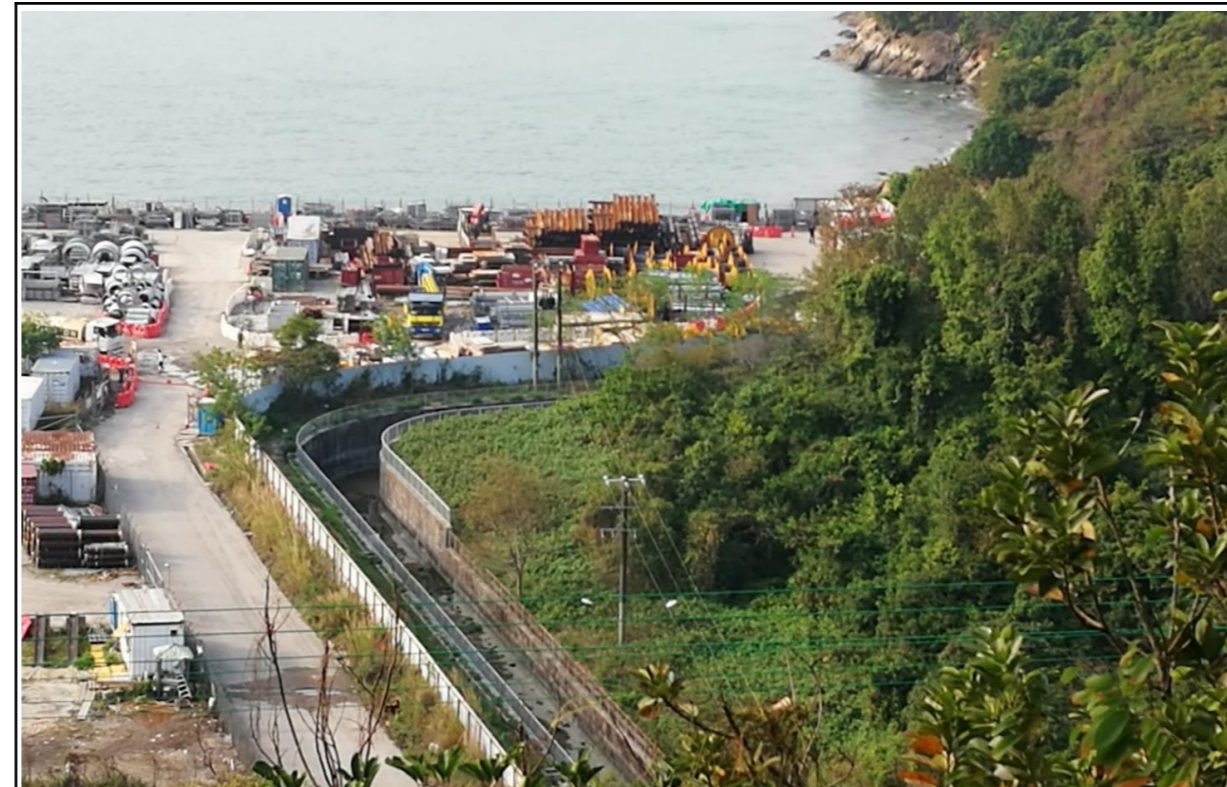
LR-NL7 – Watercourses in North Lantau