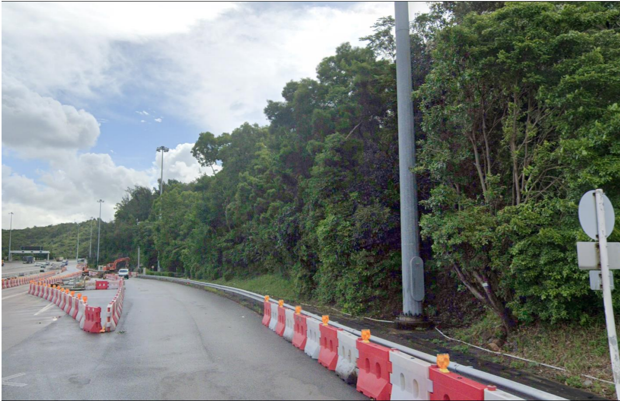
LR-NL-12 – Carriageway and roadside planter in North Lantau