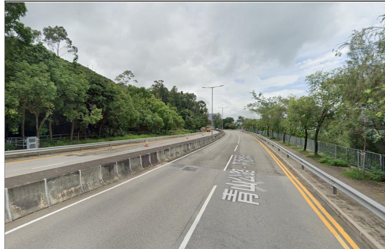
LR-TL-12 – Carriageway and roadside planter in Tsing Lung Tau