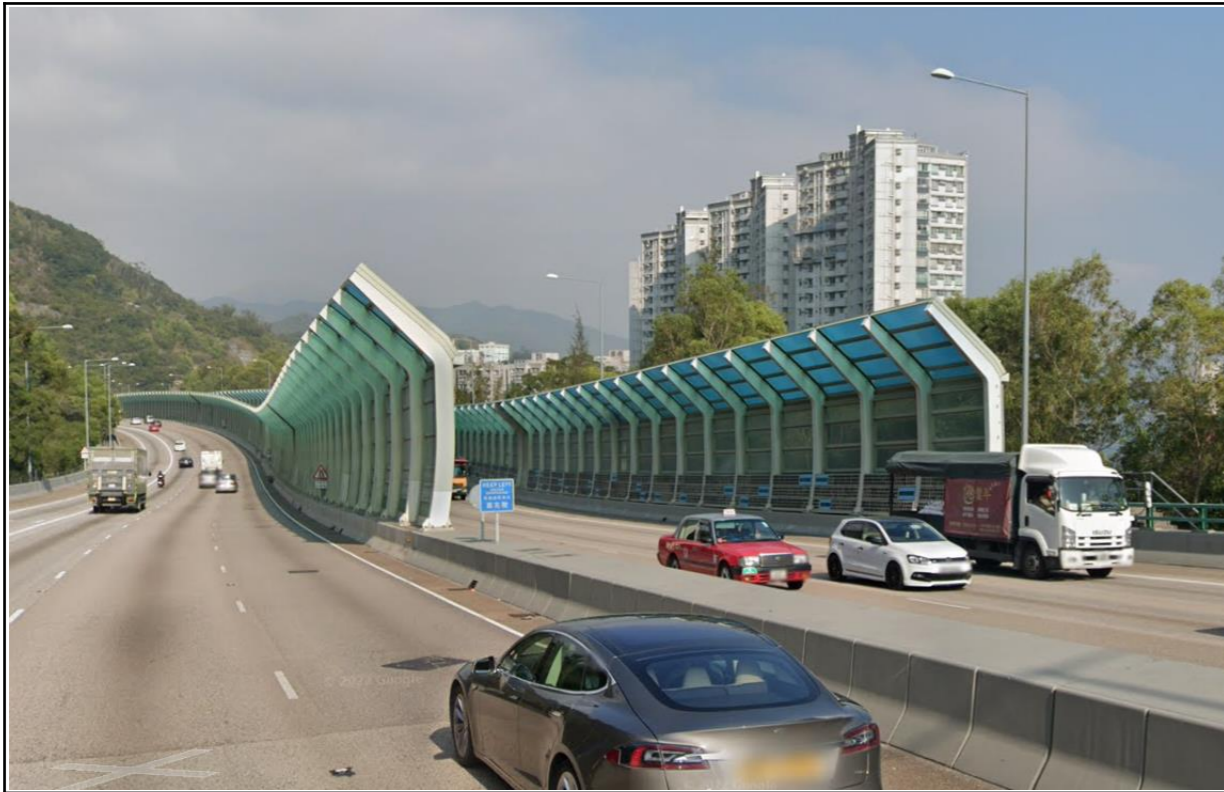
LR-TL11 – Developed Areas in Tsing Lung Tau