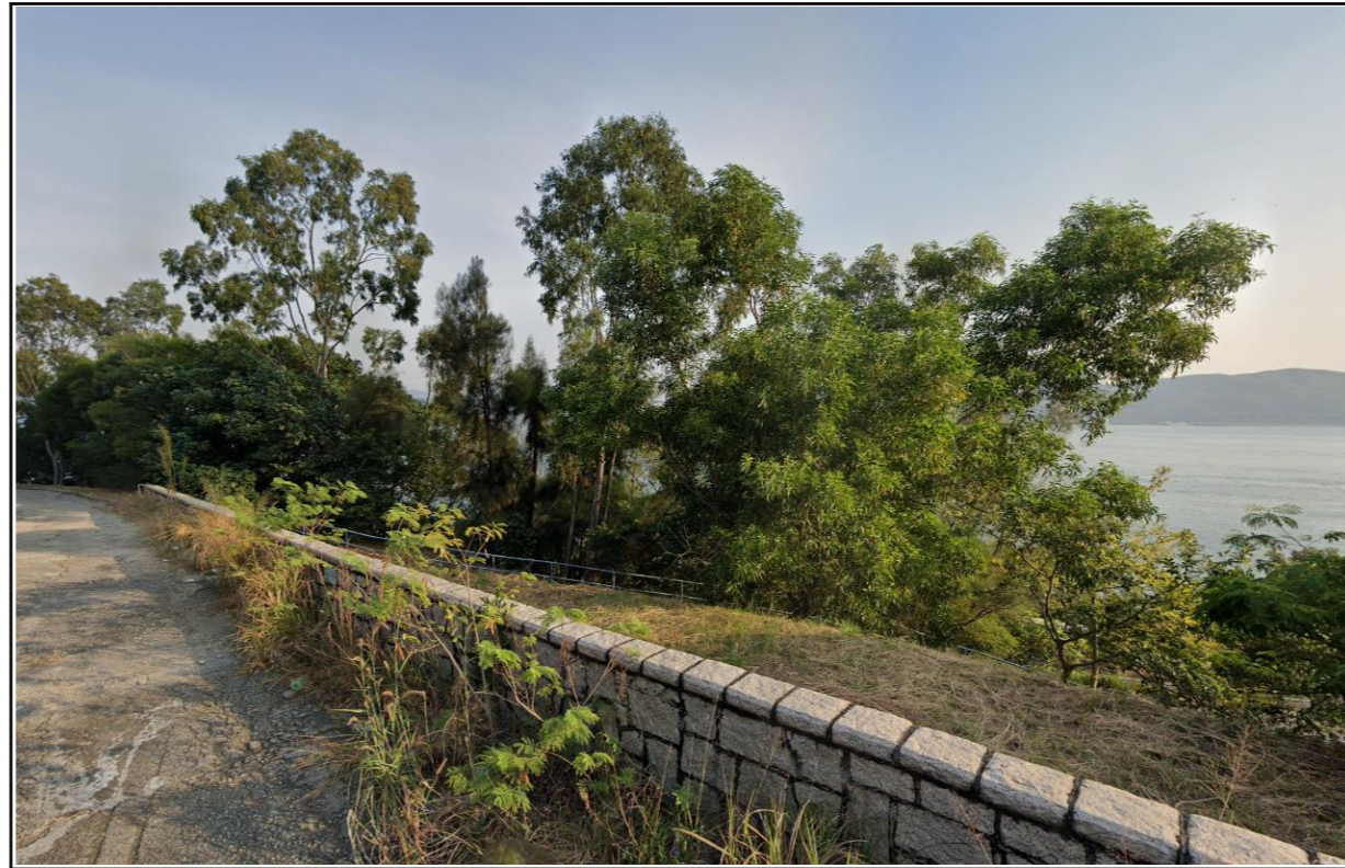
LR-TL2 – Plantations / Mixed Woodlands in Tsing Lung Tau