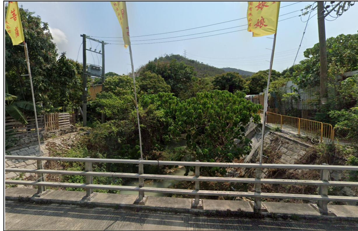
LR-LT7 – Watercourses in Lam Tei