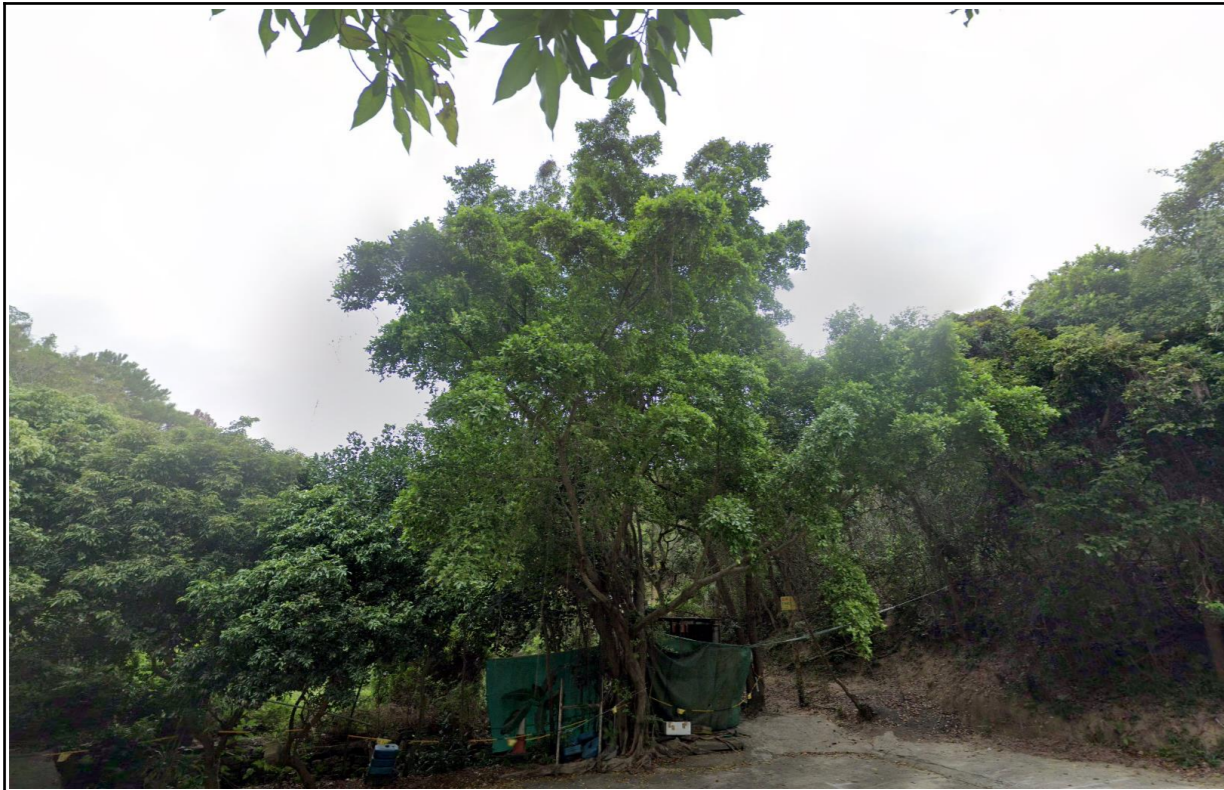
LR-SK1 – Secondary Woodlands in So Kwun Wat