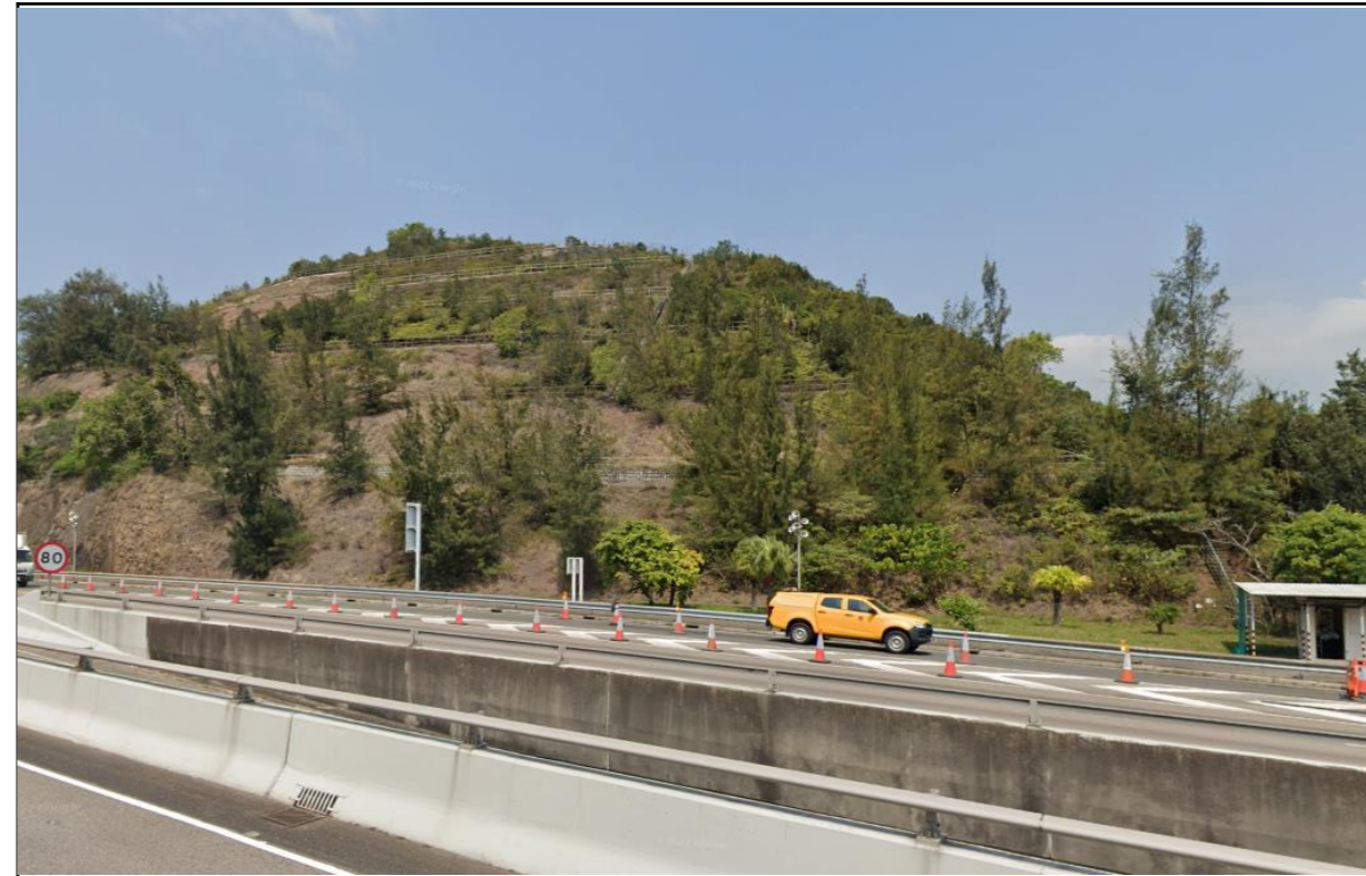
LR-NL2 – Plantations in North Lantau