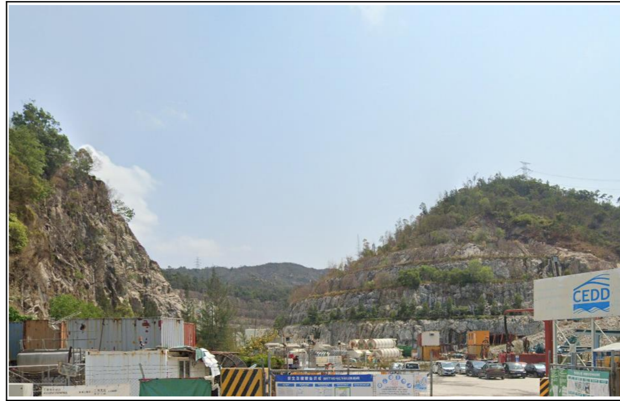
LR-LT2 – Plantations in Lam Tei