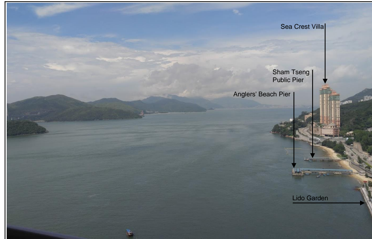
VSR-TL2 – Residents of Bellagio and Ocean Pointe