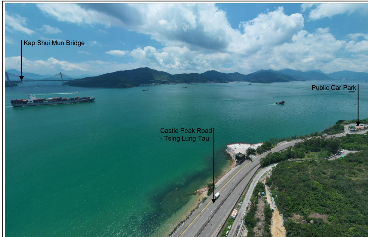
VSR-TL3 – Residents of Hong Kong Garden, Vista cove and L'Aquatique