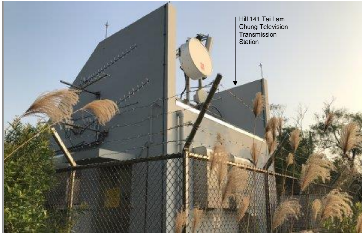
VSR-SK24 – Trail Walkers on Summit of Hill 141