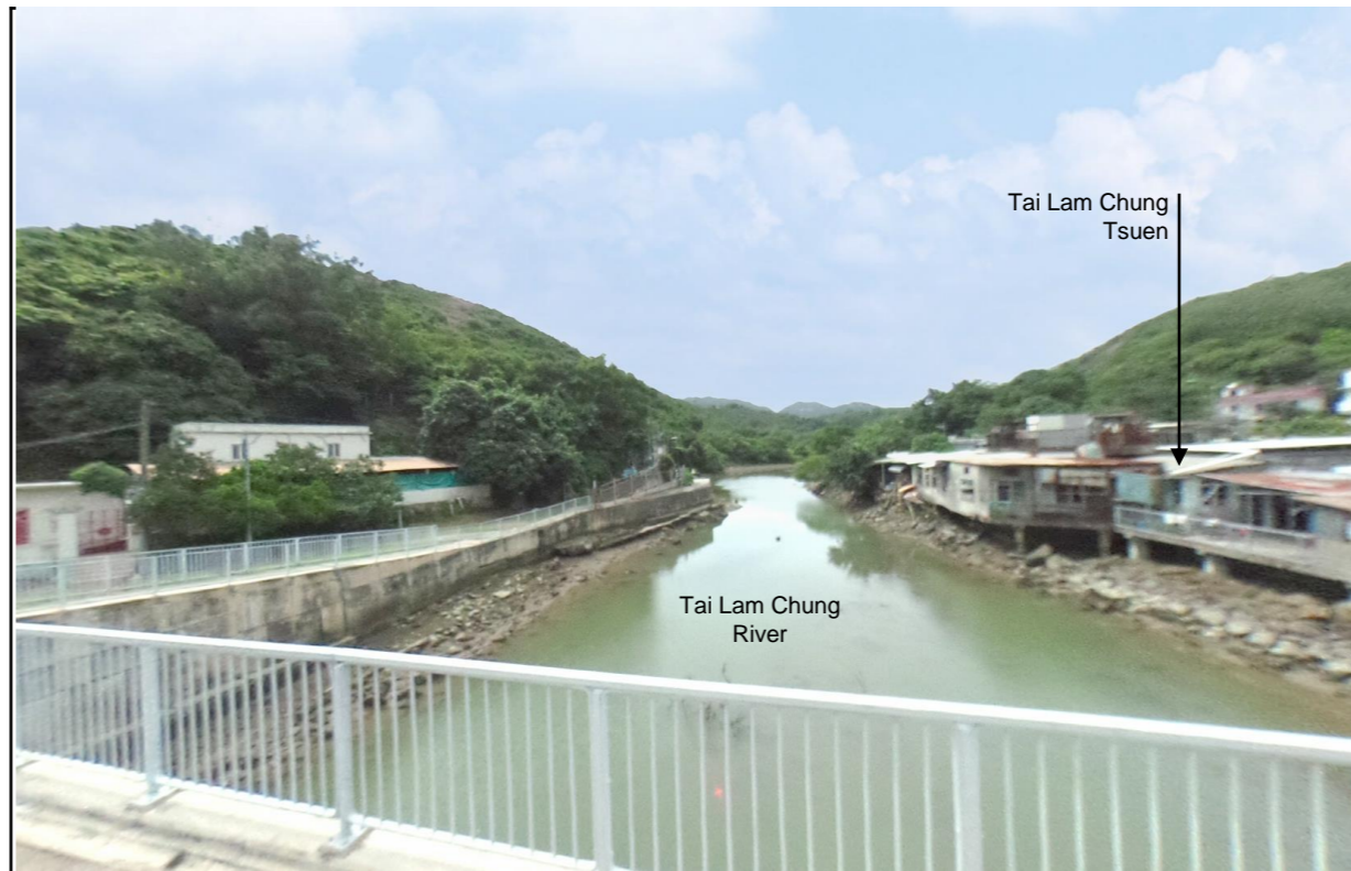
VSR-SK22 – Pedestrians on Footbridge over Tai Lam Chung River