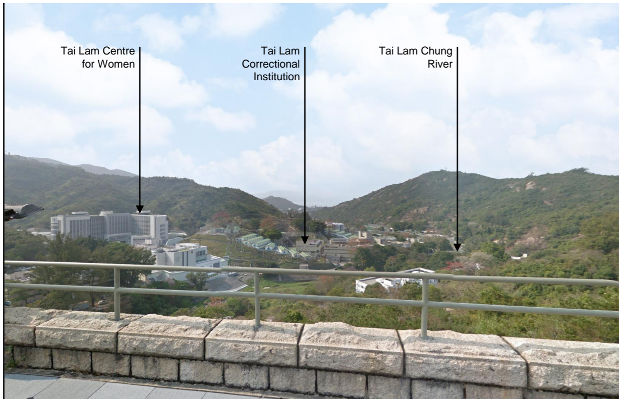
VSR-SK21 – Trail Walkers and Cyclists on Tai Lam Chung Reservoir Main Dam