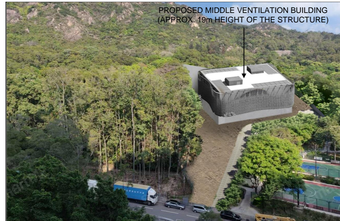
DAY 1 WITHOUT MITIGATION MEASURES